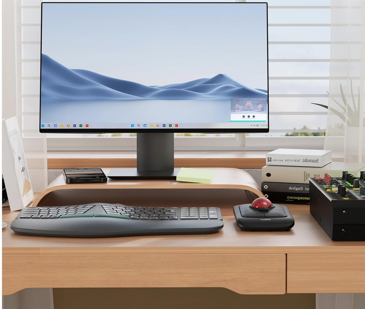
Image: The Nulea M511 Pro Trackball Mouse connected via its wired USB cable to a computer setup, demonstrating its plug-and-play functionality.