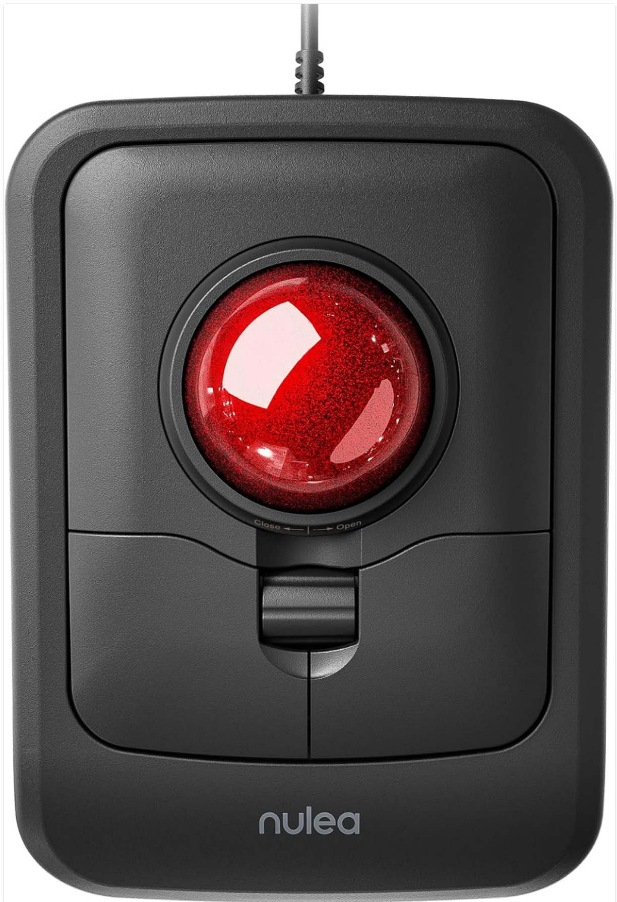
Image: Top-down view of the Nulea M511 Pro Trackball Mouse, highlighting its central trackball and button layout.