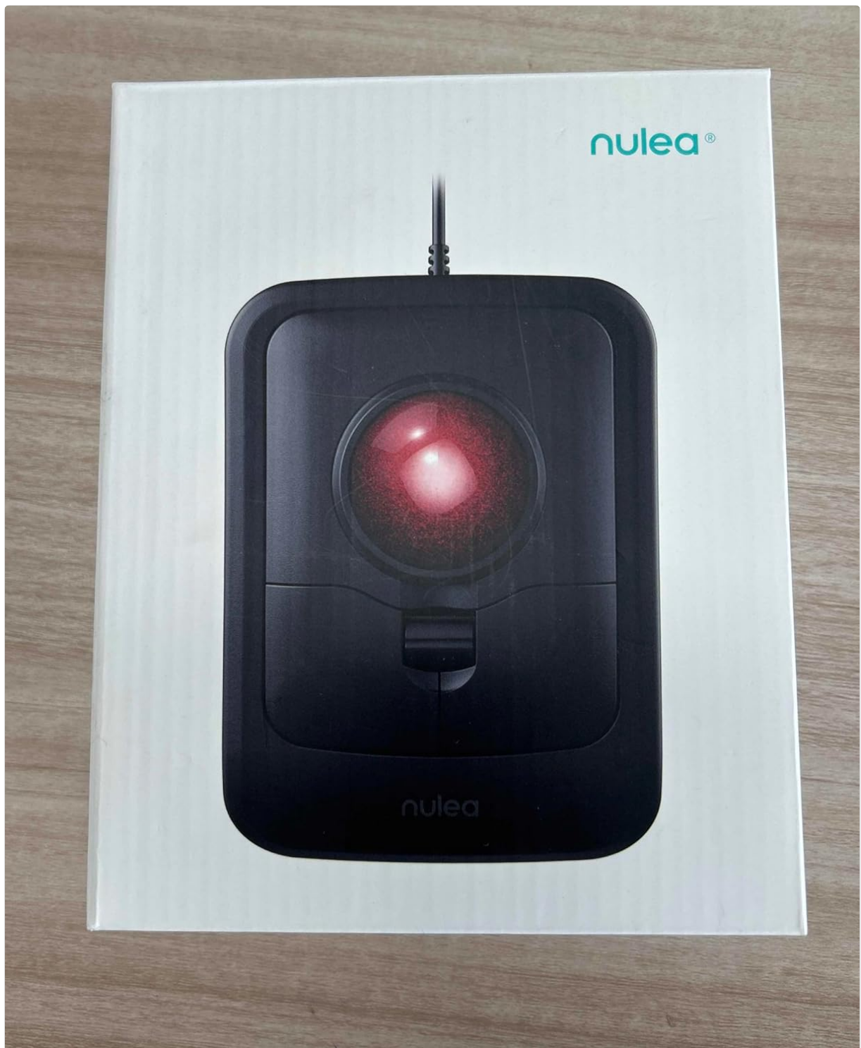
Image: The Nulea M511 Pro Trackball Mouse shown in its retail packaging.