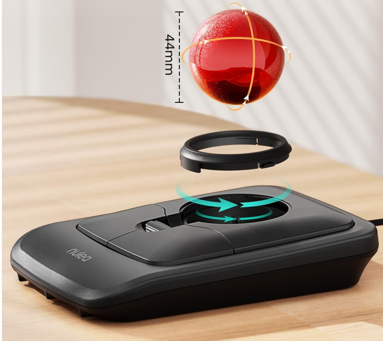
Image: A visual guide demonstrating how to remove the 44mm trackball from the mouse for cleaning, showing the trackball and its retaining ring.

44mm Diameter for Enhanced Precision & Efficiency