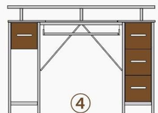
Image: A close-up view of the four fabric storage drawers, demonstrating their capacity for various items and illustrating different configuration possibilities for the drawers within the desk's shelving units.