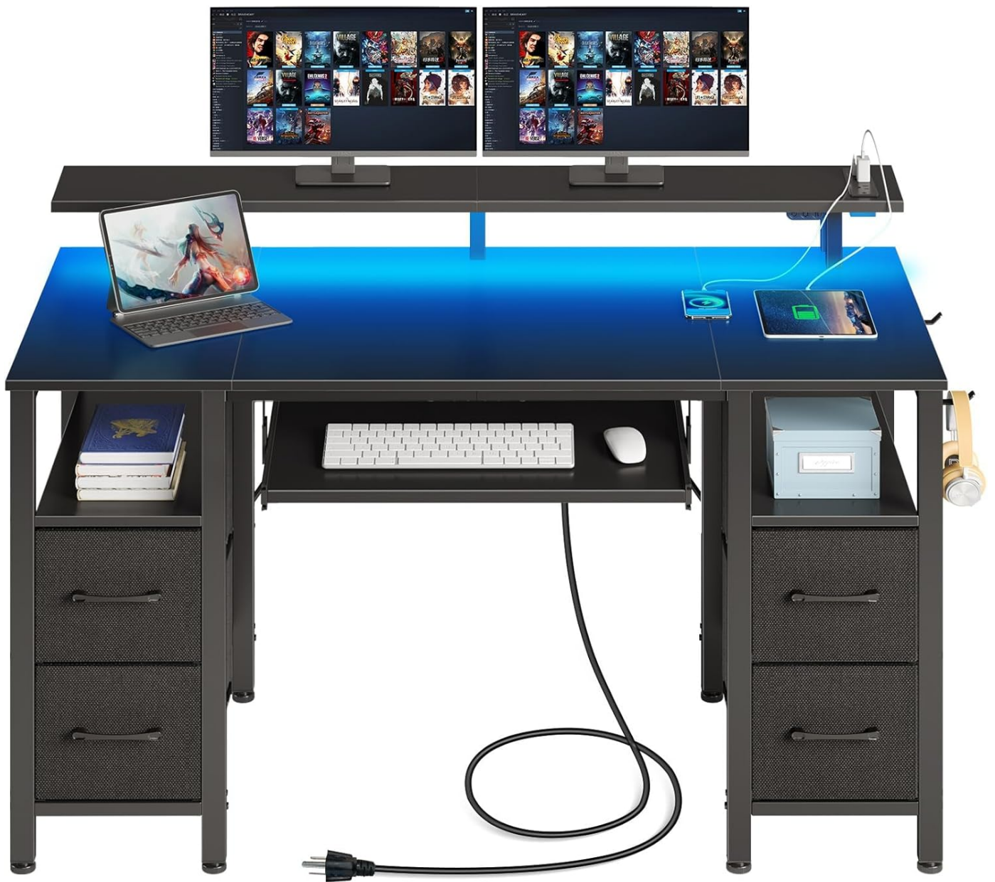
Image: The Seventable Computer Desk, showcasing its dual monitor stand, integrated LED lighting, and spacious desktop with a laptop and charging devices.