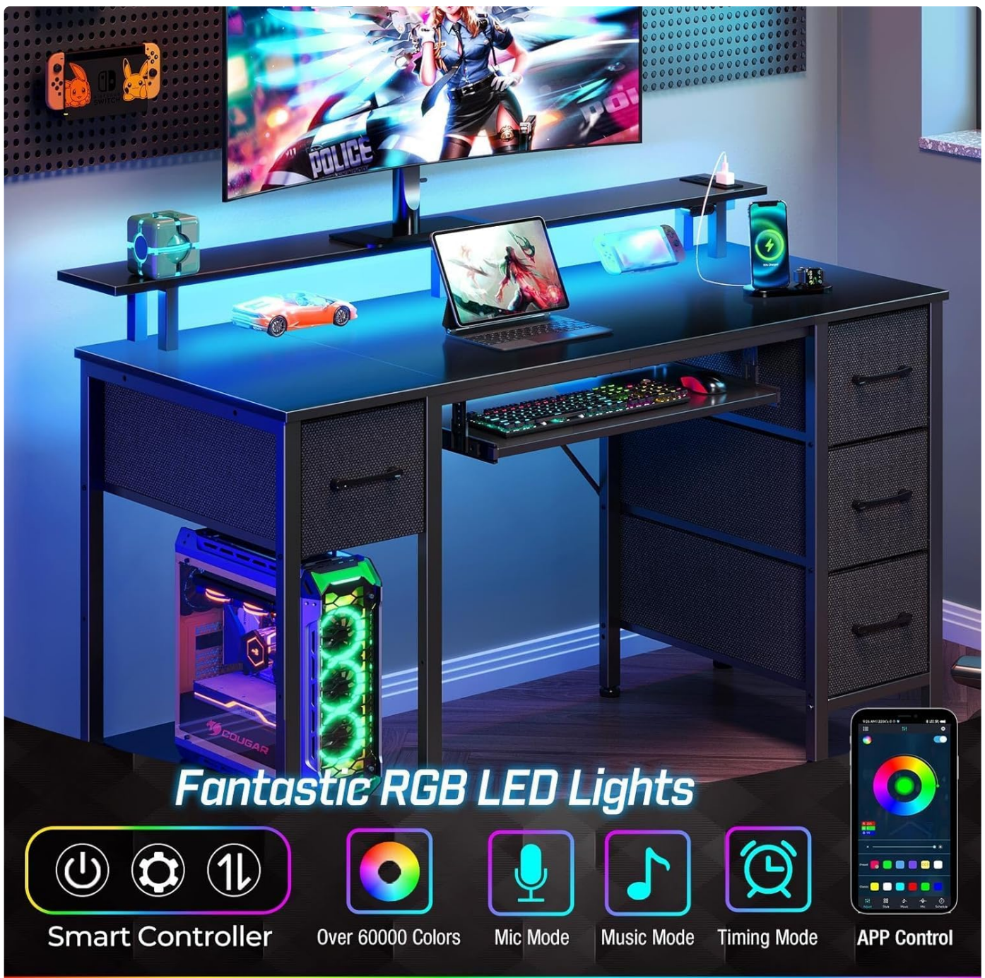
Image: The desk illuminated by colorful RGB LED lights, with icons indicating features like smart controller, over 60,000 colors, microphone mode, music mode, and timing mode.