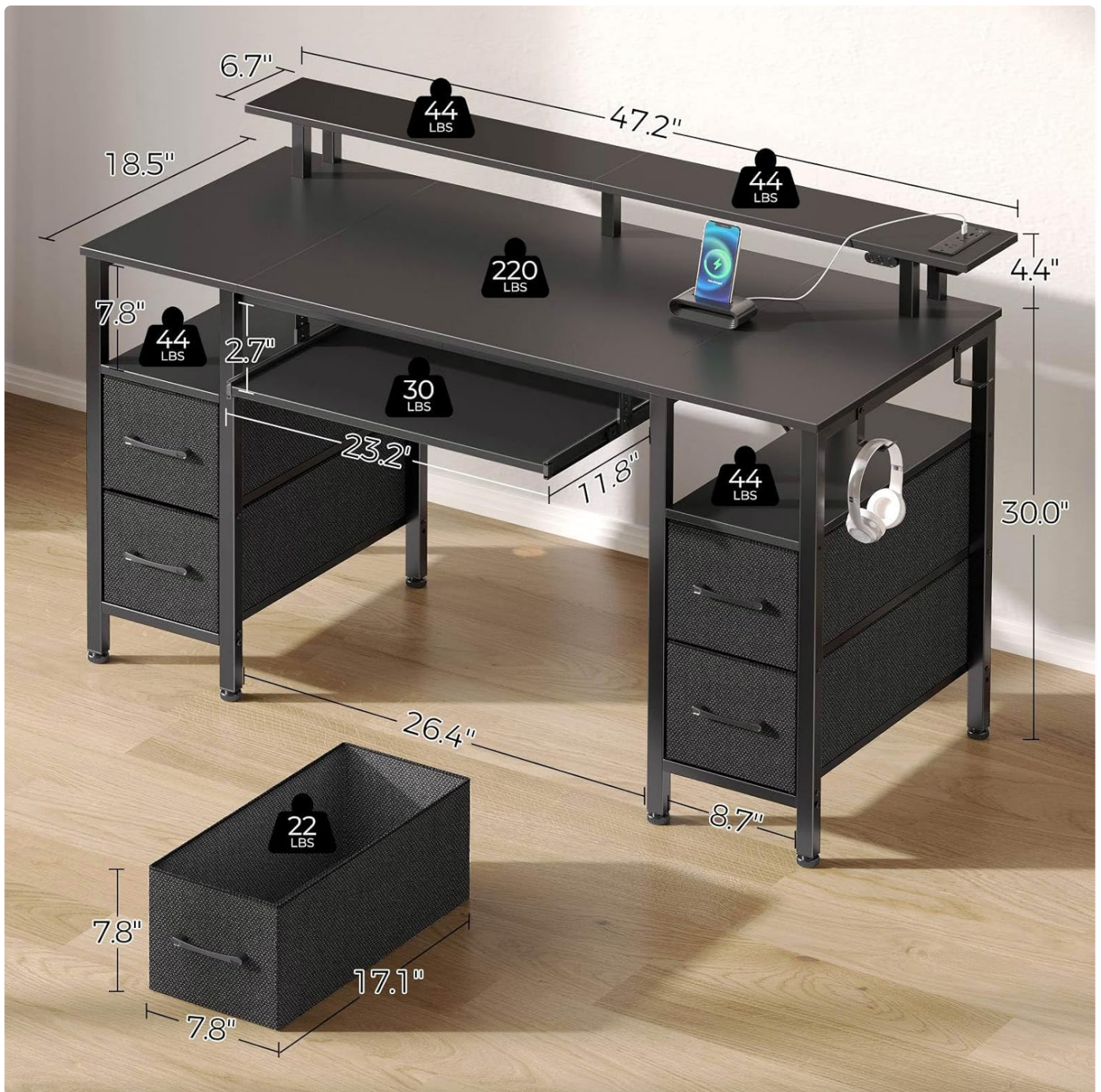
Image: Detailed diagram illustrating the dimensions and weight capacities of various parts of the Seventable Computer Desk, including the desktop, monitor stand, keyboard tray, and drawers.