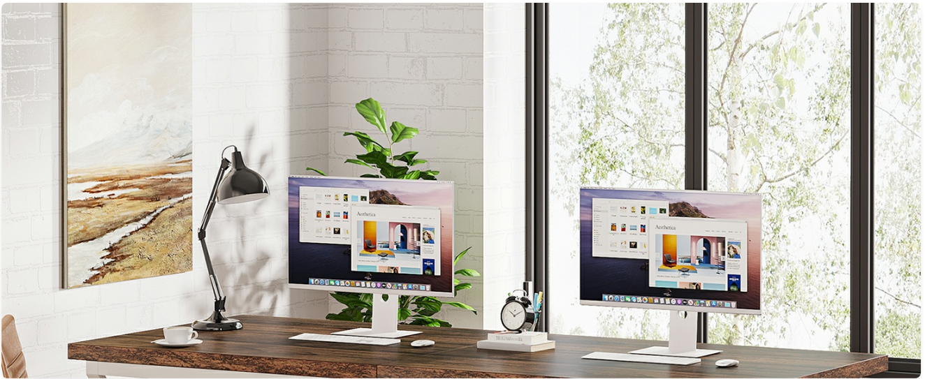
Image: Examples of the desk's versatility, showcasing its use as a conference table, a computer desk, and a dining table.