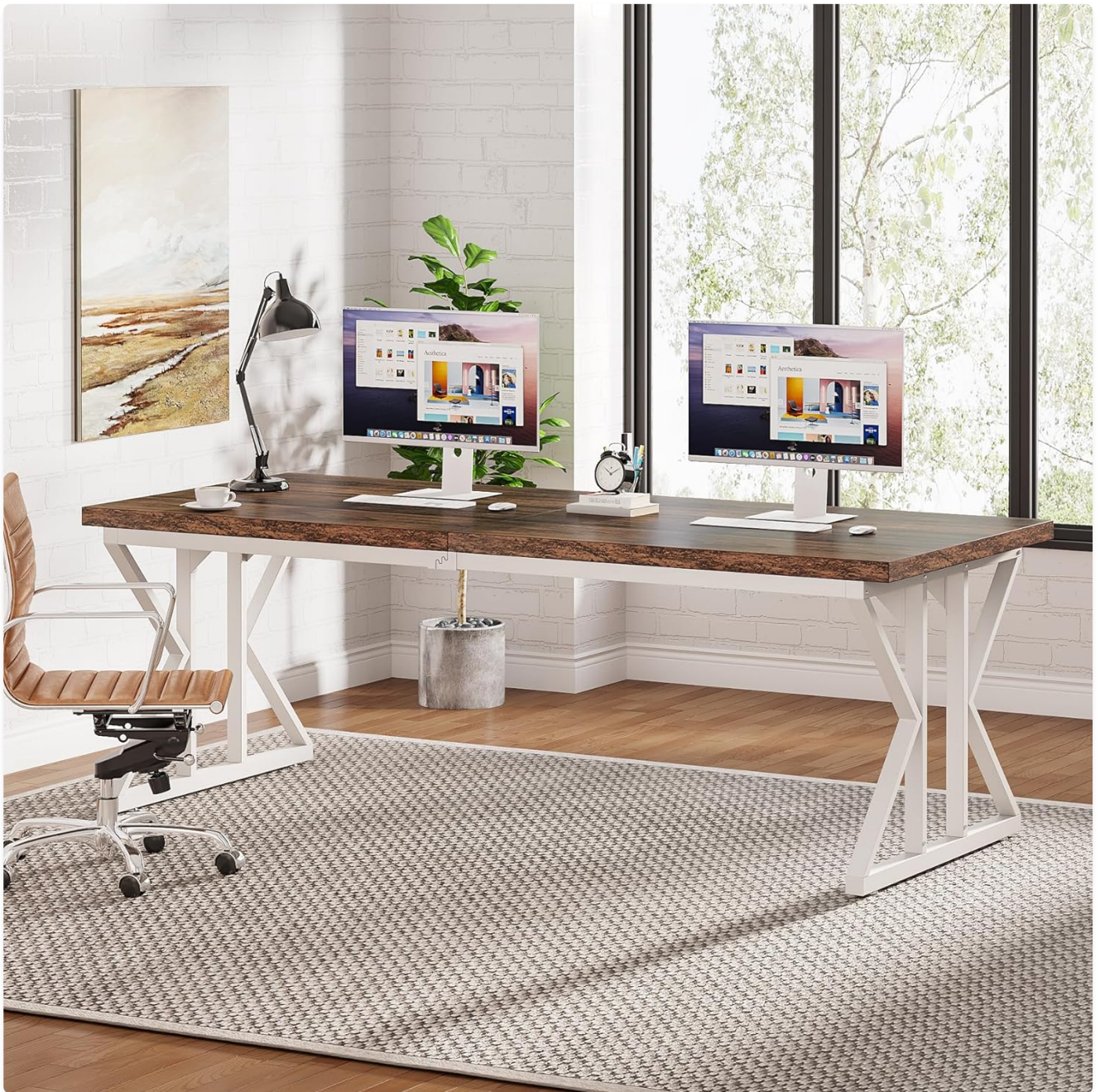
Image: The Tribesigns 78.7-Inch Executive Desk, showcasing its spacious design and modern aesthetic in a home office environment.