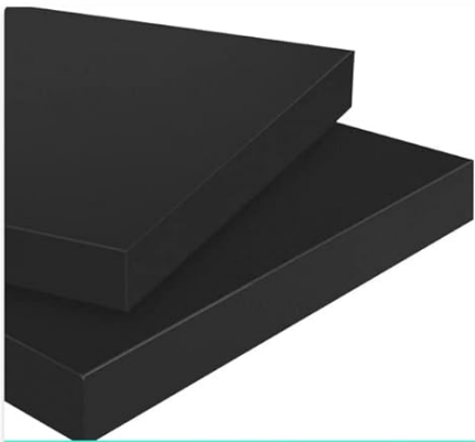
P2 Grade Plywood