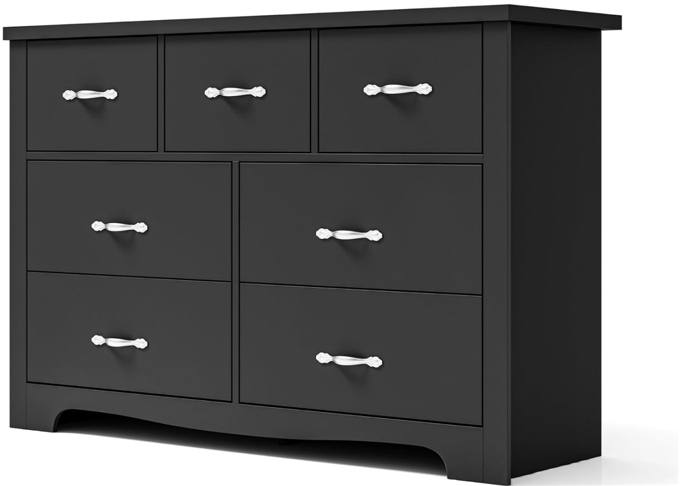
Image: Front view of the LINSY HOME 7-Drawer Dresser in black with silver handles.