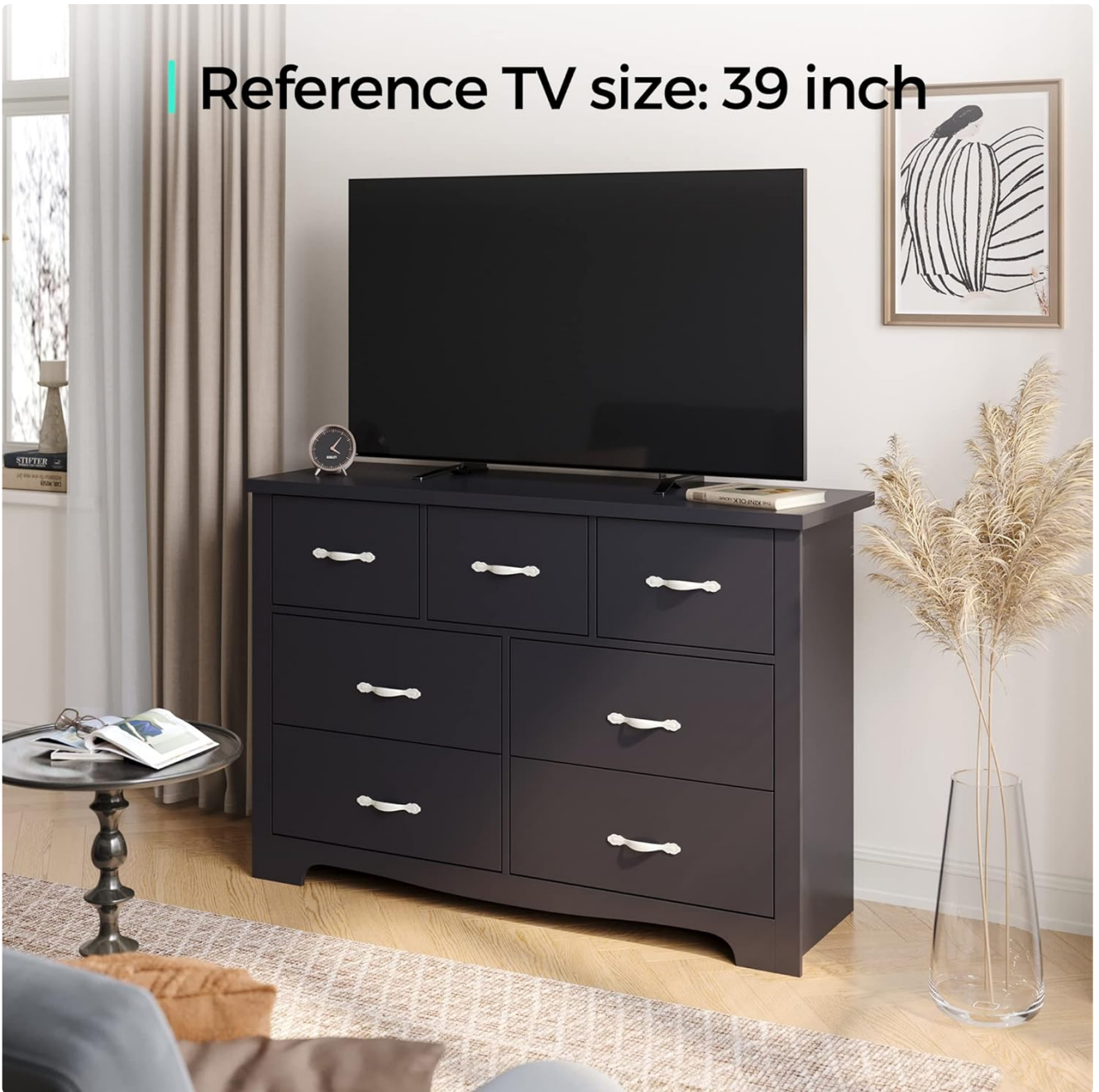
Image: A dresser with a television placed on its top surface, illustrating its capacity to hold a 39-inch TV.