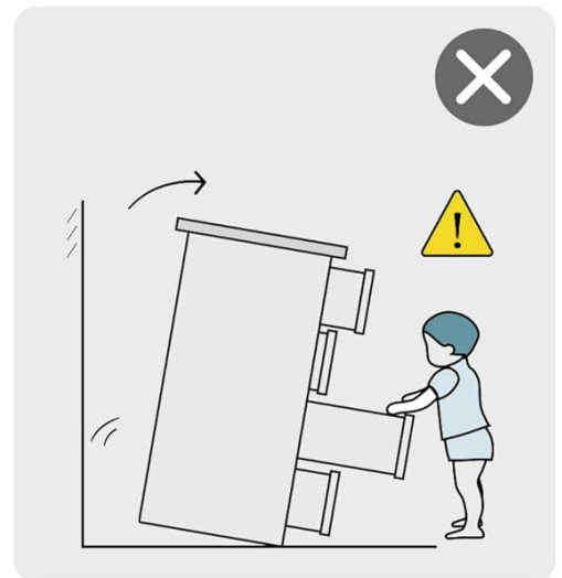
Image: Illustration demonstrating the proper installation of the anti-tip kit to secure the dresser to a wall, and a warning against tipping.