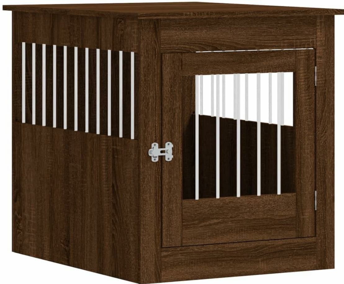
Image: The vidaXL Dog Crate Furniture, showcasing its dual functionality as a pet kennel and a stylish side table.