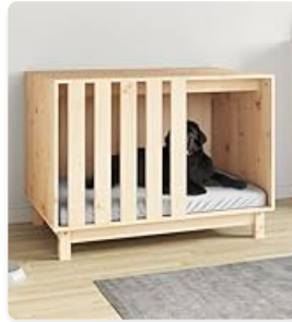
Image: Visual guide illustrating the assembly process of the dog crate furniture.