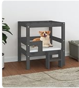
Image: A dog comfortably inside the crate, demonstrating its use as a pet enclosure.