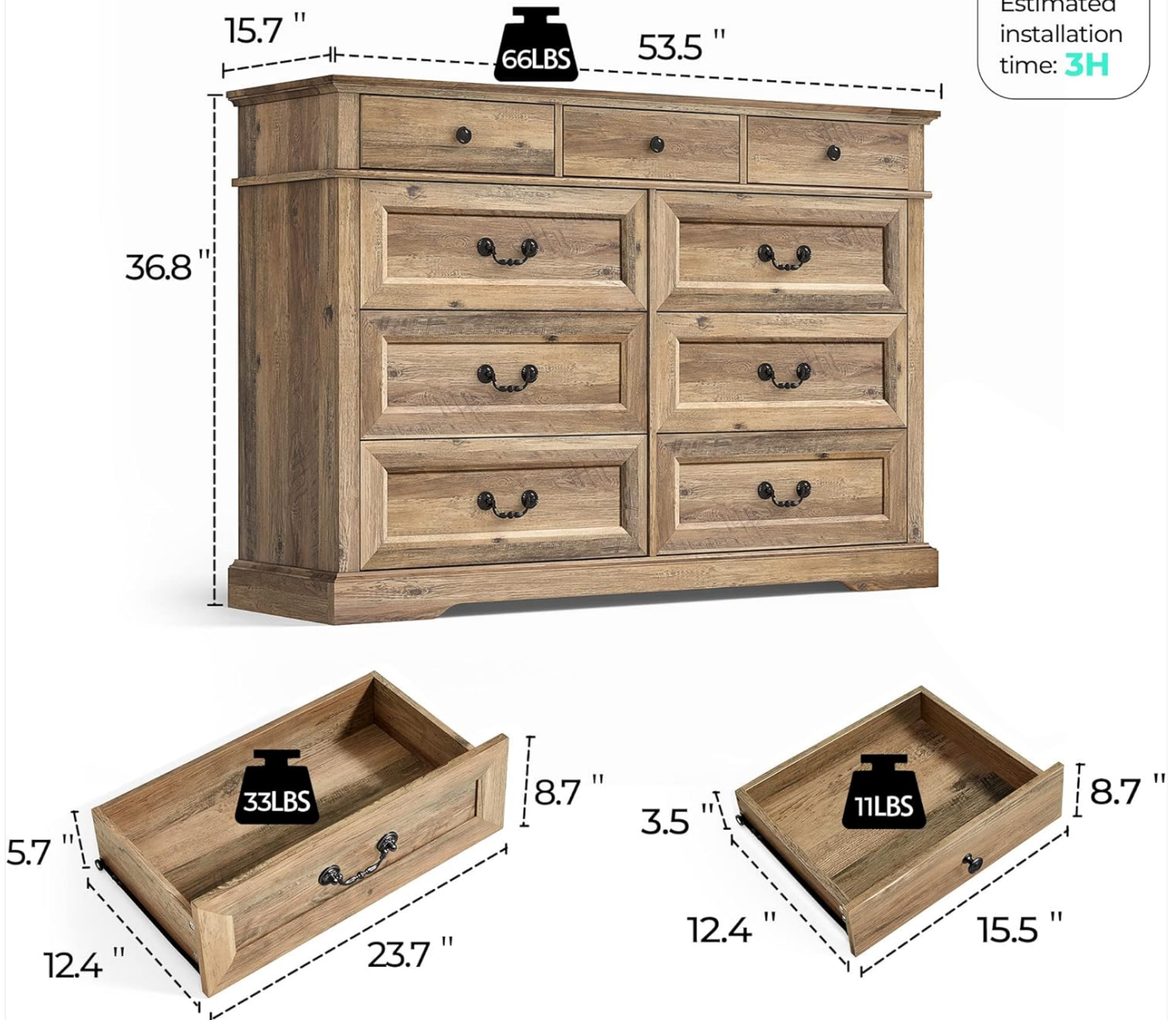
Image: A detailed diagram illustrating the overall dimensions of the dresser (15.7"D x 53.5"W x 36.8"H) and the internal dimensions of its various drawers, along with estimated assembly time.