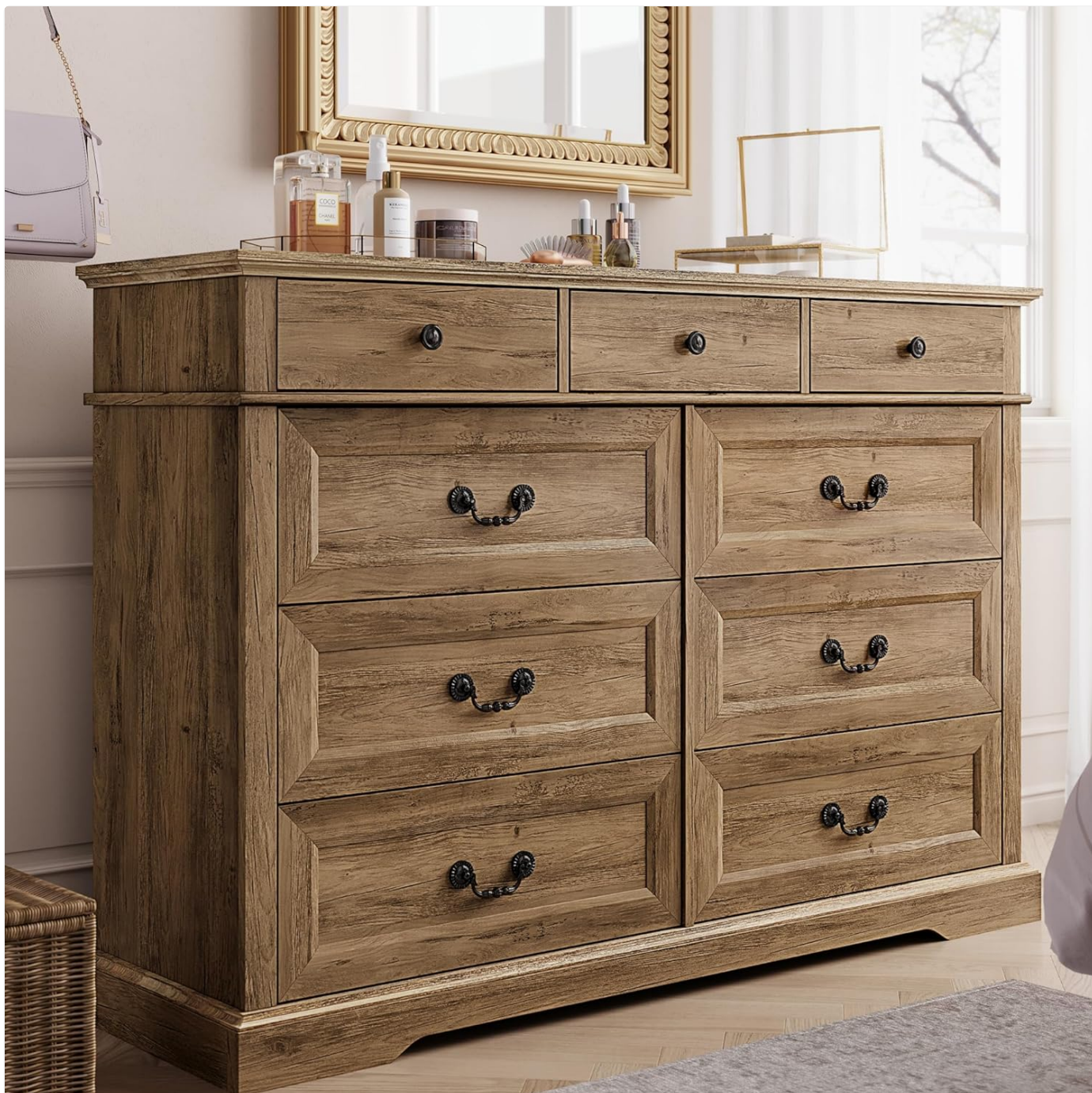
Image: The LINSY HOME 9-Drawer Dresser, showcasing its farmhouse design and ample storage capacity in a bedroom environment.