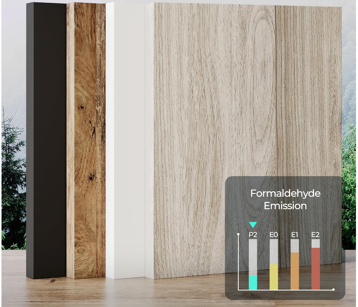
Image: An illustration of the P2 Grade Plate material used in the dresser's construction, indicating low formaldehyde emission for environmental and health safety.