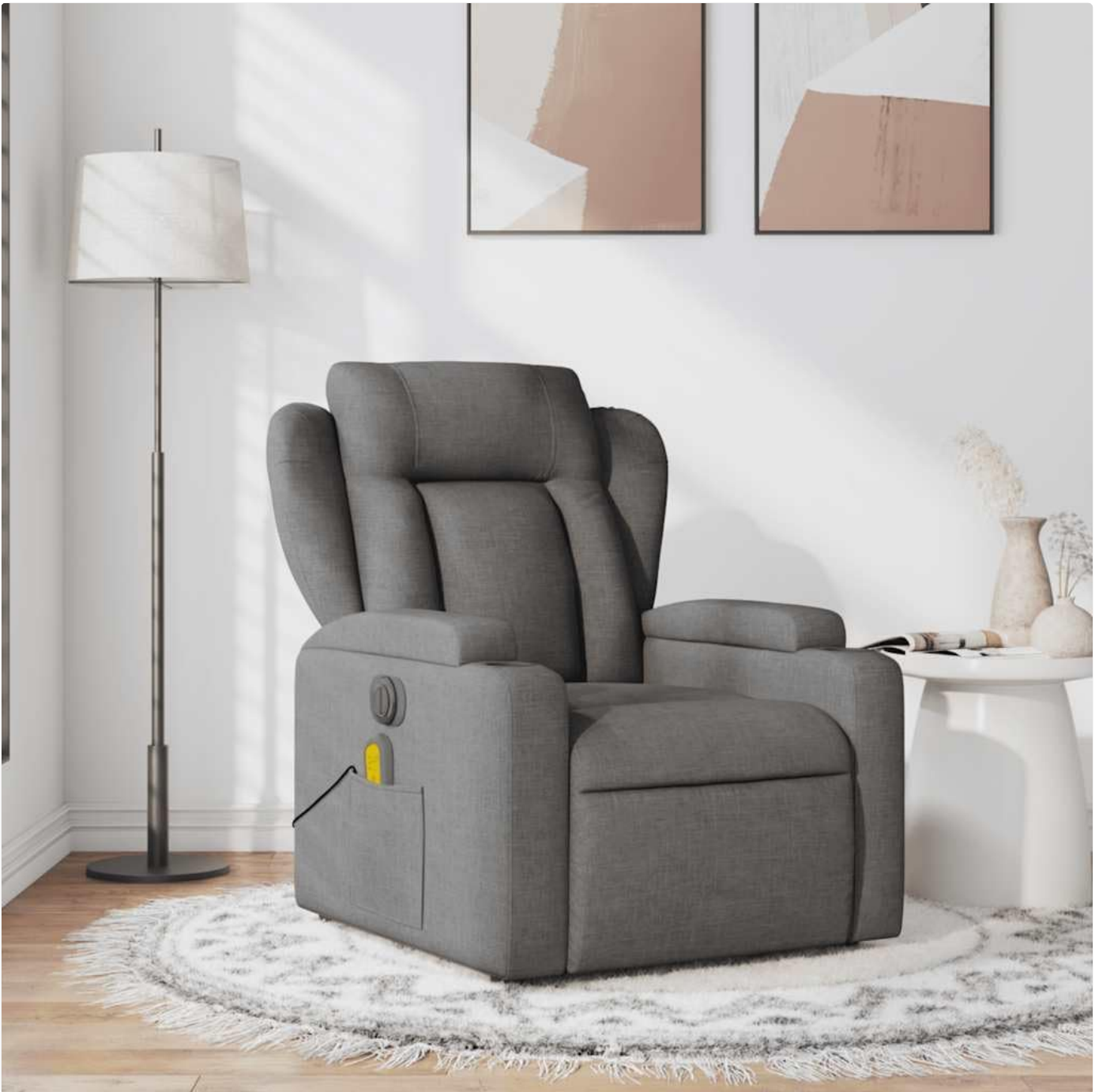
Image: The vidaXL Recliner Massage Armchair, dark grey fabric, positioned in a modern living room next to a floor lamp and a small side table.