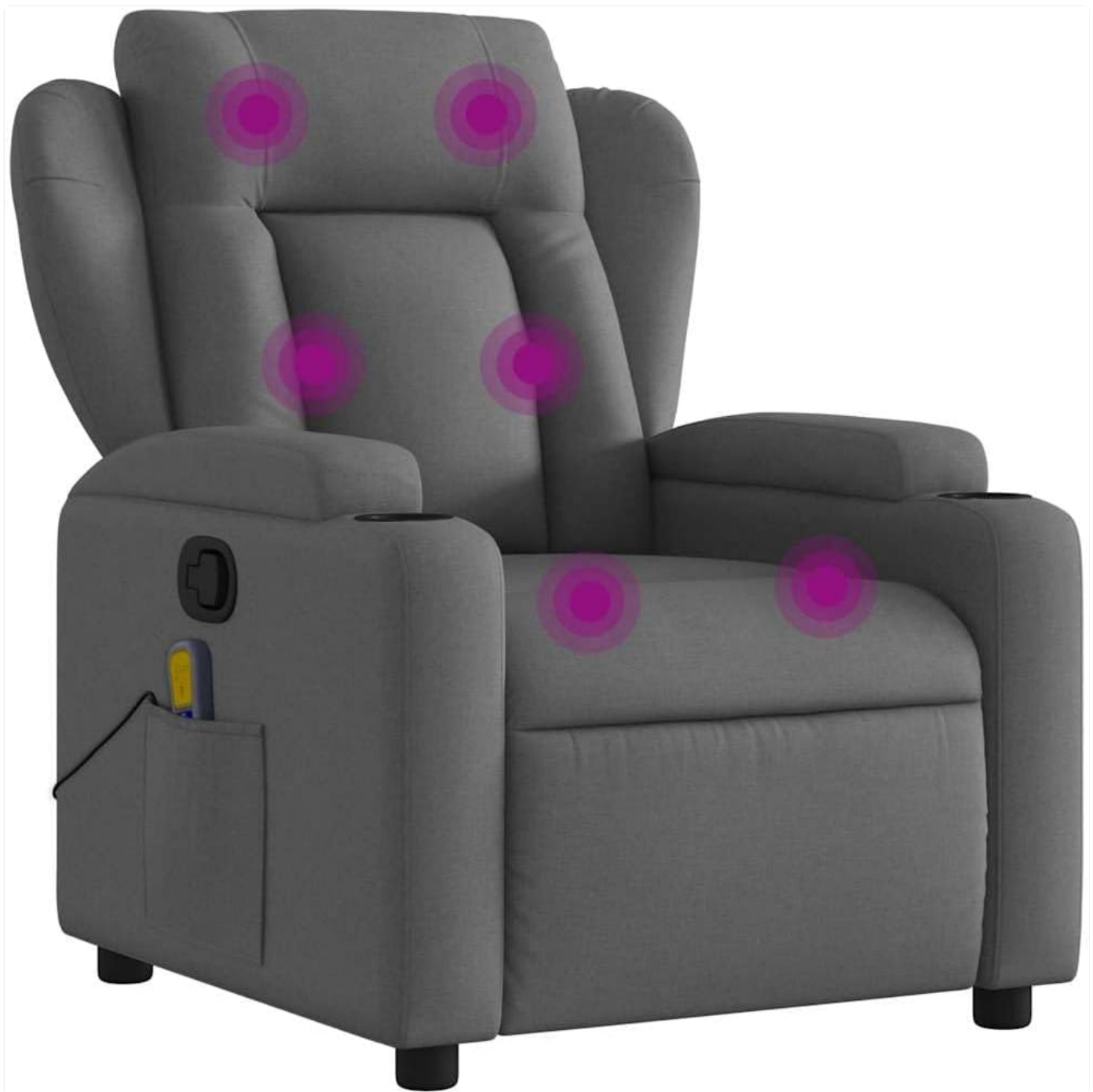
Image: The recliner with purple circles indicating the six vibration massage points on the backrest, lumbar, and seat areas.