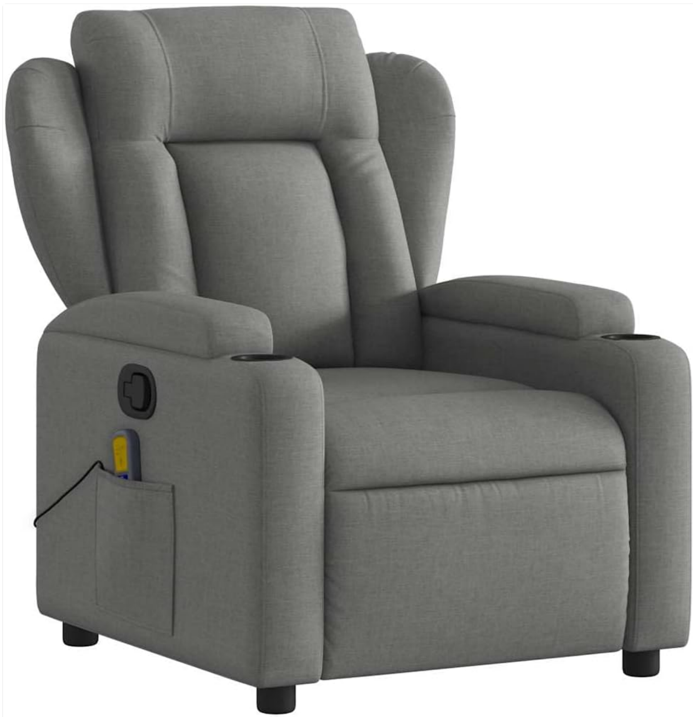
Image: A close-up view of the armchair's armrest, clearly showing the integrated cup holder and the side storage pocket with the massage remote control inside.