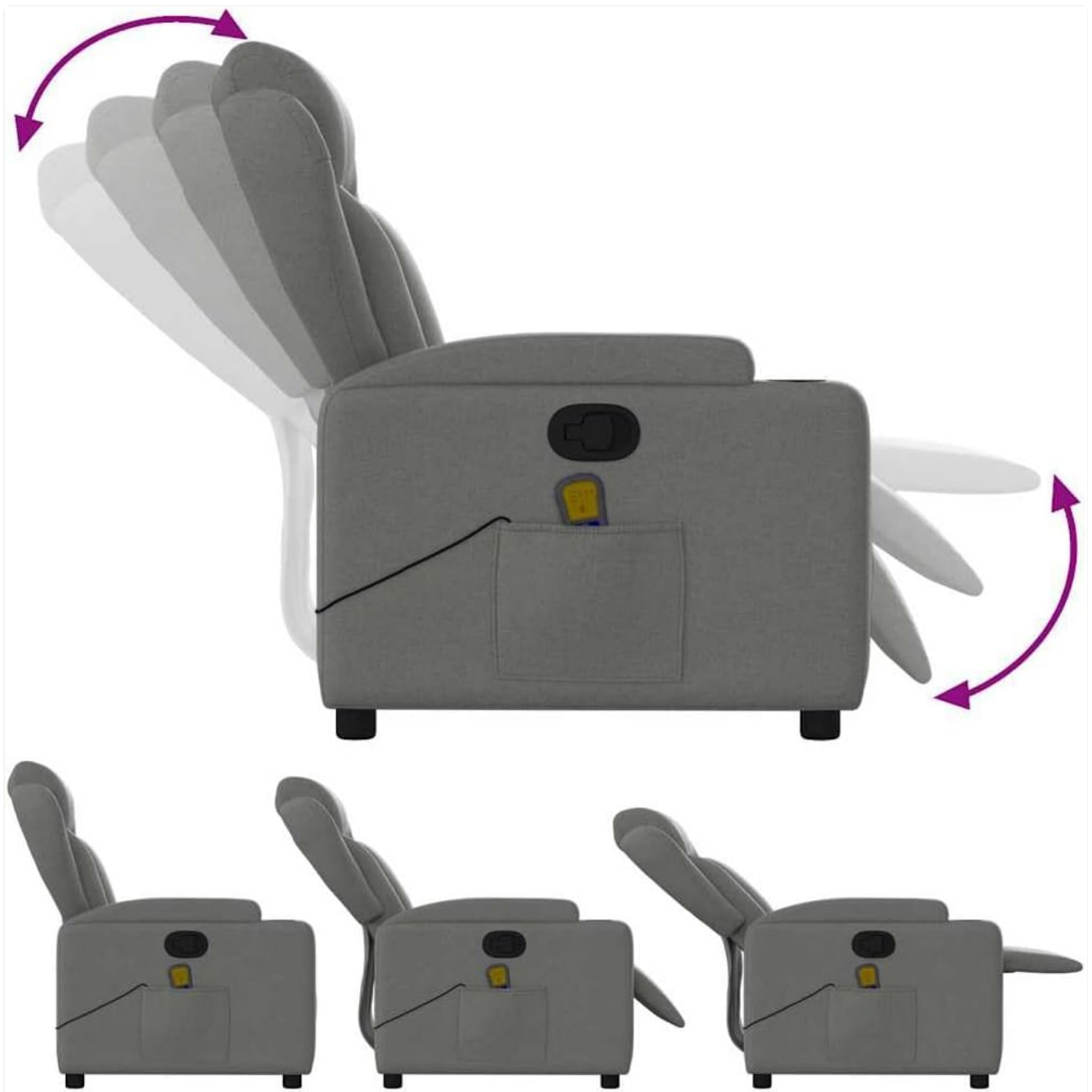
Image: A sequence of illustrations showing the armchair transitioning from an upright position to a fully reclined position, demonstrating the manual recline function.