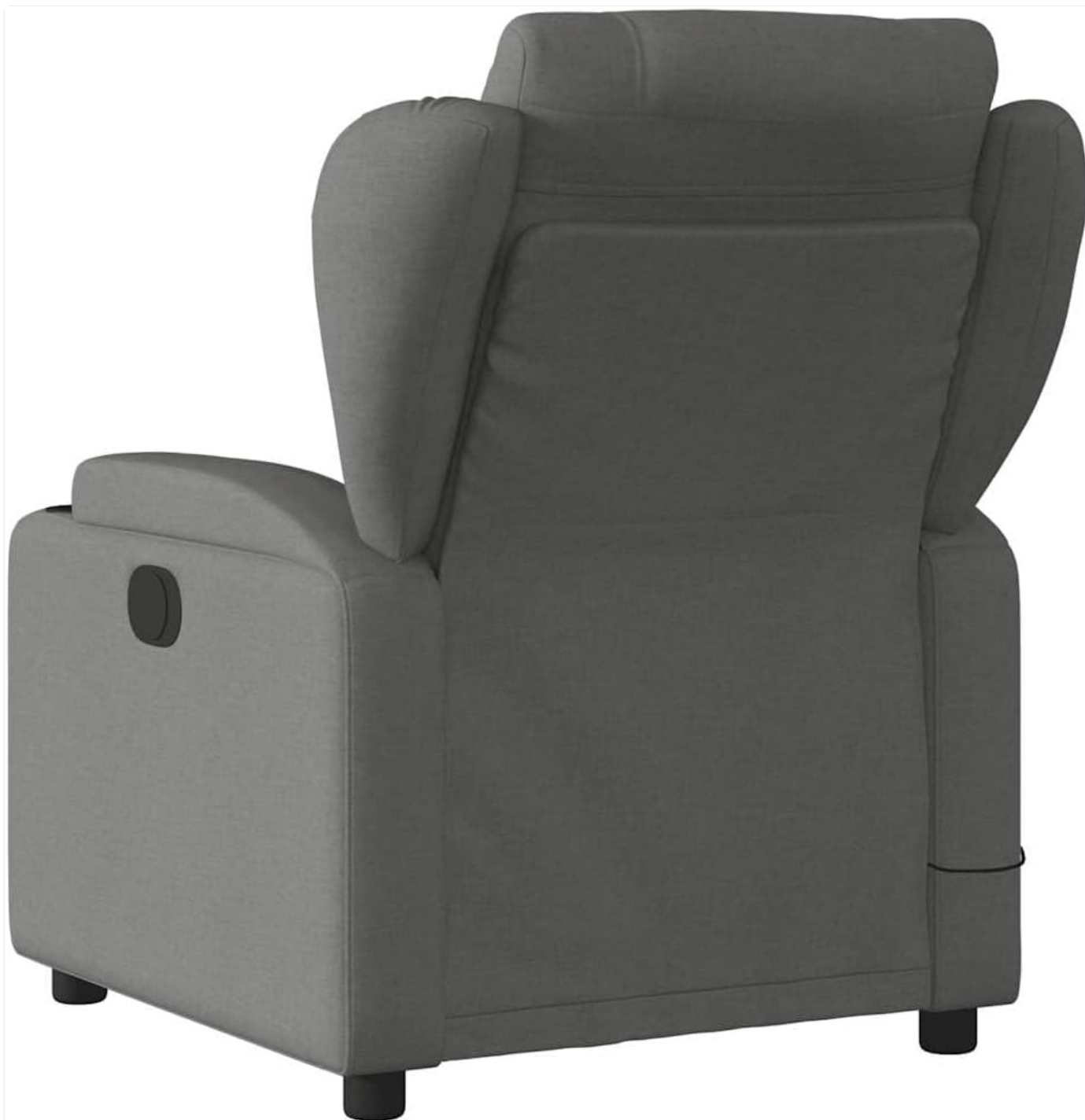
Image: Rear view of the recliner, showing the back of the chair and the lower legs. This view can be helpful during assembly to ensure proper alignment of components.