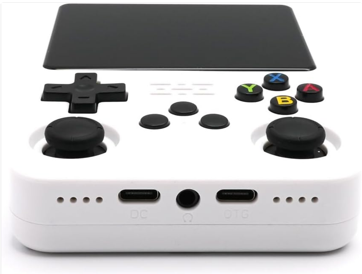
Figure 3.4: Bottom view of the Retrotech R36S Handheld Console, showing the DC (charging) USB-C port, 3.5mm headphone jack, and OTG (On-The-Go) USB-C port.