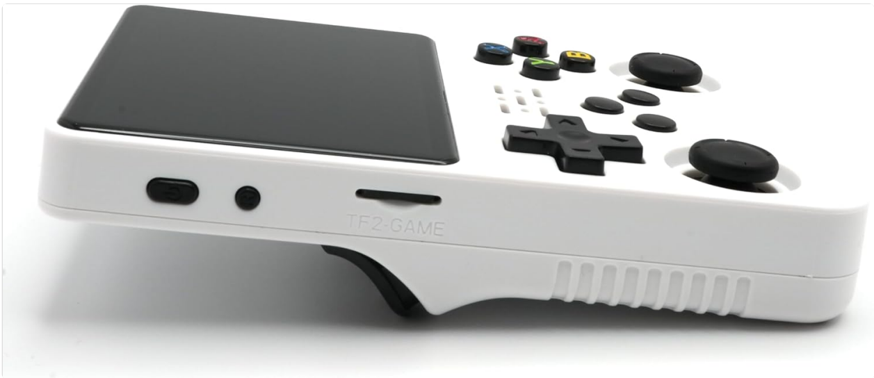
Figure 3.3: Side view of the Retrotech R36S Handheld Console, highlighting the power button, volume buttons, and the TF2-GAME card slot.