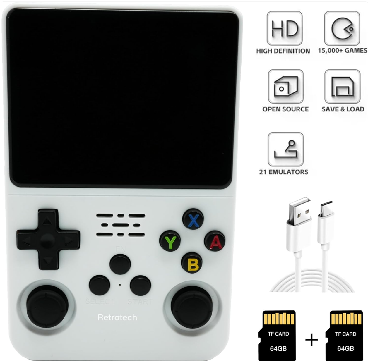
Figure 3.2: Retrotech R36S console displaying key features such as HD display, 15,000+ games, open source, save & load functionality, 21 emulators, and included 64GB TF cards and USB-C charge cable.