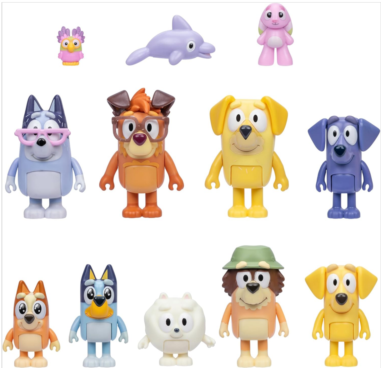
The complete Bluey Super Fan Figurines Set featuring 11 characters including Bluey, Bingo, and exclusive figures Joff and Pom Pom.