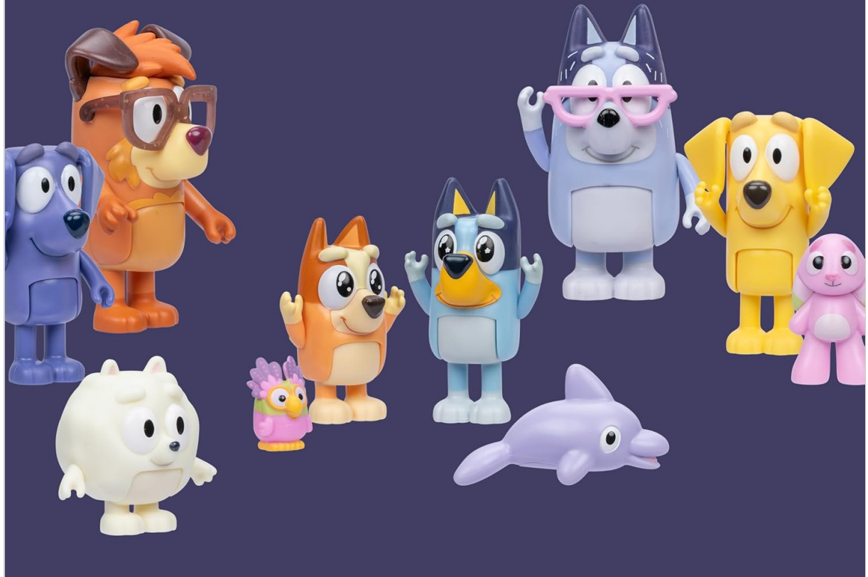
Bluey characters demonstrating their articulated limbs for various poses.