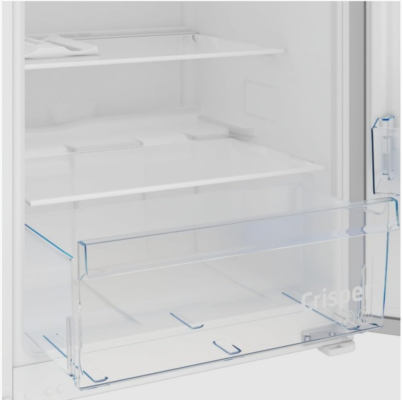
Image 2: Interior view of the Beko BLSA210M4SN refrigerator, showing adjustable glass shelves and a transparent crisper drawer for fresh produce.