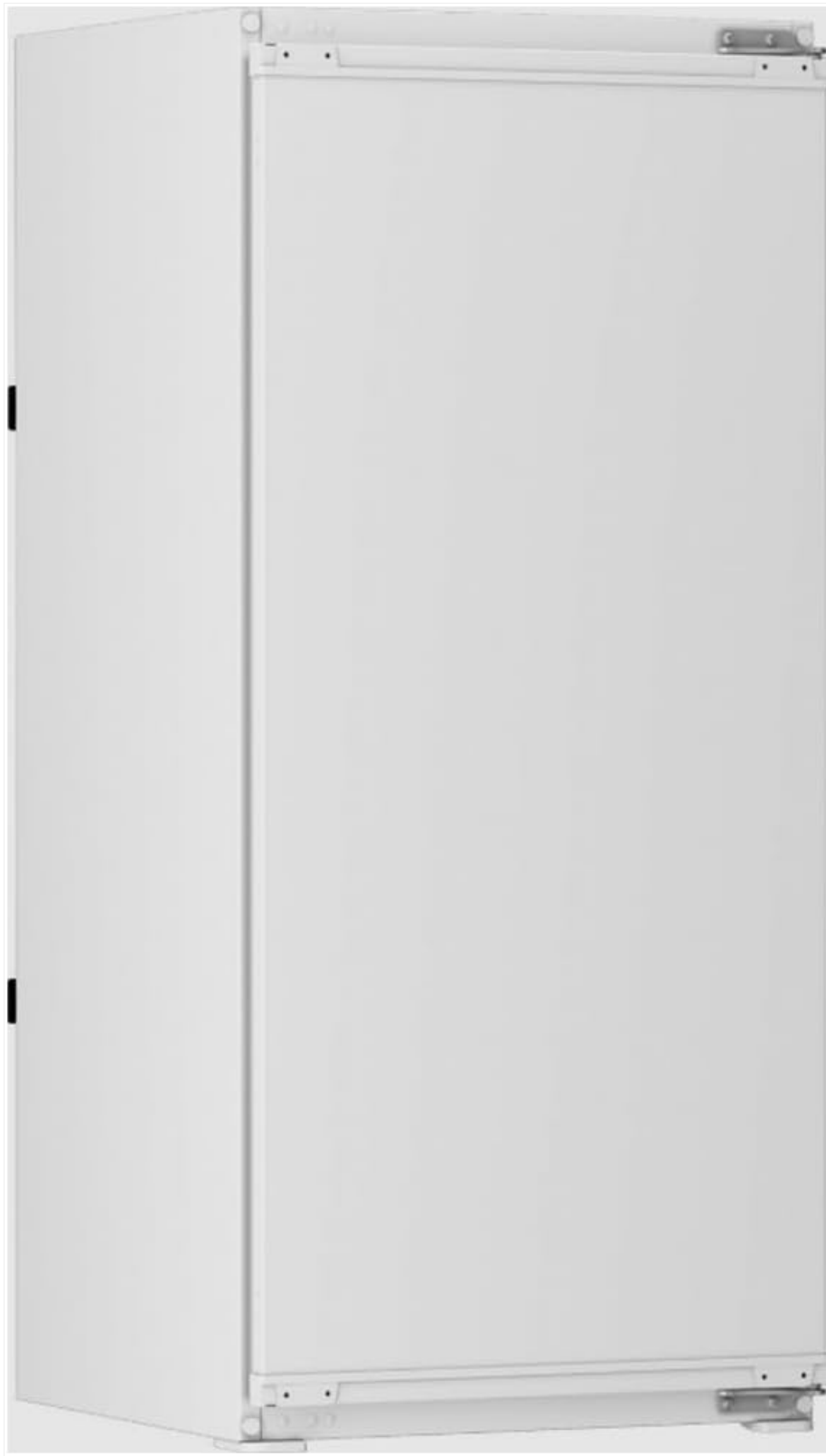
Image 1: Exterior view of the Beko BLSA210M4SN built-in refrigerator, showing its sleek design ready for integration into kitchen cabinetry.