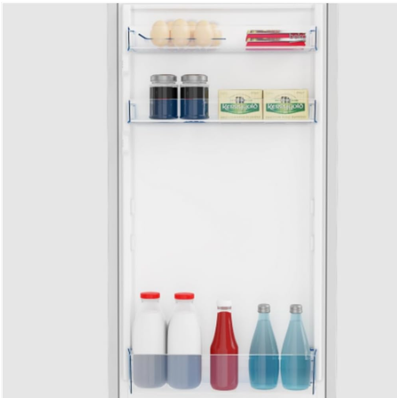
Image 3: Interior view of the Beko BLSA210M4SN refrigerator door, featuring multiple adjustable shelves for bottles, jars, and smaller items.