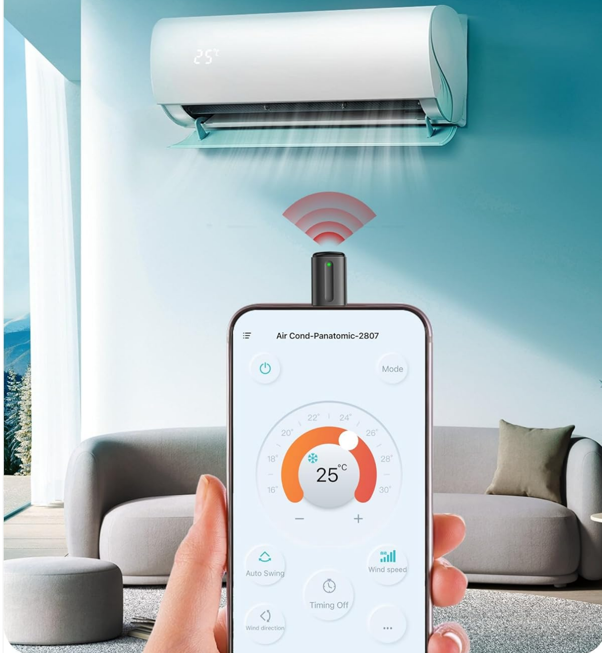
Image: The OCRUSTAR adapter plugged into an iPhone, displaying the app interface used to control an air conditioner.