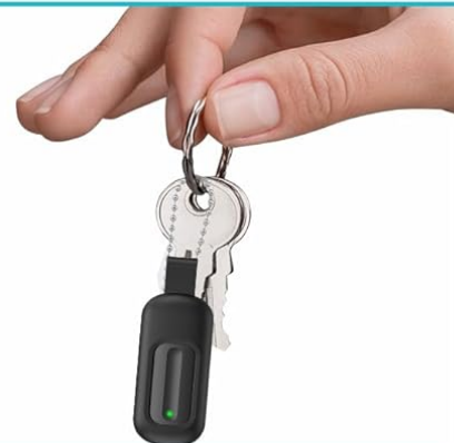
Image: Detailed view of the OCRUSTAR adapter highlighting its LED working indicator, protective silicone case, and key ring attachment.

Put it on your keychain to control multiple appliances anywhere, anytime