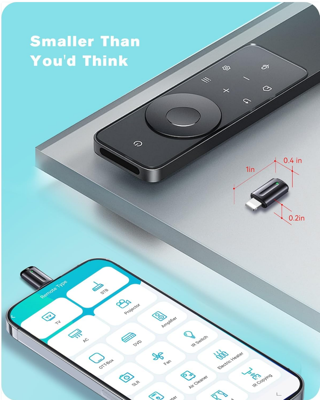
Image: The OCRUSTAR adapter's small form factor, illustrating its dimensions for portability.