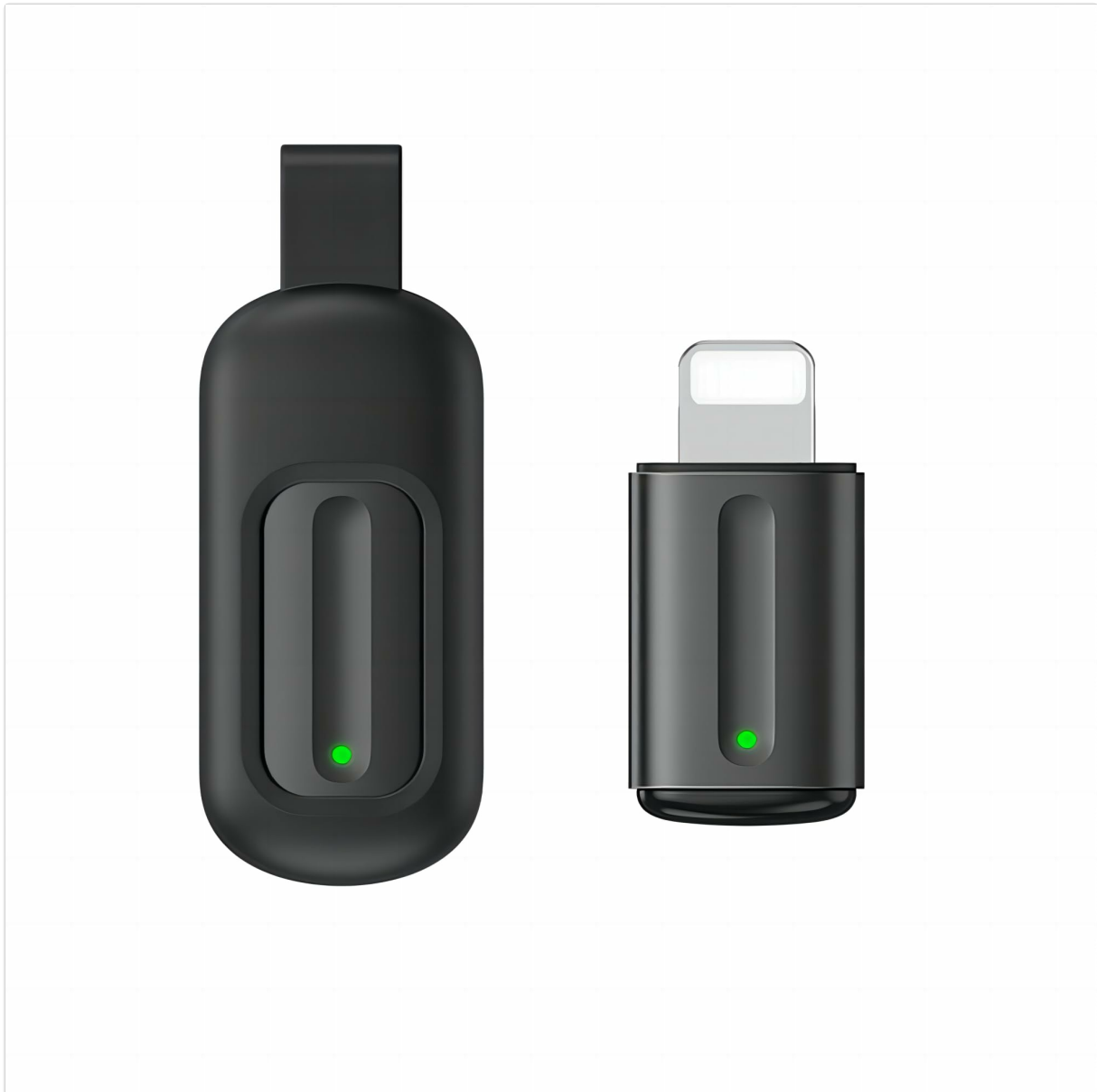
Image: The OCRUSTAR Universal Remote Control Adapter, showing its compact design and Lightning connector.