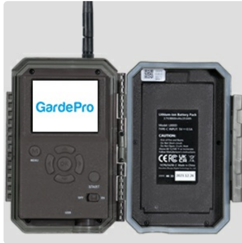
Image: The GardePro E6P Max camera showing its internal screen and control buttons.