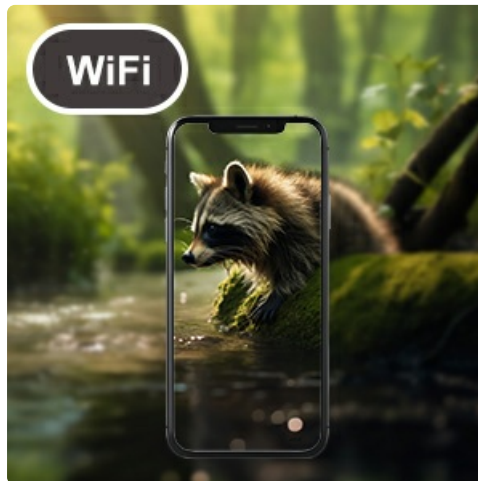
Image: A smartphone displaying the GardePro app interface, showing a captured image and indicating Wi-Fi connectivity.