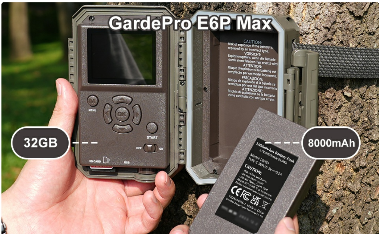
Image: The GardePro E6P Max trail camera securely mounted to a tree trunk using a strap.