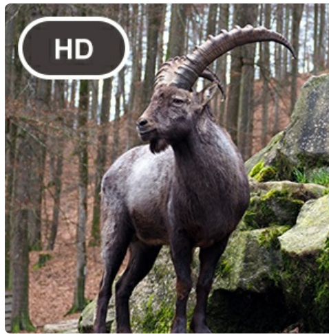
Image: A high-definition photo captured by the camera, showcasing a mountain goat in its natural habitat.