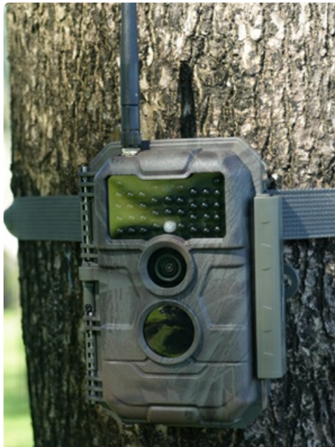
Image: Front view of the GardePro E6P Max trail camera, showing the lens, IR sensors, and camouflage casing.

Familiarize yourself with the main components of your GardePro E6P Max trail camera.