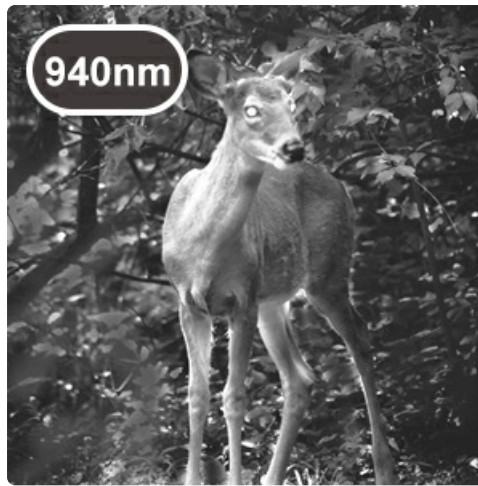
Image: A black and white night vision capture of a deer, demonstrating the 940nm no-glow infrared technology.