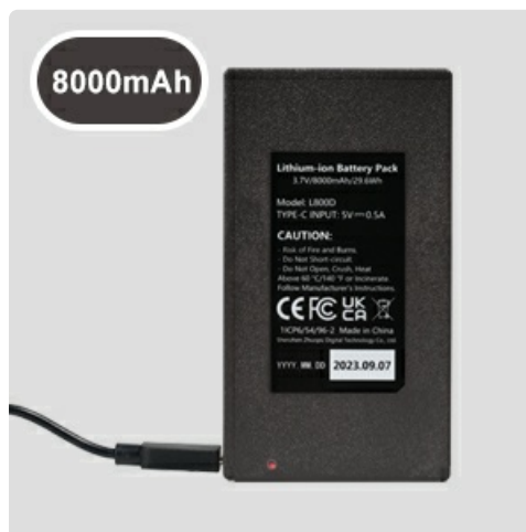
Image: The 8000 mAh rechargeable battery pack being charged via a Type-C cable.