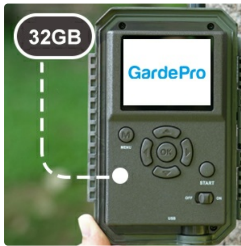
Image: The camera's internal screen highlighting the 32GB integrated storage.