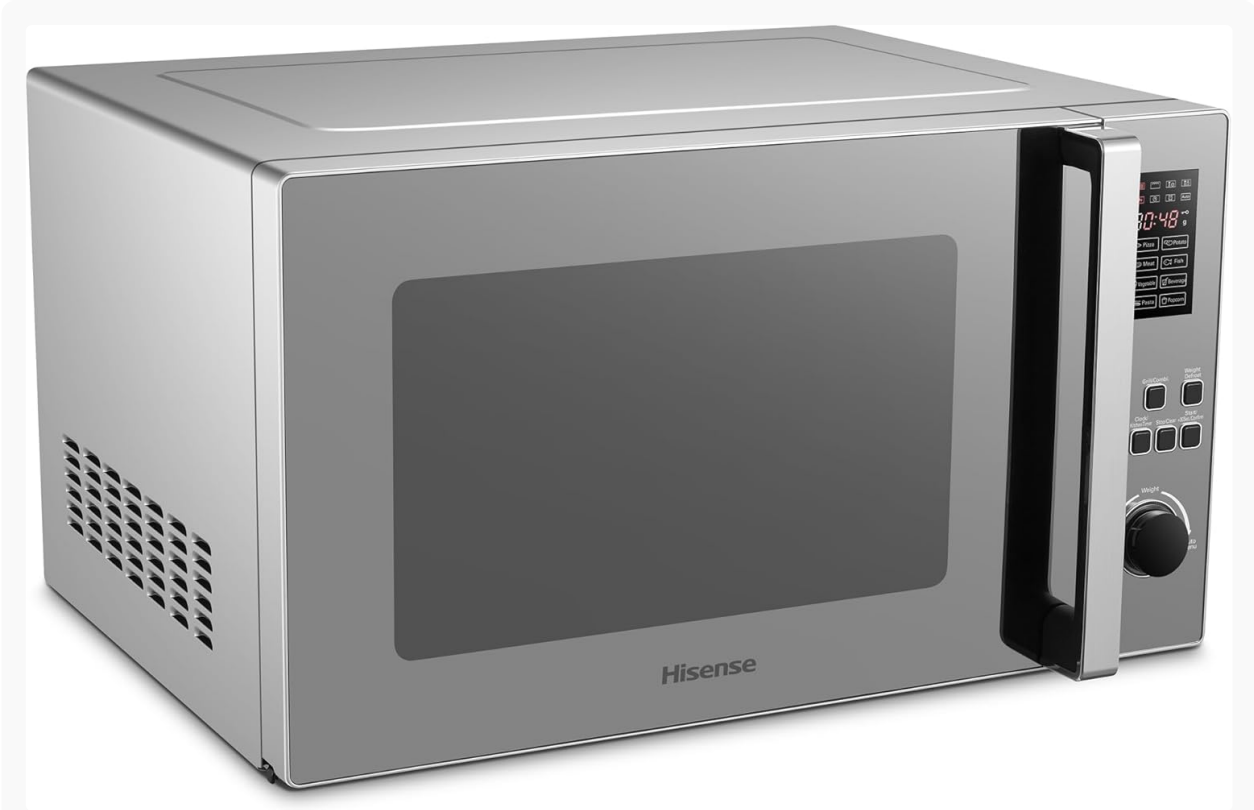
Angled view of the microwave, highlighting its compact yet spacious design suitable for various kitchen setups.