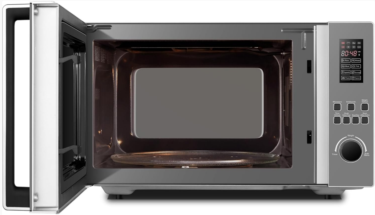
Interior view of the microwave with the door open, showing the glass turntable and the spacious 45-liter capacity.