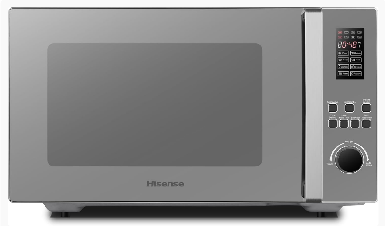
Front view of the Hisense H45MOMK9 Microwave Oven, showcasing its sleek silver design and digital display.

Familiarize yourself with the components of your Hisense Microwave Oven.