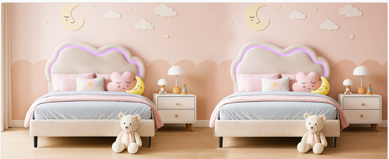
Image 4.2: Illustration of the practical underbed space for storage and ease of cleaning.