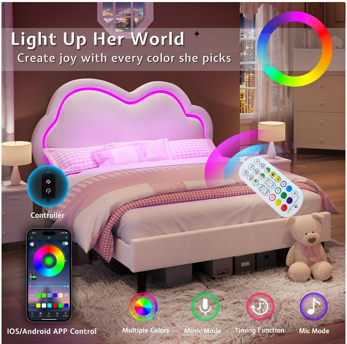
Image 3.1: The RGB lighting system, showing control options via remote and mobile application.