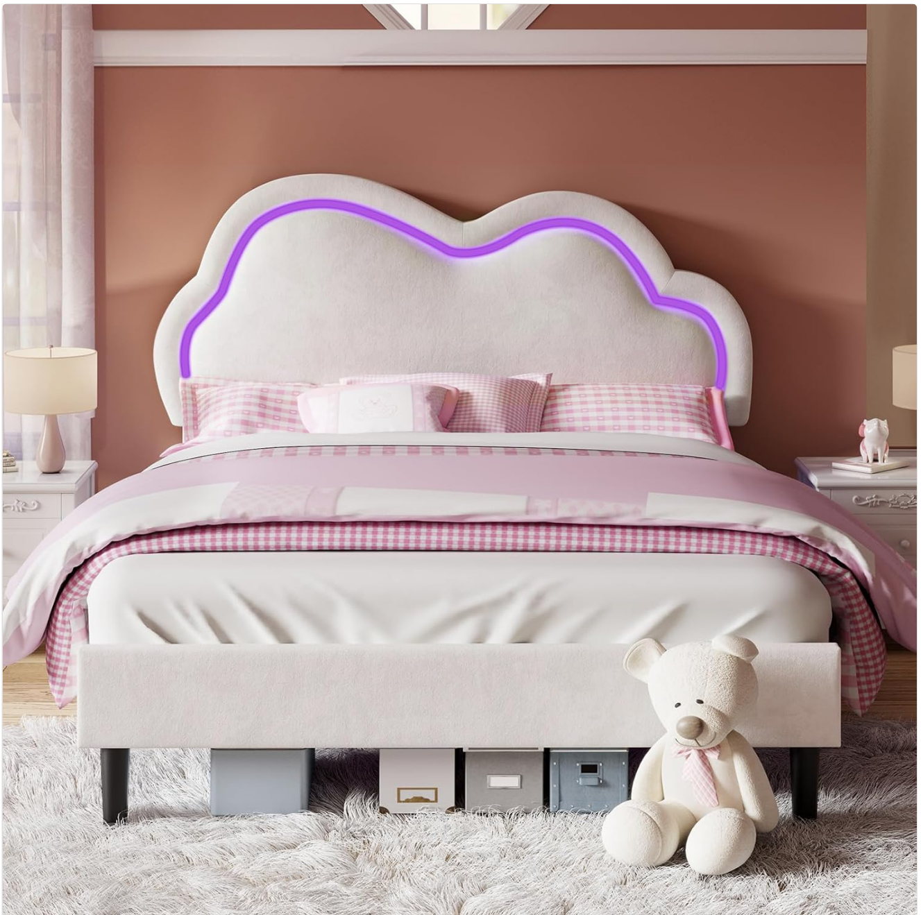
Image 1.1: Overview of the Jocisland Full Bed Frame, highlighting its dimensions and 800 lbs capacity.

Video 1.1: A demonstration of the Jocisland Cloud Bed Frame in Cream, showcasing its design and RGB lighting features.