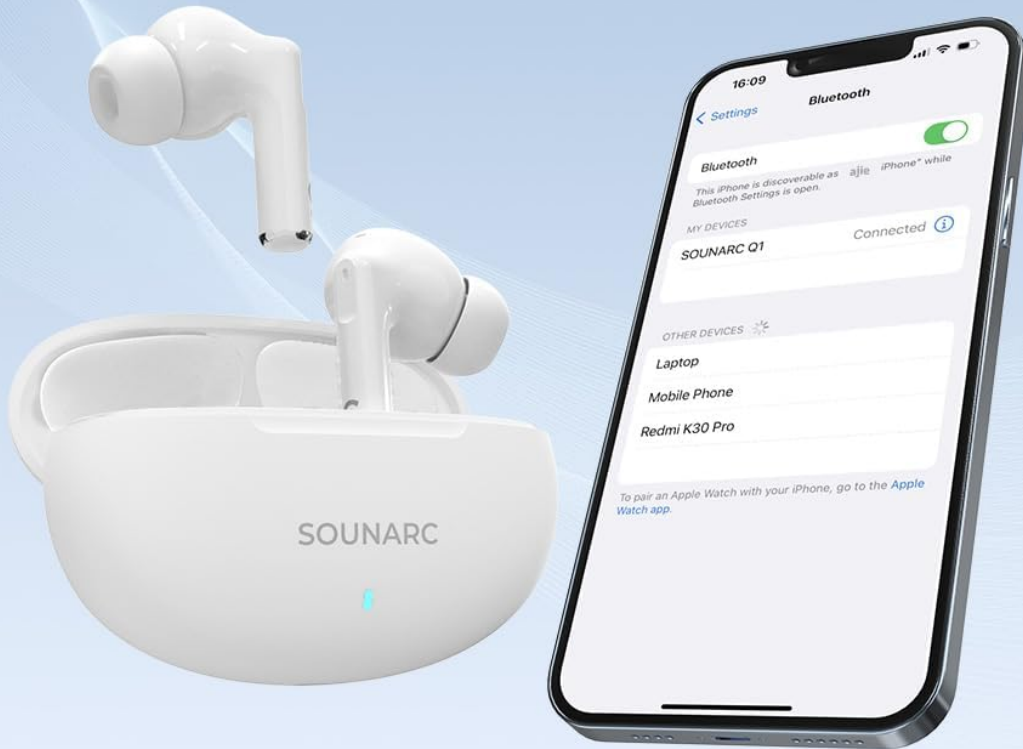
Figure 3: Illustration of the fast auto-pairing feature, showing the earbuds connecting to a smartphone via Bluetooth settings.

After initial pairing, Sounarc Q1 will auto connect to your device once you open the lid