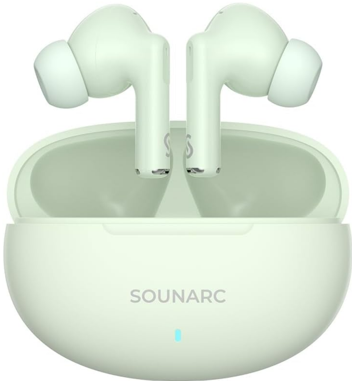
Figure 1: Sounarc Q1 Earbuds in their charging case. The earbuds are mint green, and the case is a matching color with the Sounarc logo on the front.

Familiarize yourself with the components of your Sounarc Q1 Earbuds: