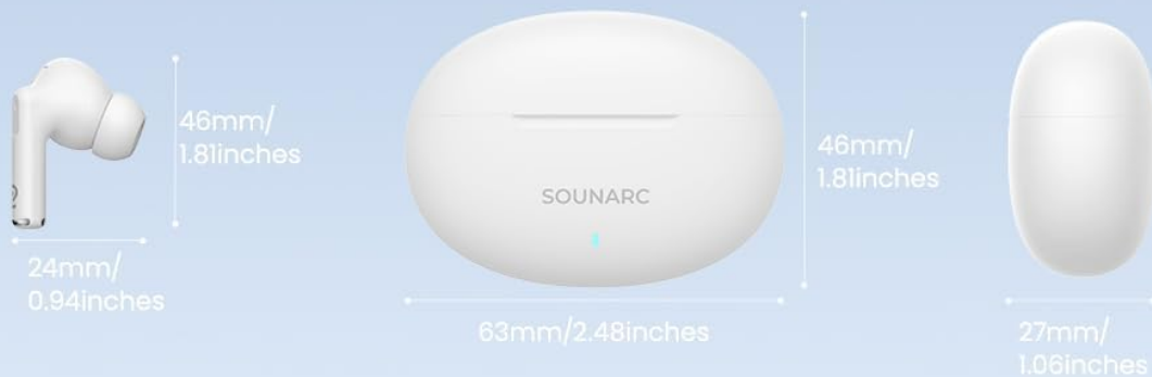
Figure 7: Diagram showing the compact dimensions of the Sounarc Q1 Earbuds and their charging case.