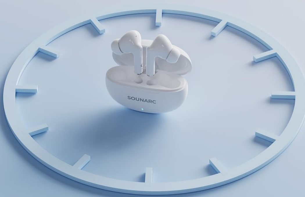
Figure 6: Graphic illustrating the 28-hour total playtime of the Sounarc Q1 Earbuds, with 6 hours on a single charge and an additional 22 hours provided by the charging case.

6 Hrs on a single Charge | 28 Hrs with charging Case