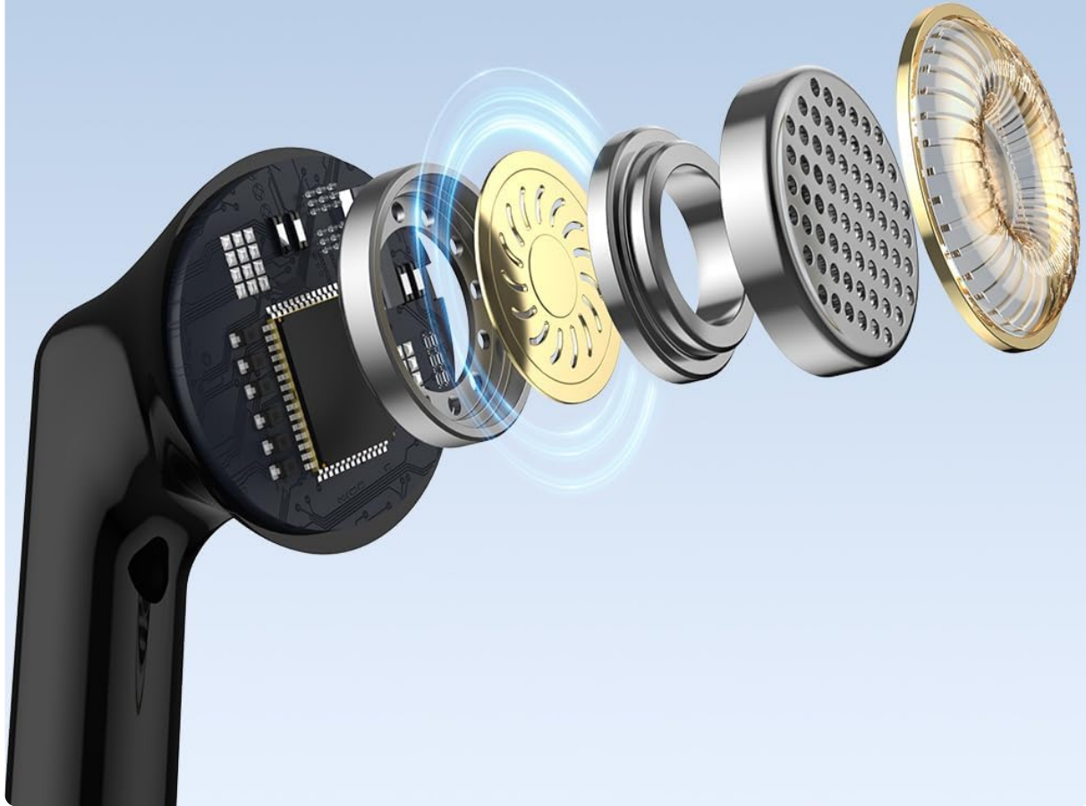
Figure 2: Exploded view showing the internal 13mm dynamic drivers of the Sounarc Q1 Earbuds, designed for deep bass audio.

The 13mm dynamic drivers bring everynote to life