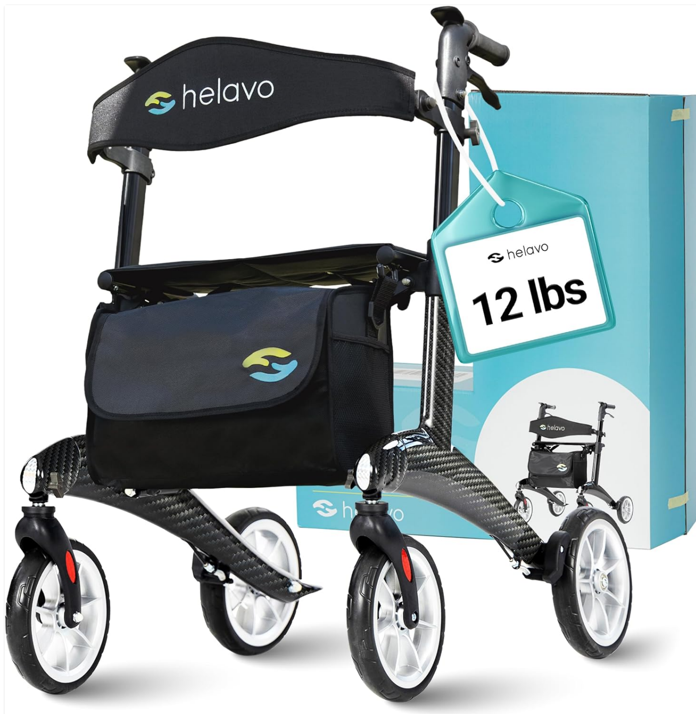
Image 1.1: The Helavo Carbon Ultralight Rollator Walker, Model H1210. This image displays the rollator in its upright, ready-to-use configuration, highlighting its carbon fiber frame, 8-inch wheels, seat, and storage bag.