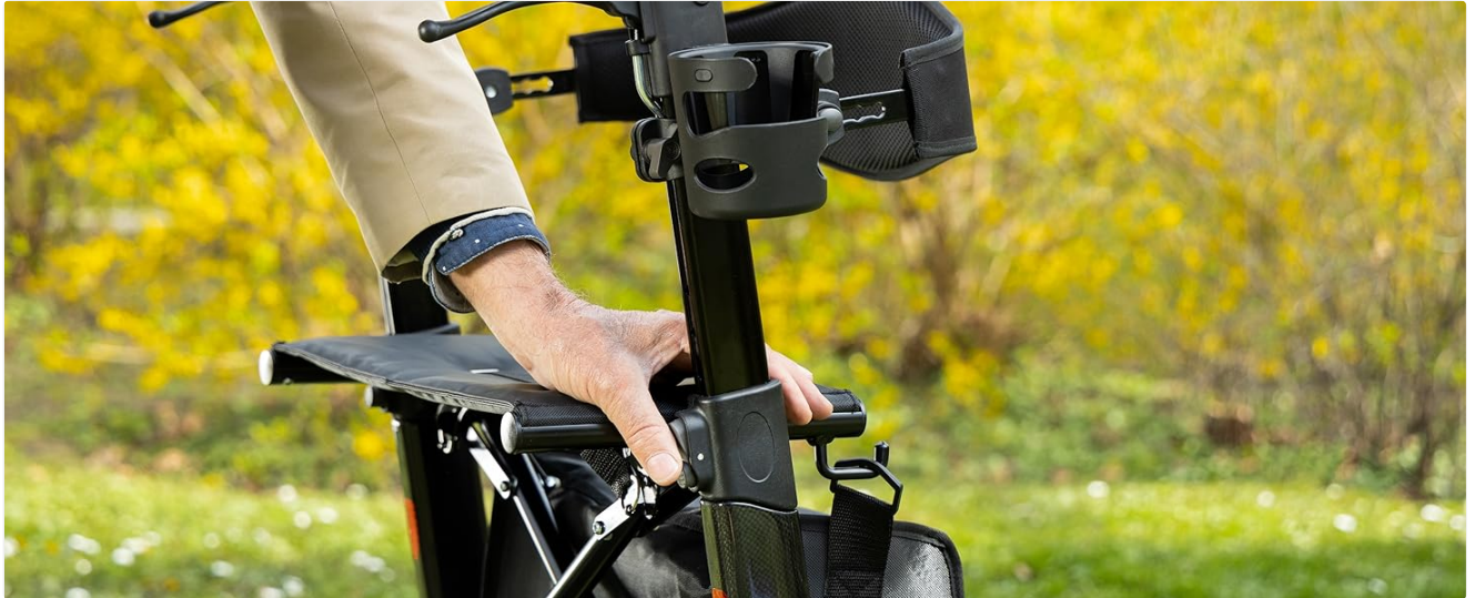
Image 3.1: A user adjusting the backrest of the Helavo rollator. The backrest provides lumbar support and can be customized for height and depth.

The premium backrest is designed for comfort and support. Attach it to the designated slots on the handle tubes. Ensure it clicks securely into place. The backrest can be adjusted for height and depth to provide customized lumbar support.