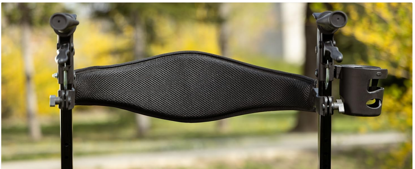
Image 3.2: Close-up view of the cup holder being attached to the handle of the Helavo rollator. This accessory provides convenient storage for beverages.

Attach the cup holder to one of the handle tubes as desired. The large transport bag can be placed under the seat or attached to the front frame, depending on the model variation.