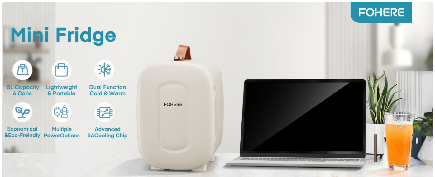
Image: FOHERE 5L Mini Fridge on a desk, showcasing its compact and portable design.

Thank you for choosing the FOHERE 5L Portable Mini Fridge. This versatile thermoelectric device is designed to provide both cooling and warming functions, making it ideal for various applications. Its compact size and dual power options (AC/DC) allow for convenient use in offices, dormitories, cars, or for storing cosmetics and beverages. Please read this manual thoroughly before operation to ensure proper use and maintenance.