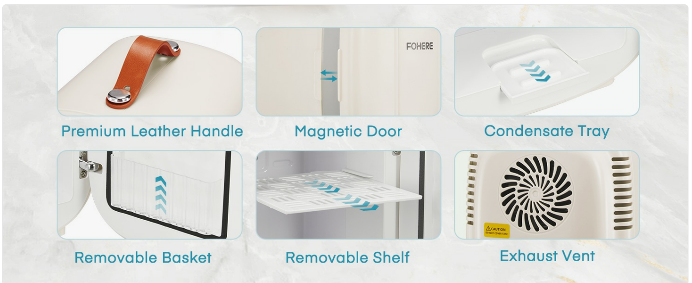
Image: Detailed view of product features including the magnetic door, removable shelf, and drip tray.