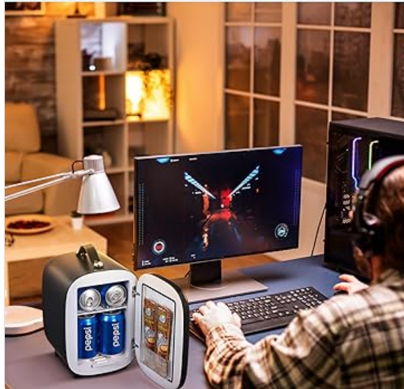
Image: Mini fridge connected via AC adapter for home or office use.

Enjoy drinks to pair with your favorite game