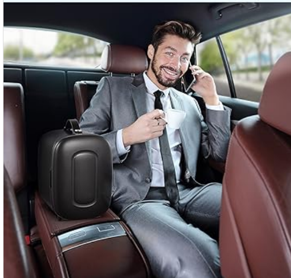
Image: Mini fridge connected via DC adapter for car use.