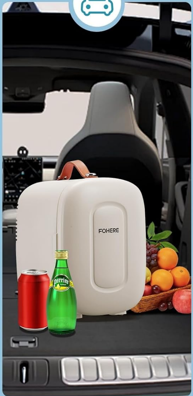
Image: Compact dimensions of the FOHERE 5L Mini Fridge for easy placement.