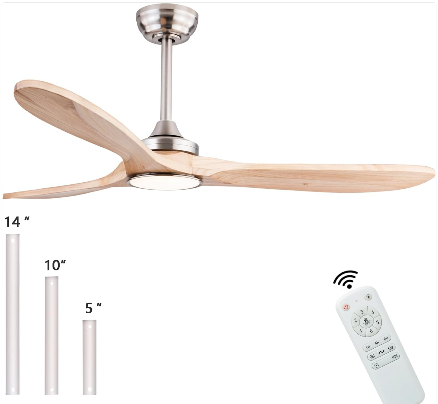
Figure 2: Included downrods and remote control.