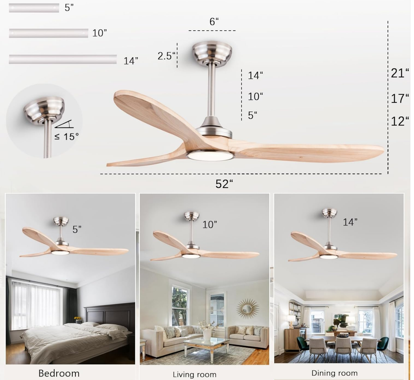
Figure 5: Detailed product dimensions and suggested room types.