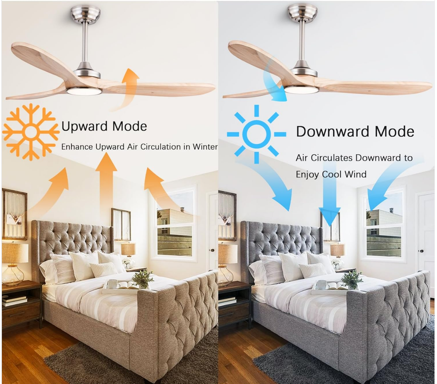
Figure 3: Summer and Winter dual-use modes for optimal air circulation.