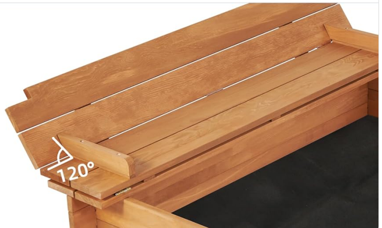
Figure 2: Key Components - Highlights the weather-resistant cover, the two bench seats, and the fabric bottom liner for sand containment.