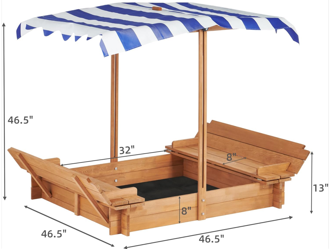
Figure 4: Product Dimensions - Provides a visual representation of the sandbox's measurements.