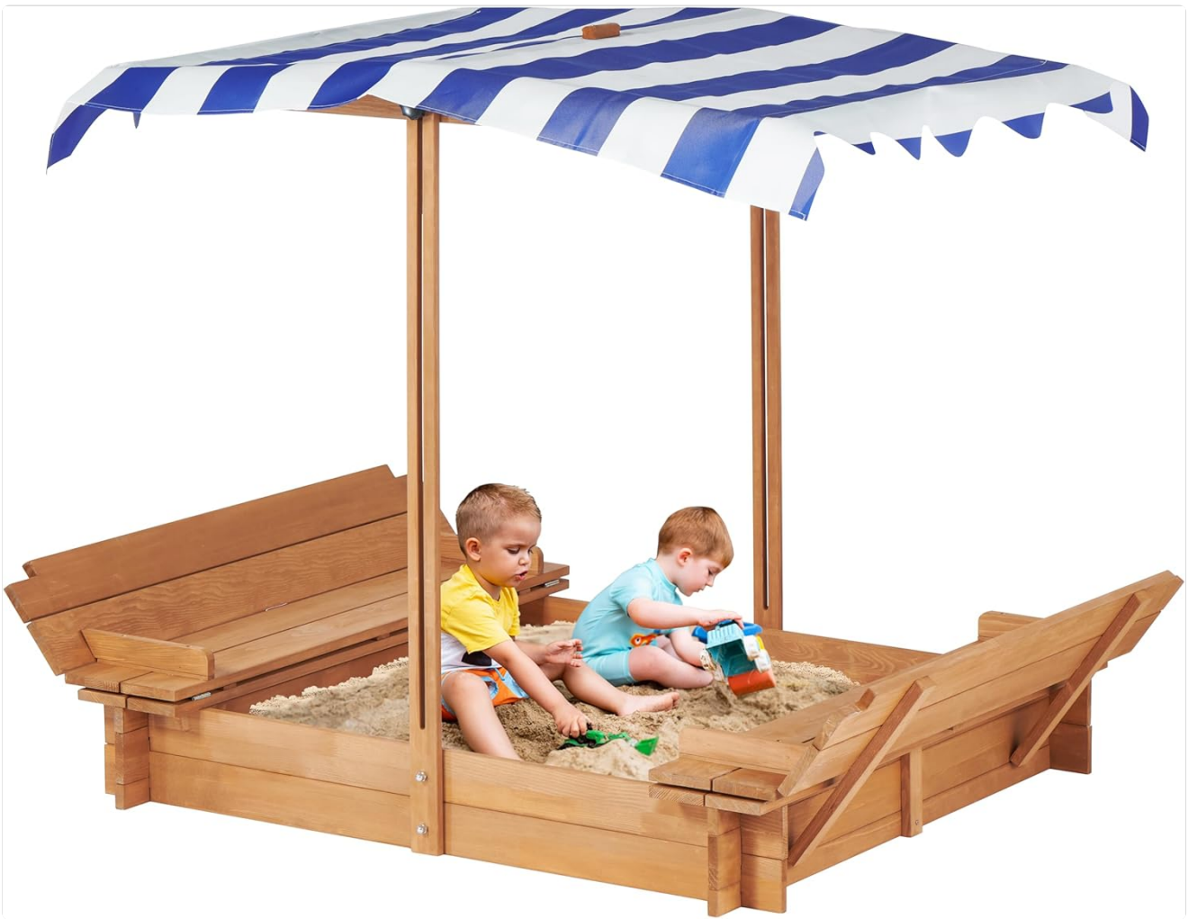
Figure 3: Sandbox in Use - Depicts children enjoying the sandbox with the canopy extended for sun protection.

helps keep out debris, animals, and rain.