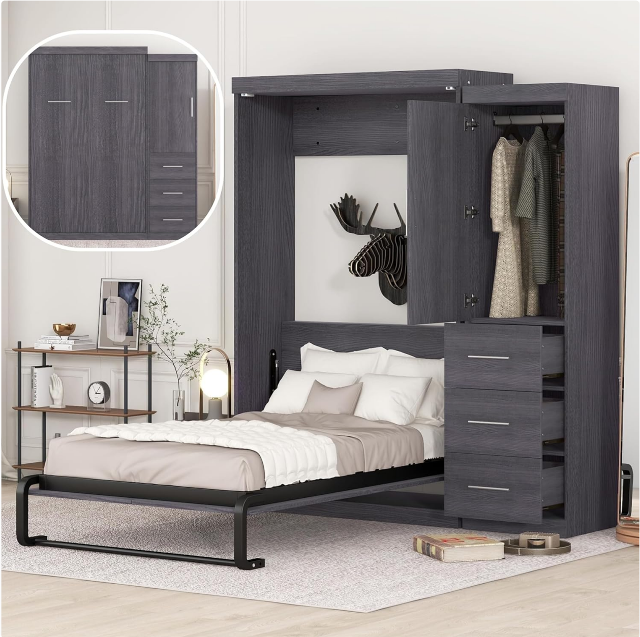
Image: The Murphy bed fully unfolded, ready for use, with the integrated wardrobe and drawers visible on the side.