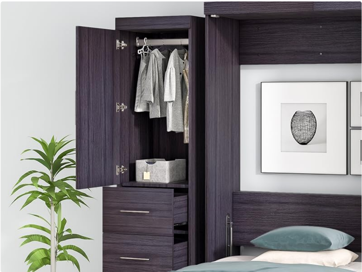
Image: A detailed view of the open wardrobe section with hanging clothes and the three pull-out drawers for additional storage.