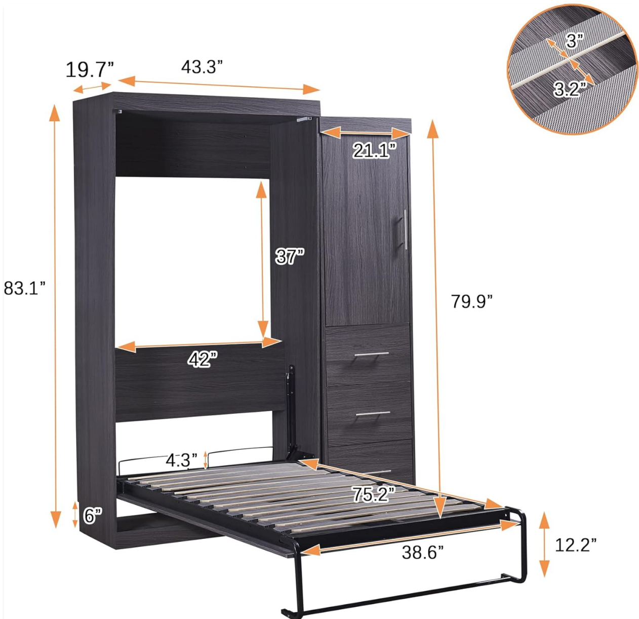
Image: Detailed dimensions of the SOFTSEA Twin Size Murphy Bed in both folded and unfolded states.