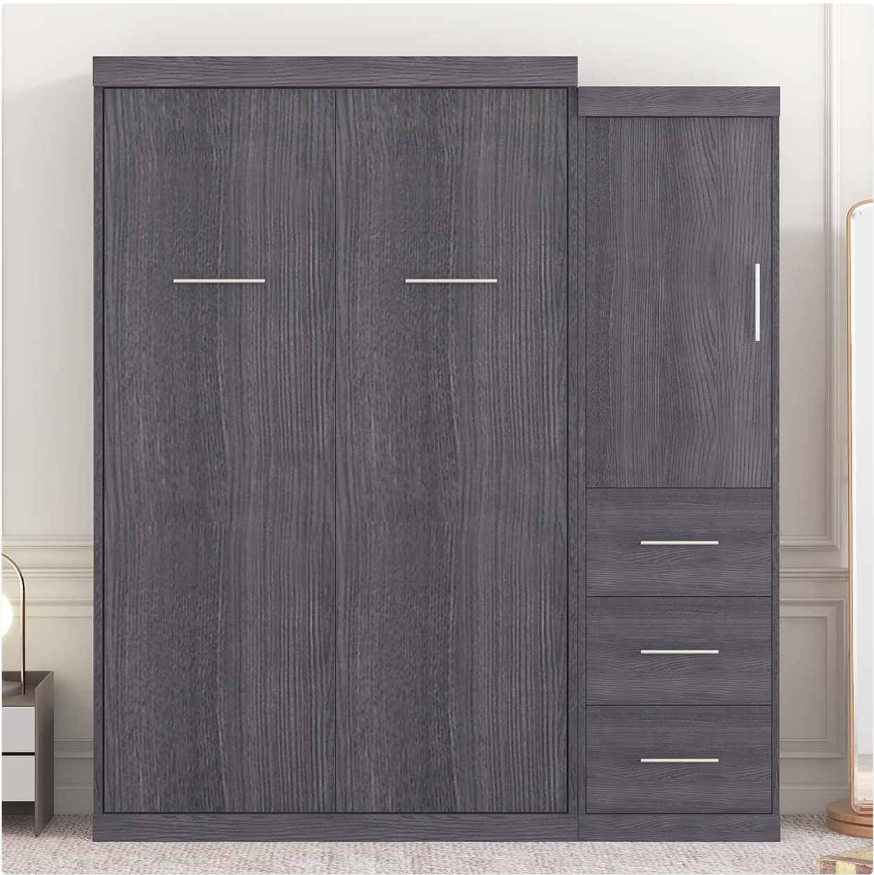
Image: The SOFTSEA Twin Size Murphy Bed in its closed cabinet configuration, featuring a wardrobe and three storage drawers.