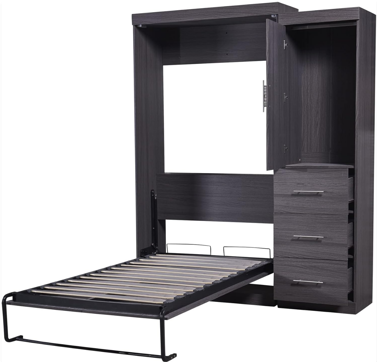
Image: The Murphy bed partially unfolded, revealing the sturdy metal bed frame and the tri-fold foam mattress.