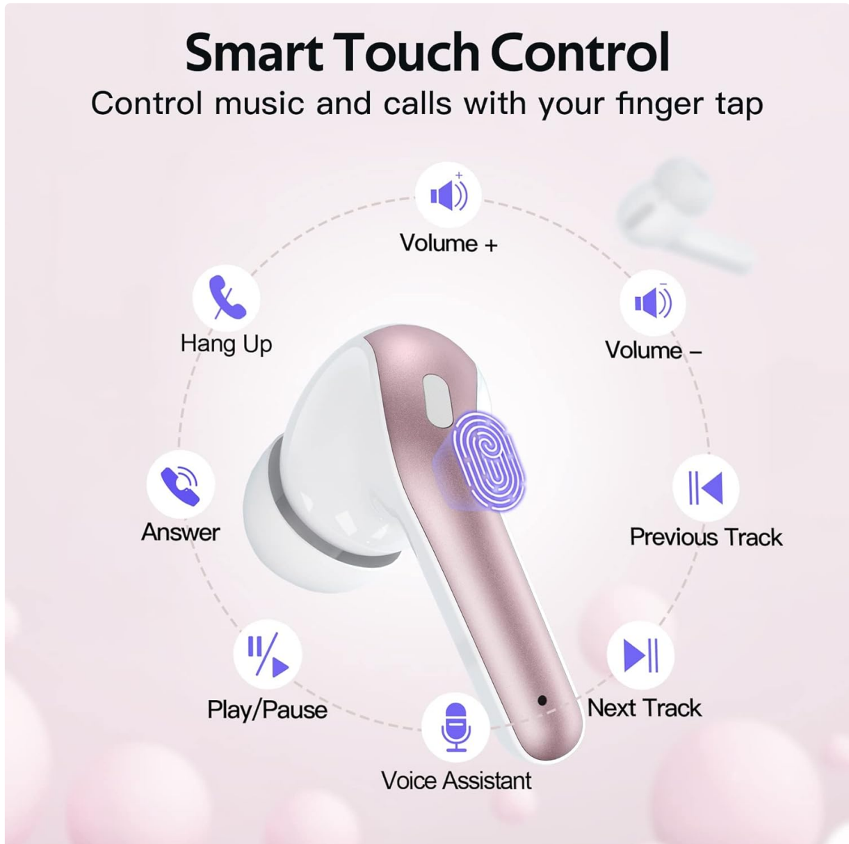
Image: A visual guide to the smart touch controls on the TAGRY X08 earbuds, detailing gestures for volume, track control, calls, and voice assistant.