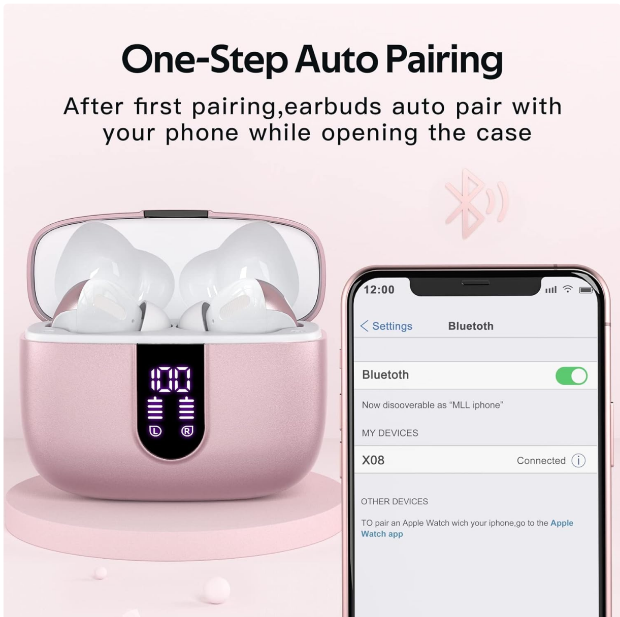
Image: A smartphone screen showing the TAGRY X08 earbuds connected via Bluetooth, illustrating the one-step auto pairing feature.

The earbuds support both mono mode (using a single earbud) and twin stereo mode (using both earbuds for immersive sound). You can seamlessly switch between modes or share an earbud with another person.