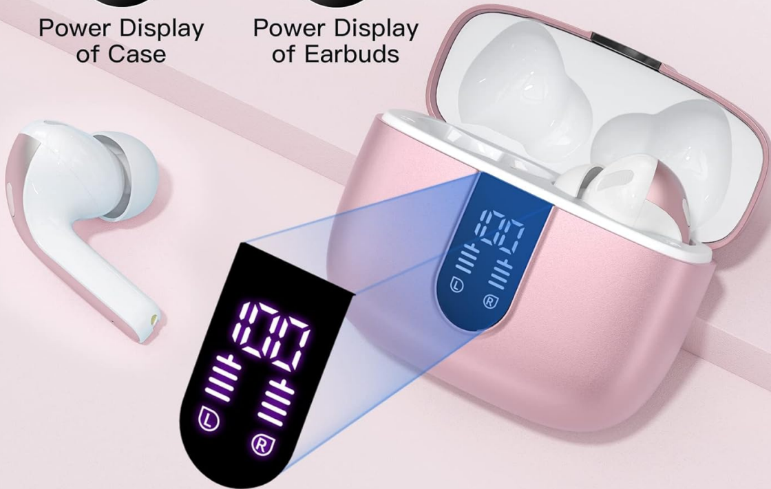
Image: TAGRY X08 True Wireless Earbuds in their charging cases, available in pink and purple.