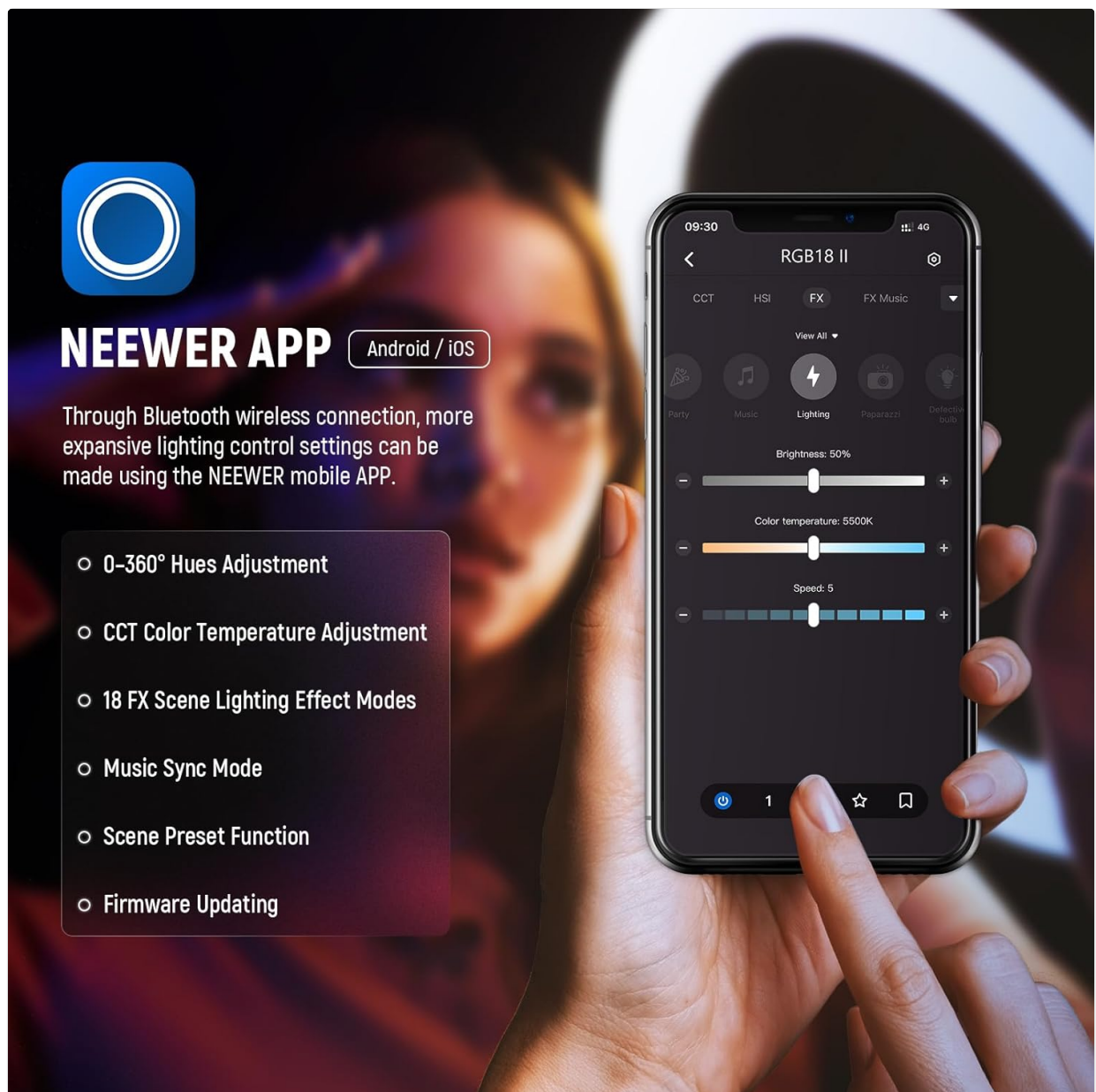
Figure 4.3: Visual representation of the 18 FX scene effects, such as Music Sync, Paparazzi, and Lighting.