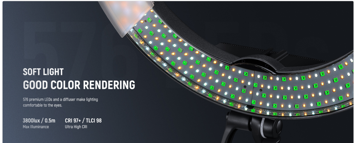
Figure 4.1: The NEEWER RGB18 II provides soft light with excellent color rendering (CRI 97+, TLCI 98).