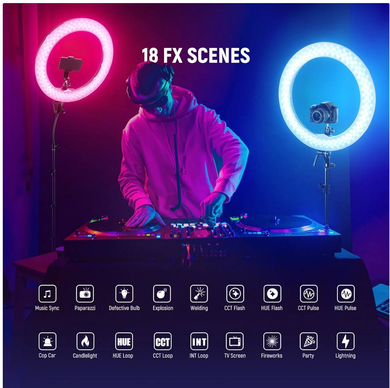
Figure 4.2: Overview of the multiple light modes available on the RGB18 II, including HSI, CCT, and GM color correction.