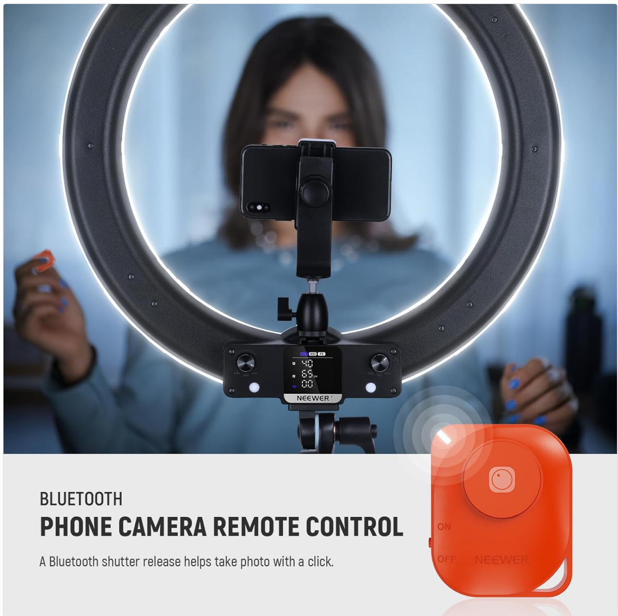
Figure 4.4: The NEEWER App provides comprehensive wireless control over the ring light's settings.