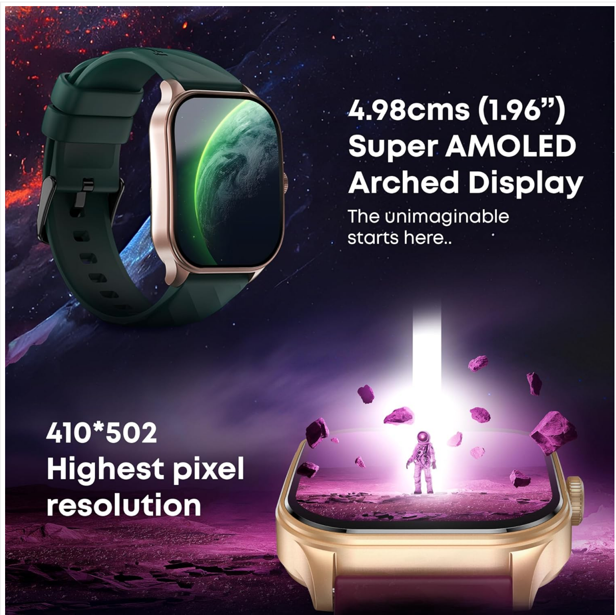
Image: The Fastrack Limitless FS2 Pro Smart Watch showcasing its large 1.96-inch Super AMOLED arched display with high pixel resolution.