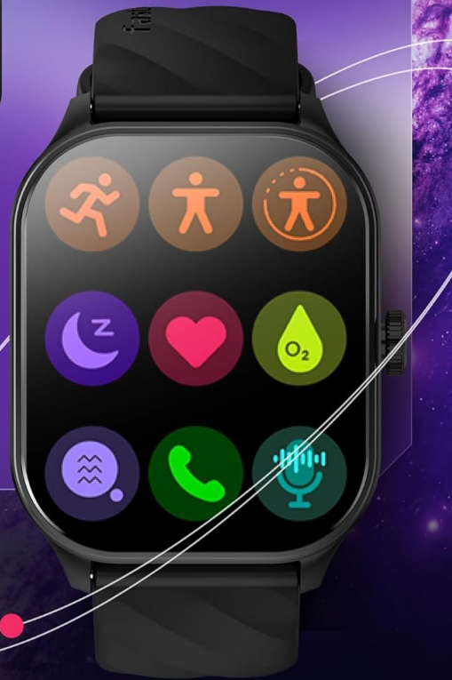
Image: The Fastrack Limitless FS2 Pro Smart Watch showing its health monitoring features, including heart rate, SpO2, stress, sleep, and menstrual period tracking.