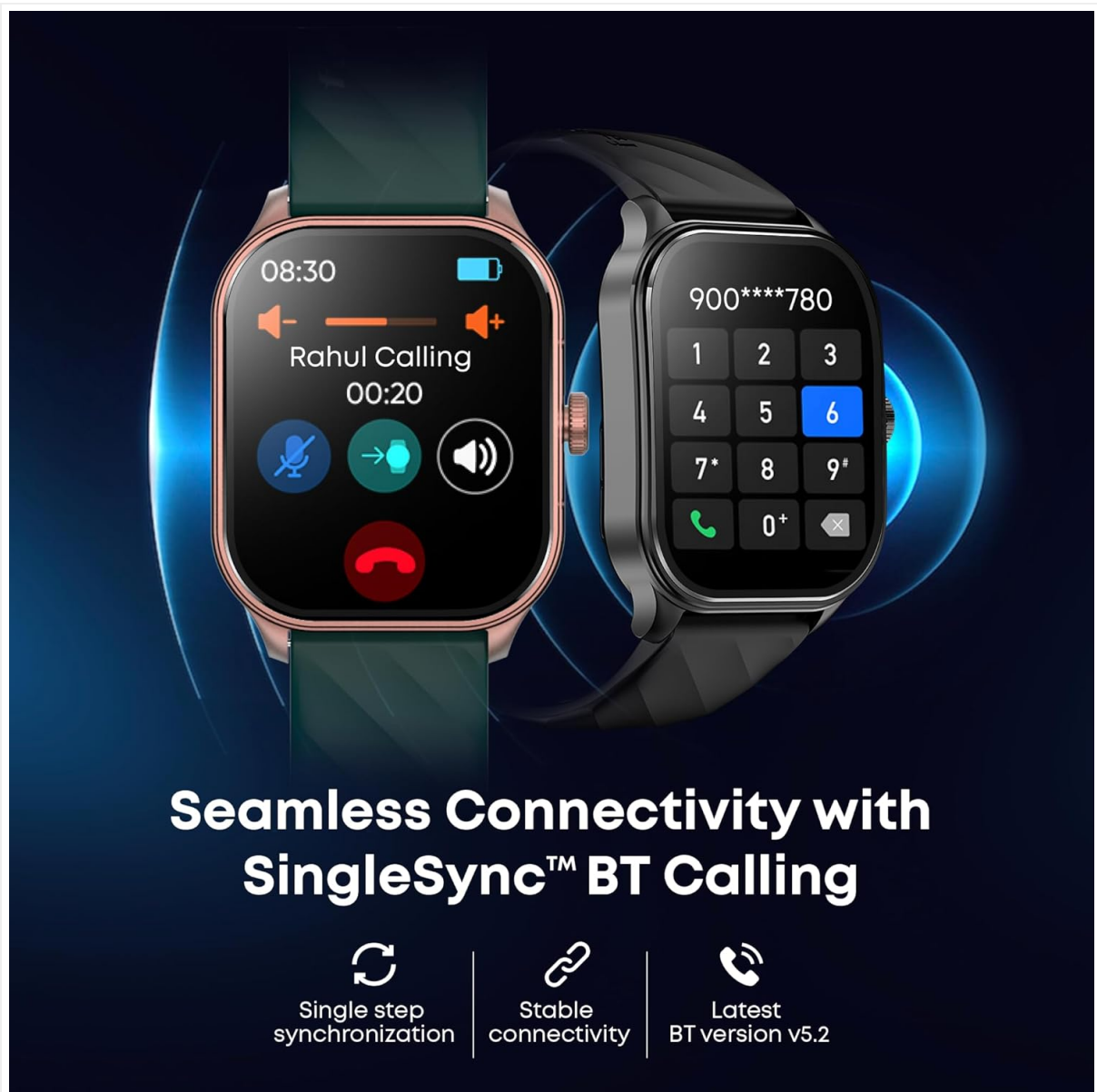
Image: The Fastrack Limitless FS2 Pro Smart Watch demonstrating its Bluetooth calling capabilities with an incoming call screen and a dial pad.