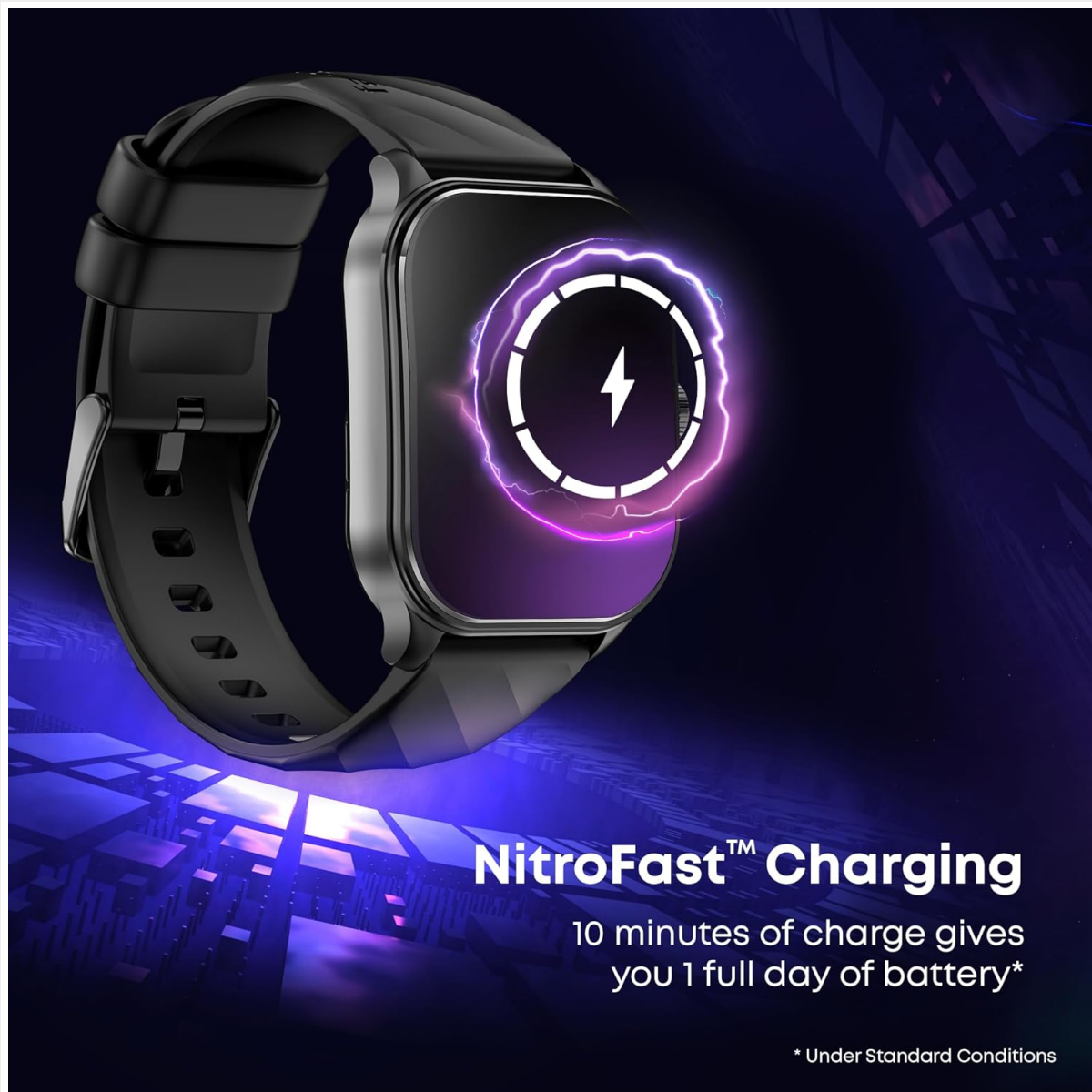
Image: The Fastrack Limitless FS2 Pro Smart Watch being charged with its magnetic charging cable. A lightning bolt icon indicates the charging process.