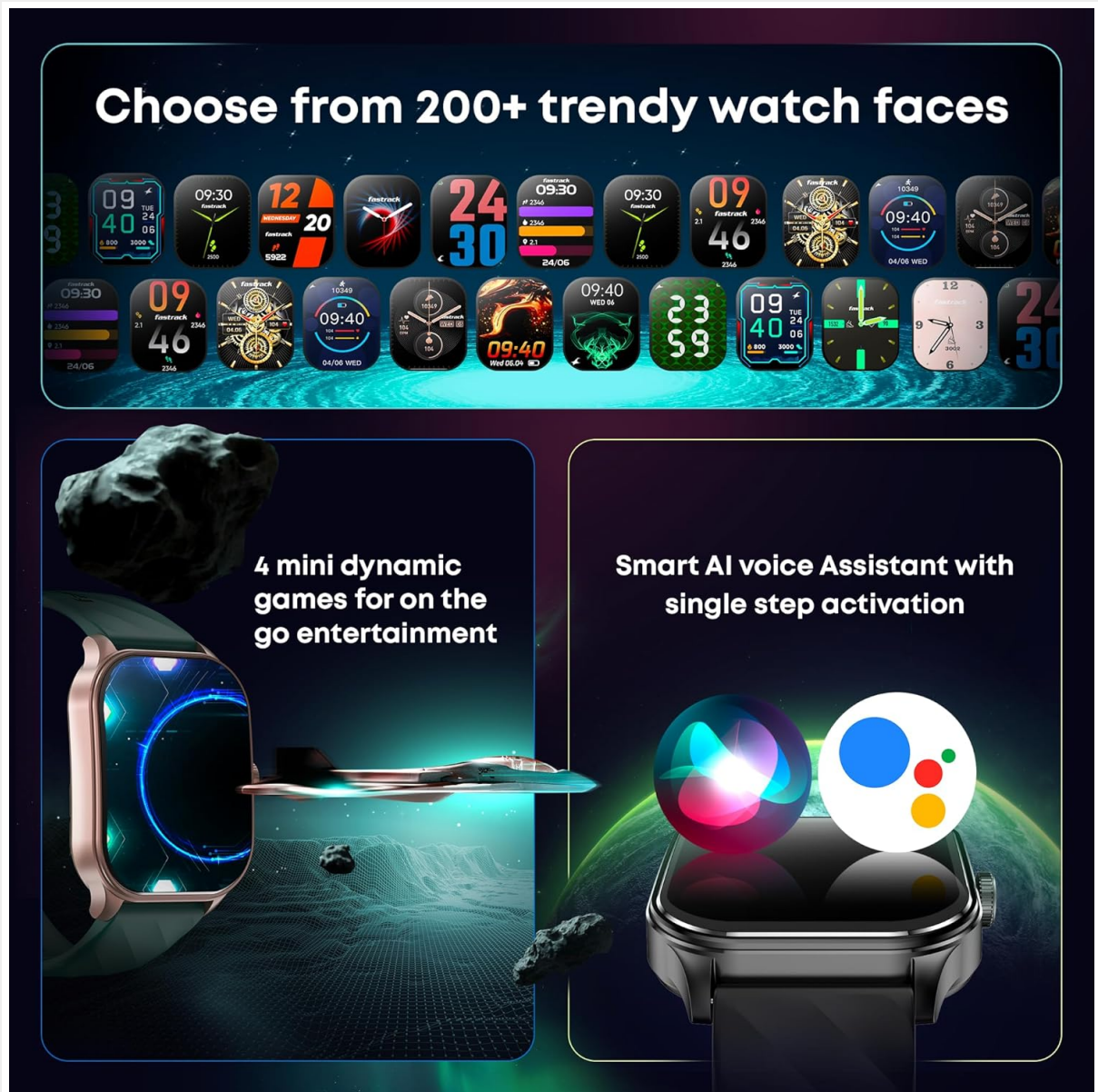
Image: A collage showing various watch faces available for the Fastrack Limitless FS2 Pro, alongside icons representing in-built games and AI voice assistant functionality.