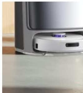
Diagram illustrating the built-in dust compression feature for extended use.

The robot's underside with mop pads and the zero-tangling roller brush.