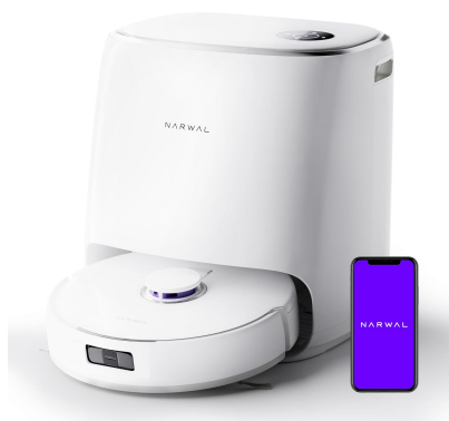
The Narwal Freo X Ultra robot and its all-in-one base station.