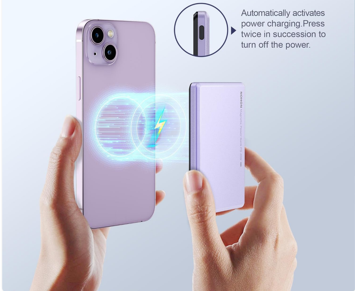
Figure 3: Magnetic attachment for wireless charging.