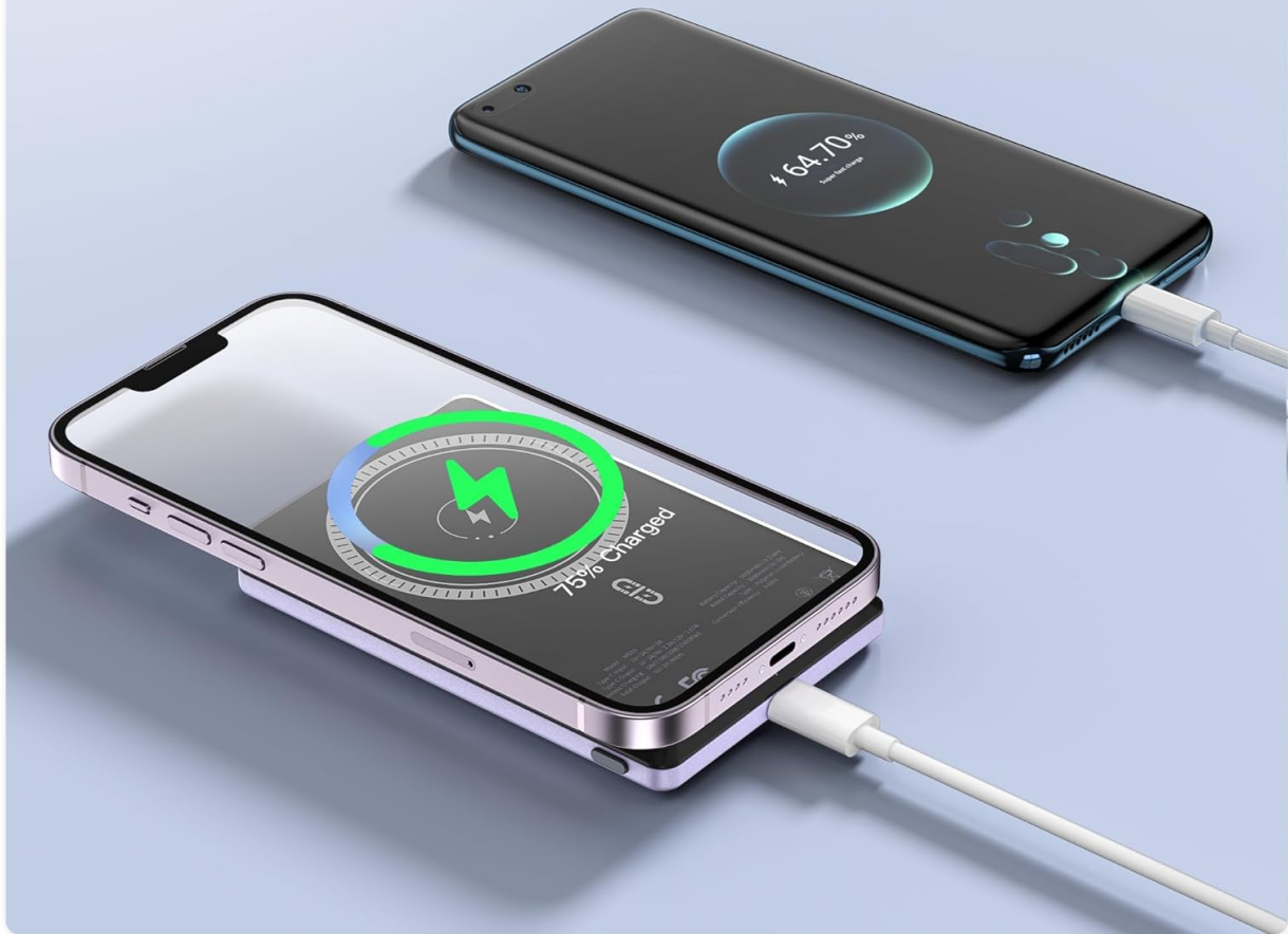
Figure 4: Charging two devices simultaneously.