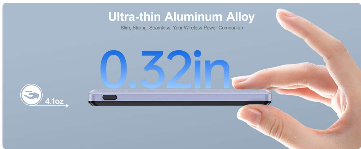
Figure 5: Overview of NOHON MS15 features.