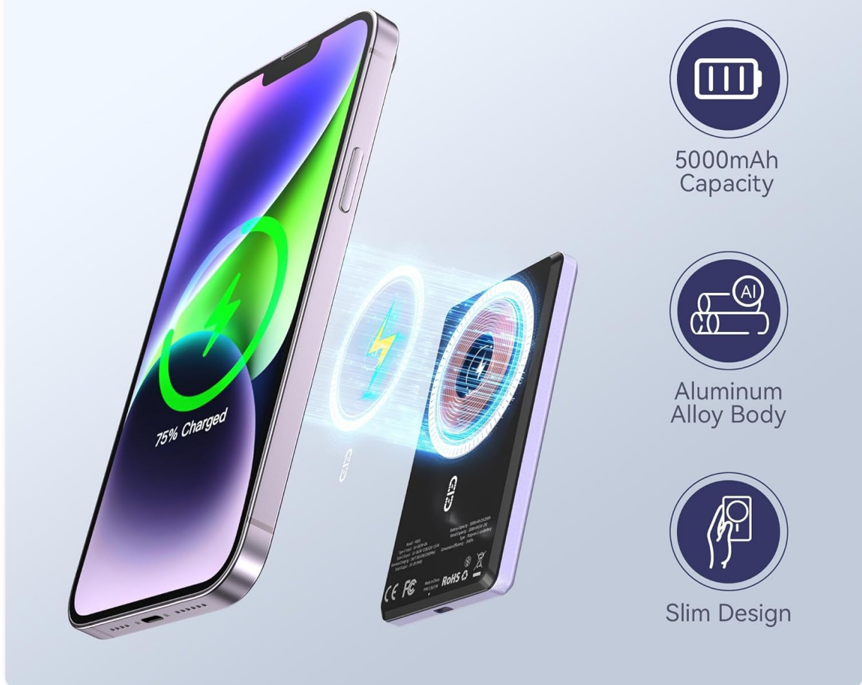
Figure 1: NOHON MS15 Mag-Safe Wireless Power Bank with iPhone.