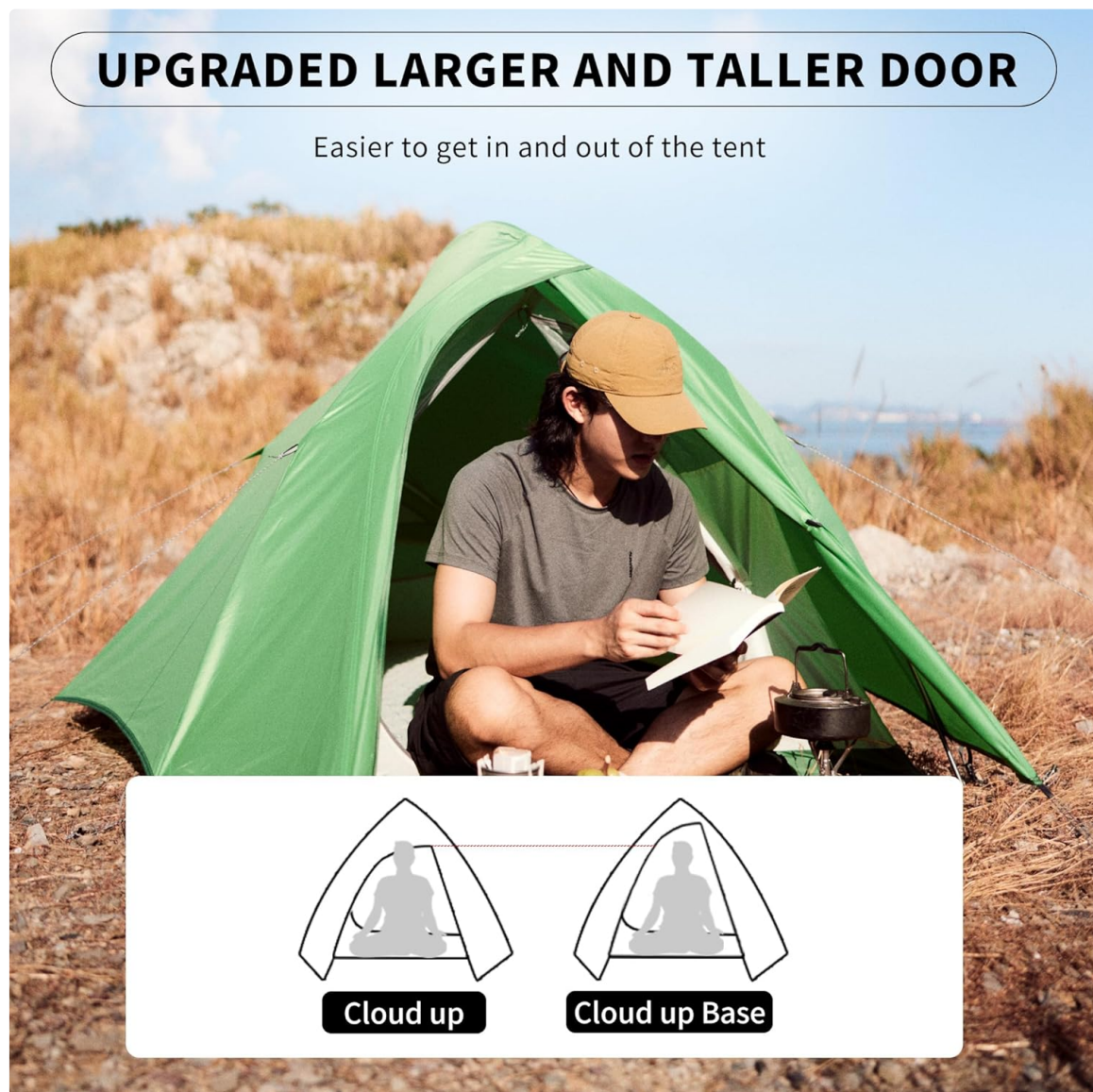
Image: A person comfortably seated inside the tent, highlighting the upgraded larger and taller door for easy access.

The tent features a larger and taller front door for easier entry and exit. The front vestibule provides ample space to store gear such as shoes, backpacks, and cooking equipment, keeping the inner tent clean and dry. In bad weather, the vestibule allows for cooking without leaving the tent.