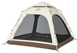
Image: Detailed breakdown of the tent components and their respective weights, including rain fly, inner tent, carry bag, tent poles, wind ropes, strapping tape, stakes, and footprint.