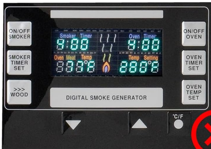
Figure 3: Comparison of 'New Version' (compatible) and 'Old Version' (incompatible) display panels. Ensure your existing unit matches the 'New Version' for proper fit and function.