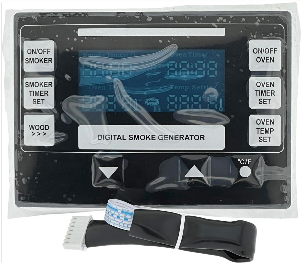
Figure 1: Front view of the ORIGPARTS Control Circuit Board Display Panel, showing the digital screen and nine control buttons.