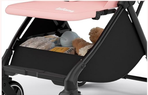
Large-capacity Storage Space

Image: A hand demonstrating the attachment of the detachable handrail.