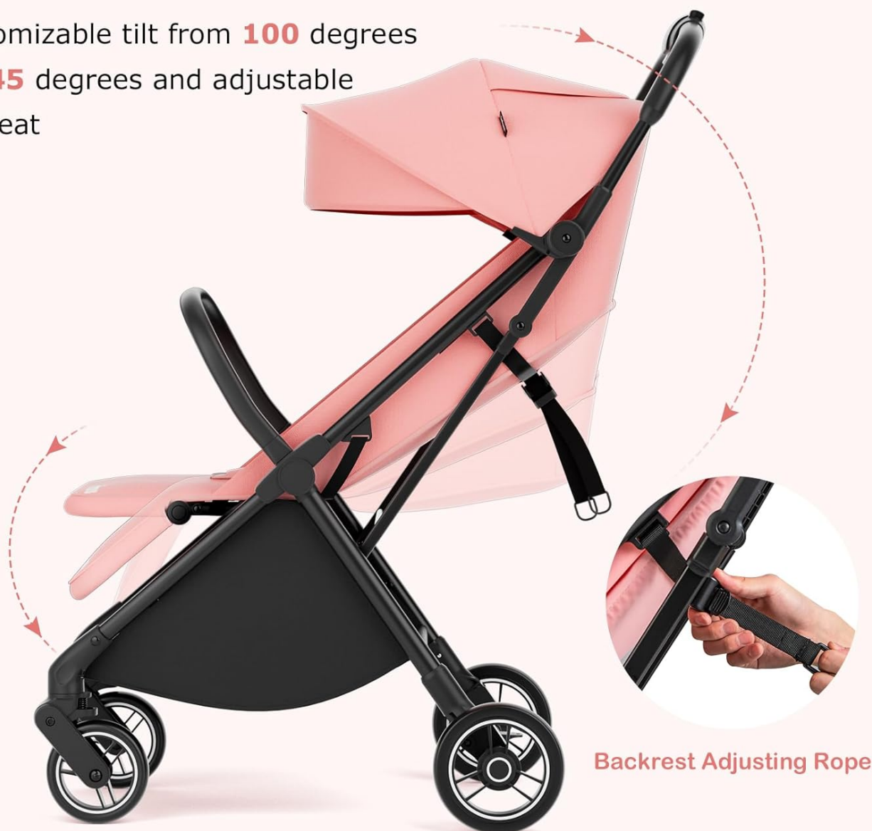
Image: Illustration of the adjustable backrest positions.

Customizable tilt from 100 degrees to 145 degrees and adjustable footseat