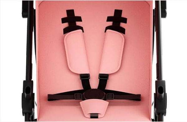
5-Point Safety Belt