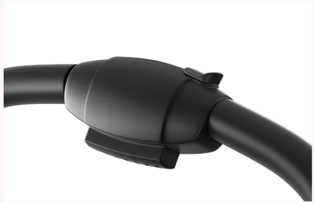
Comfy EVA Handle