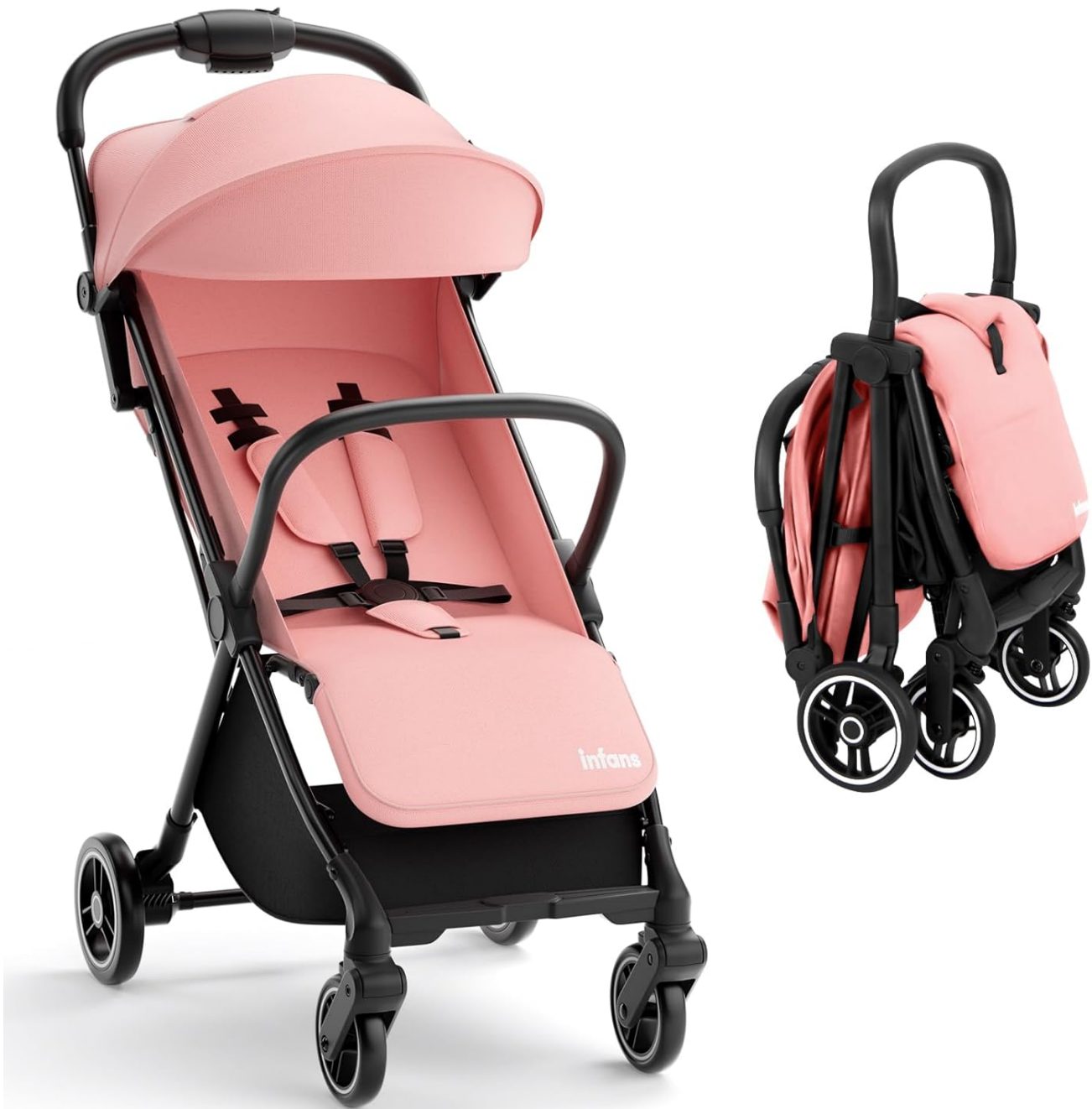
Image: The INFANS Lightweight Baby Stroller shown in both its unfolded and compact folded states.

To unfold the stroller, release any locking mechanisms and lift the handle until the frame clicks into place. Ensure all parts are securely locked before use.