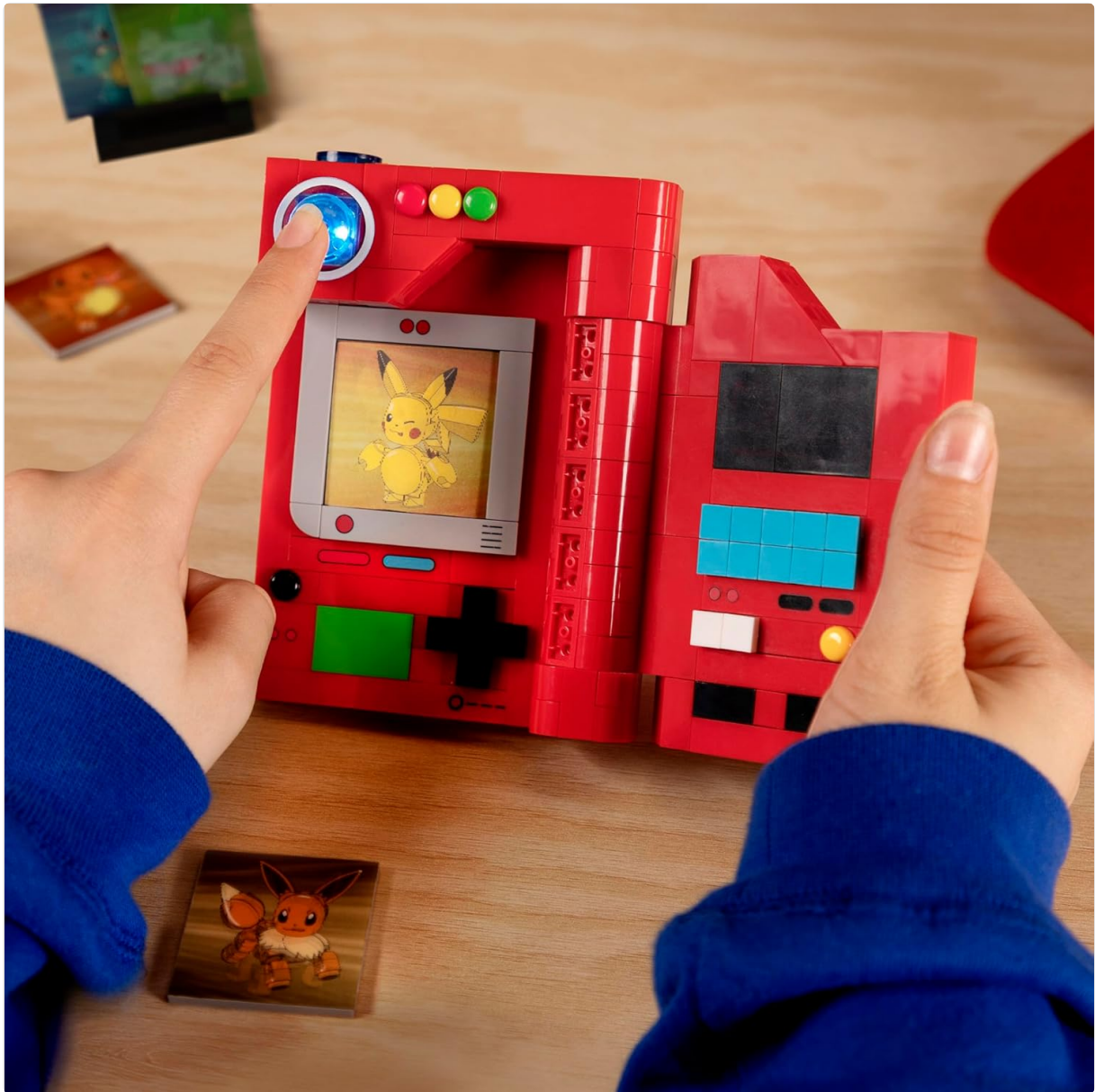
Image 4.1: Activating the light feature by pressing the blue button.