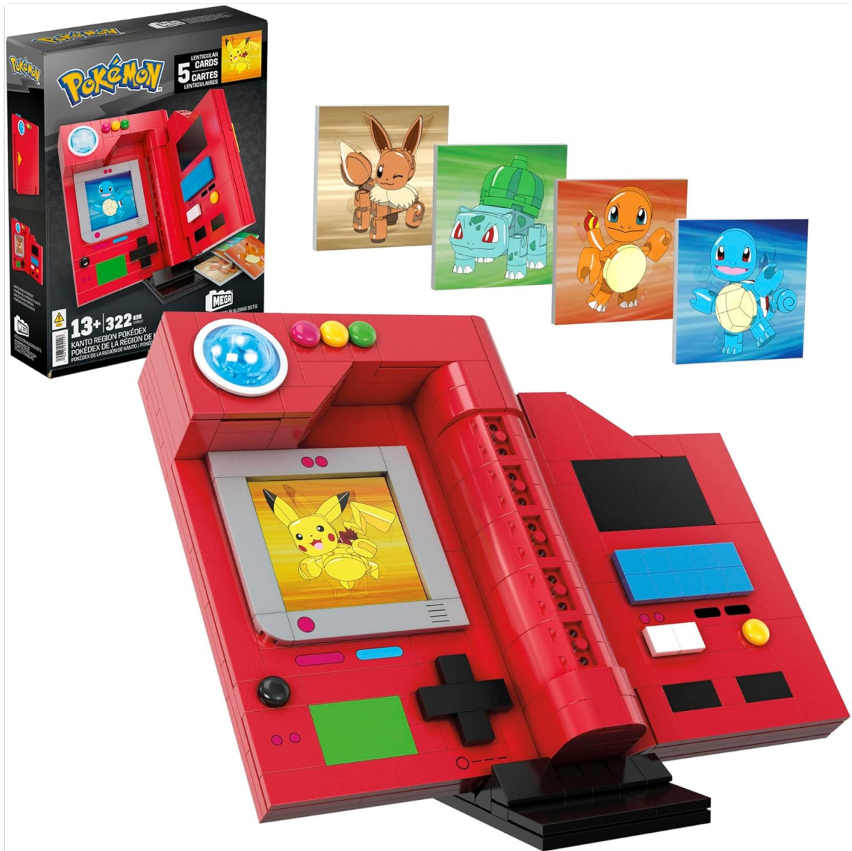
Image 1.1: The fully assembled MEGA Pokémon Kanto Region Pokédex, showcasing its design and display capabilities.