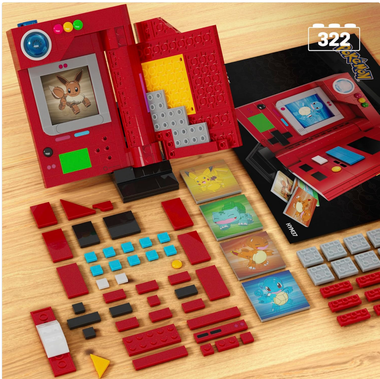
Image 2.1: Overview of all included parts, including the 322 building pieces and 5 lenticular cards.