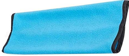
LADDER SOFT FABRIC COVER