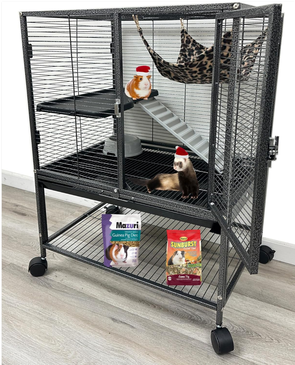
Image: Fully assembled Mcage Deluxe Two-Tier Small Animal Critter Cage, showcasing its two levels, included hammock, water bottle, and food bowl. Two small animals are visible inside, demonstrating the cage's capacity and features.