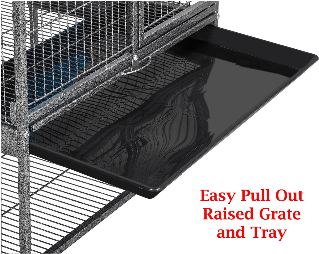
Image: A close-up view of the cage's base, illustrating the easy pull-out raised grate and tray, which can be slid out for cleaning without disassembling the main cage structure.