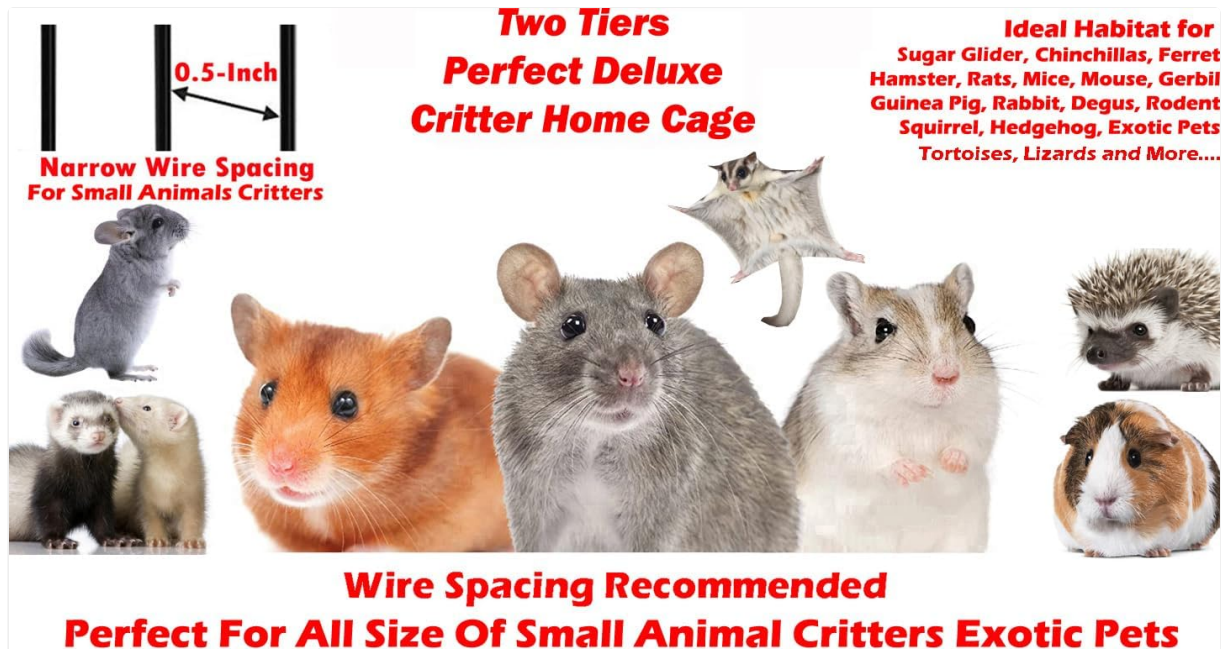
Image: A visual representation highlighting the 0.5-inch narrow wire spacing of the cage, alongside illustrations of various small animals like chinchillas, hamsters, rats, and hedgehogs, indicating suitability.