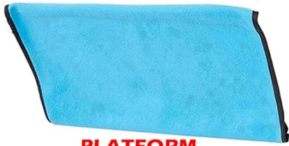
PLATFORM SOFT FABRIC COVER