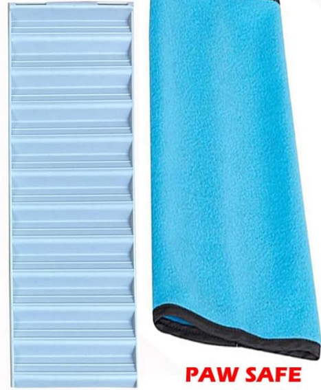
PAW SAFE LADDER SOFT FABRIC COVER

Image: A detailed view of the X-Large 9.5" x 17.5" adjustable paw safe solid platform and the 5" x 15" anti-slip paw safe solid ladder, shown with their respective blue soft fabric covers.