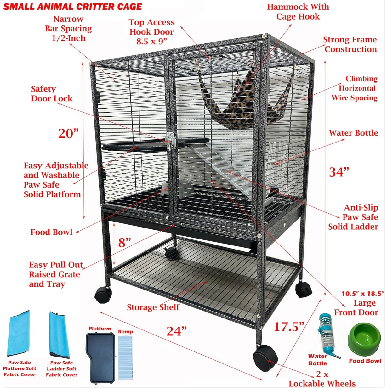
Image: An exploded diagram of the cage, detailing its dimensions (24"L x 17.5"W x 34"H), and labeling key components such as the narrow bar spacing, top access door, front door, platforms, ramps, hammock, water bottle, food bowl, storage shelf, and lockable wheels.