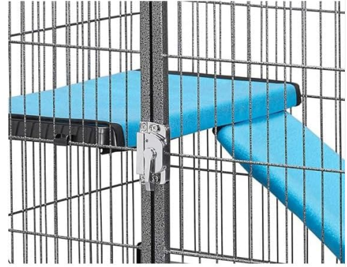
Front Door Safety Lock