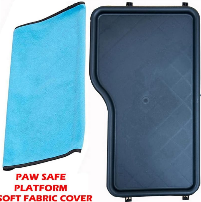
PAW SAFE PLATFORM SOFT FABRIC COVER