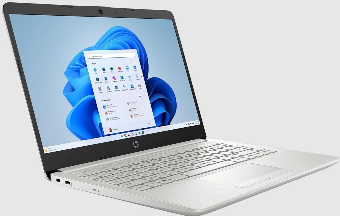
Image: The HP Portable Laptop displaying the Windows 11 desktop environment.

Boost your creativity with Microsoft 365 Office, now including smart features to help your work shine.