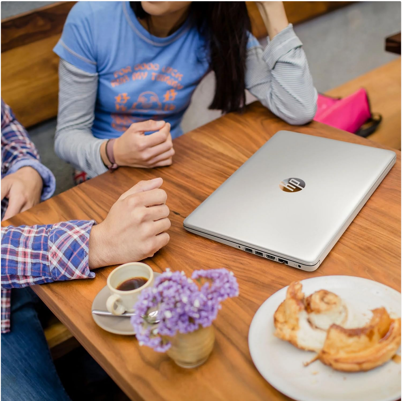
Image: Side view of the HP Portable Laptop, illustrating the available ports.