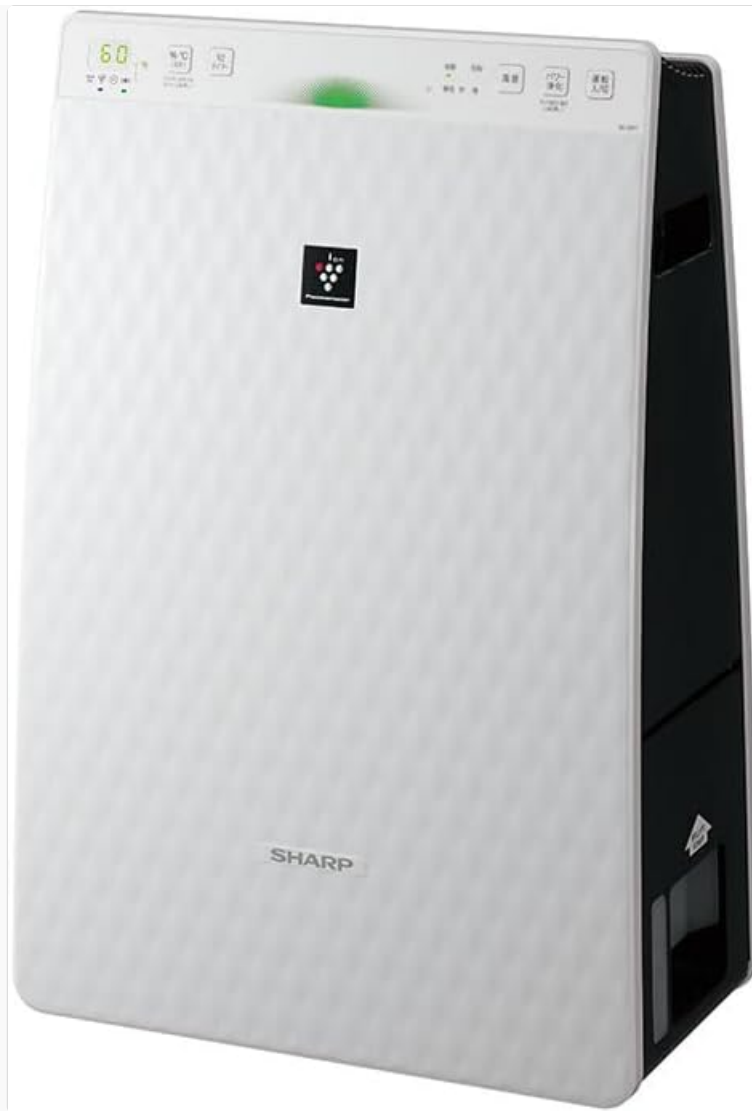
Figure 3.1: Front View of the Air Purifier. This image displays the main body of the Sharp KC-35T7 air purifier, highlighting the control panel at the top, the air intake grille, and the Plasmacluster logo. The unit is white with black accents on the sides.