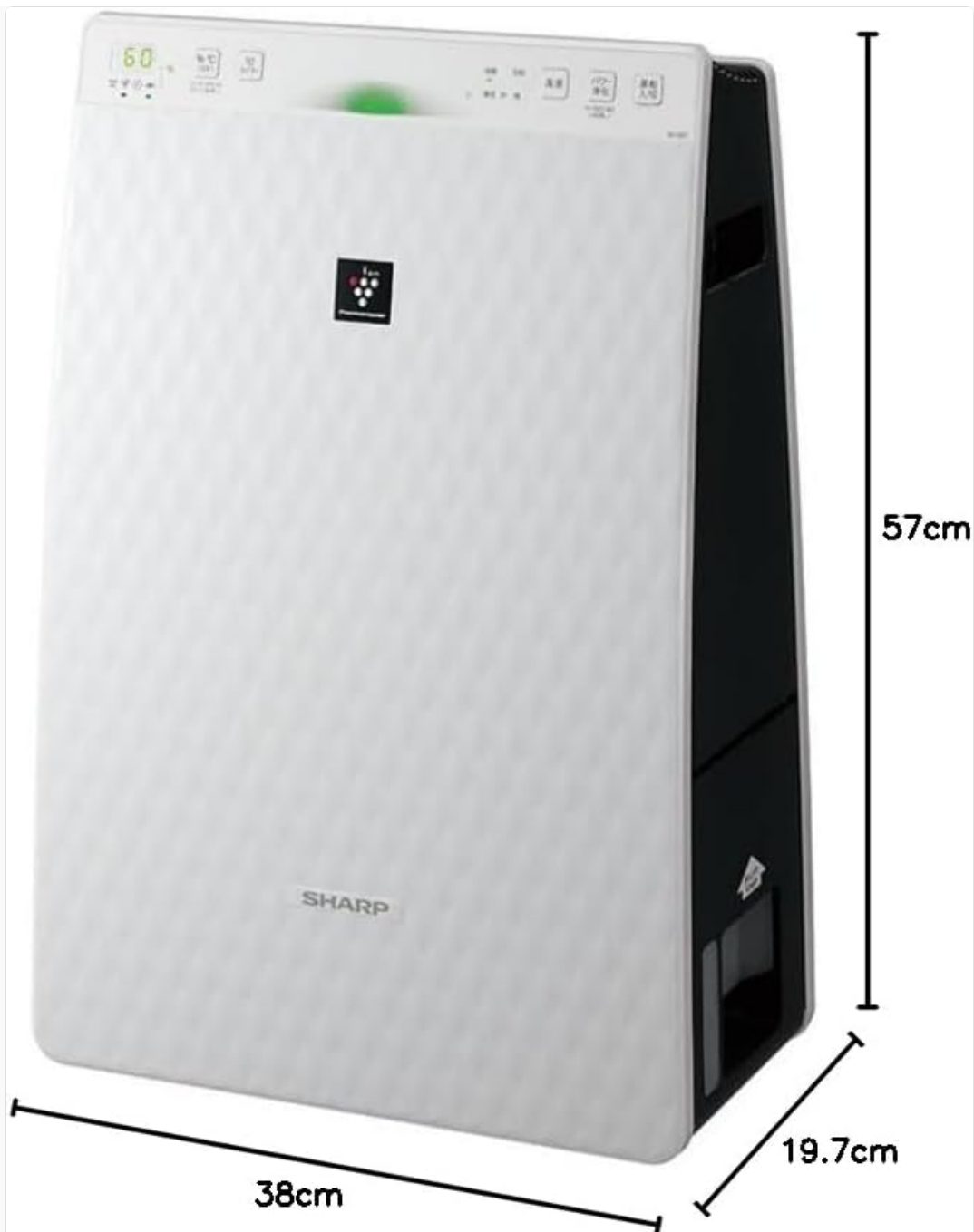
Figure 3.2: Air Purifier with Dimensions. This image provides a perspective view of the Sharp KC-35T7, illustrating its approximate dimensions: 38 cm (width), 19.7 cm (depth), and 57 cm (height). These measurements are crucial for proper placement and space planning.