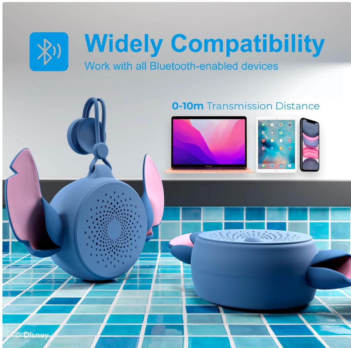
Figure 5: The speaker is compatible with various Bluetooth-enabled devices, including smartphones, tablets, and laptops, with a transmission distance of 0-10 meters.

The speaker will automatically attempt to reconnect to the last paired device when powered on, if within range.