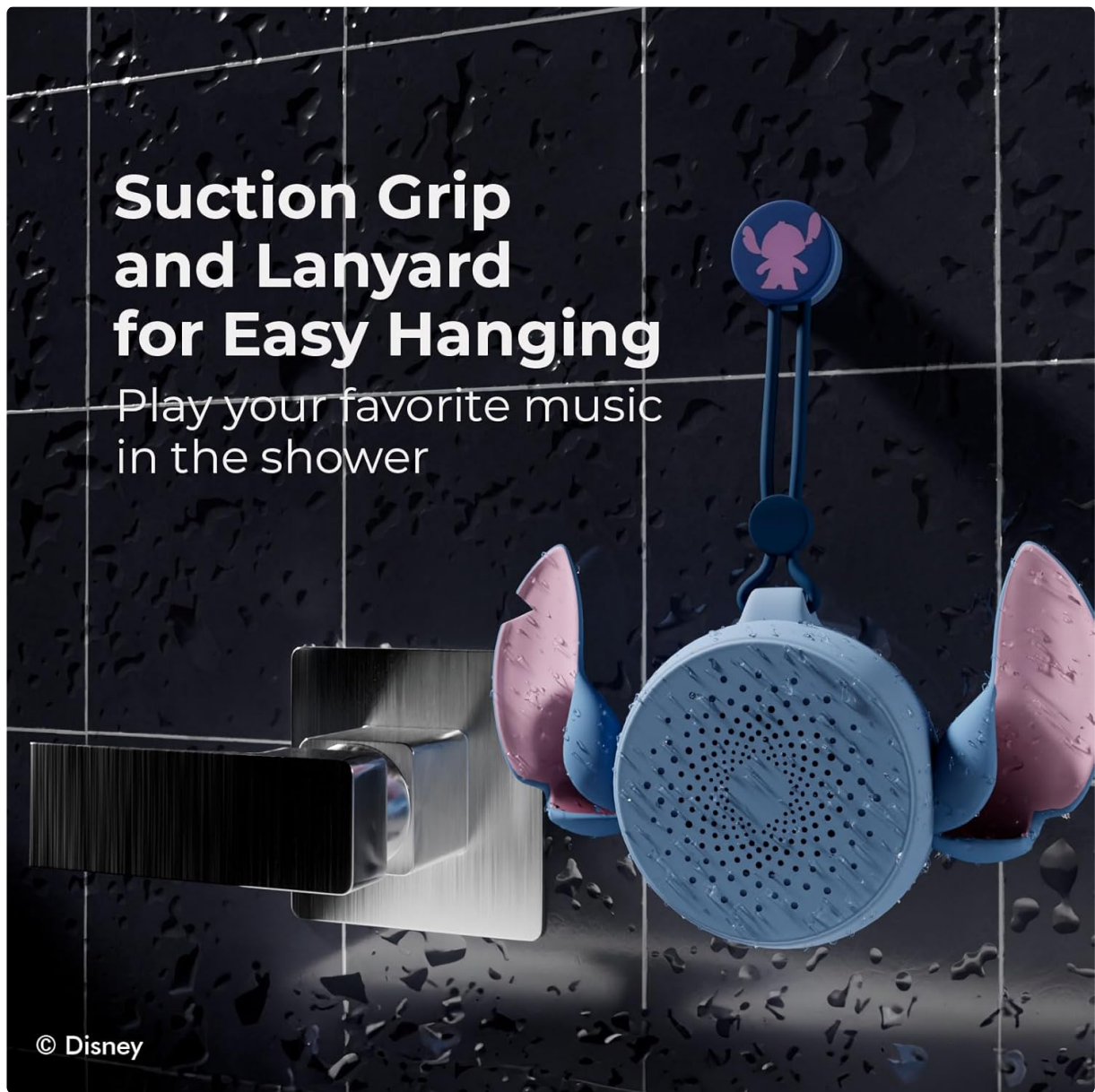
Figure 2: The speaker featuring its strong suction cup and lanyard for easy hanging on smooth surfaces.