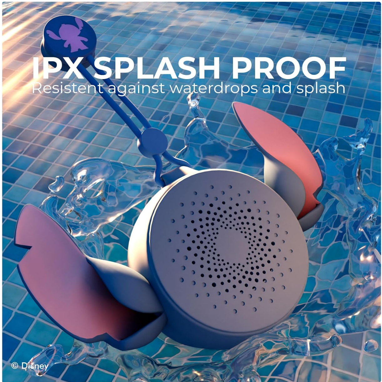
Figure 3: Demonstrating the IPX4 splash-proof capability, resistant to water droplets and splashes.