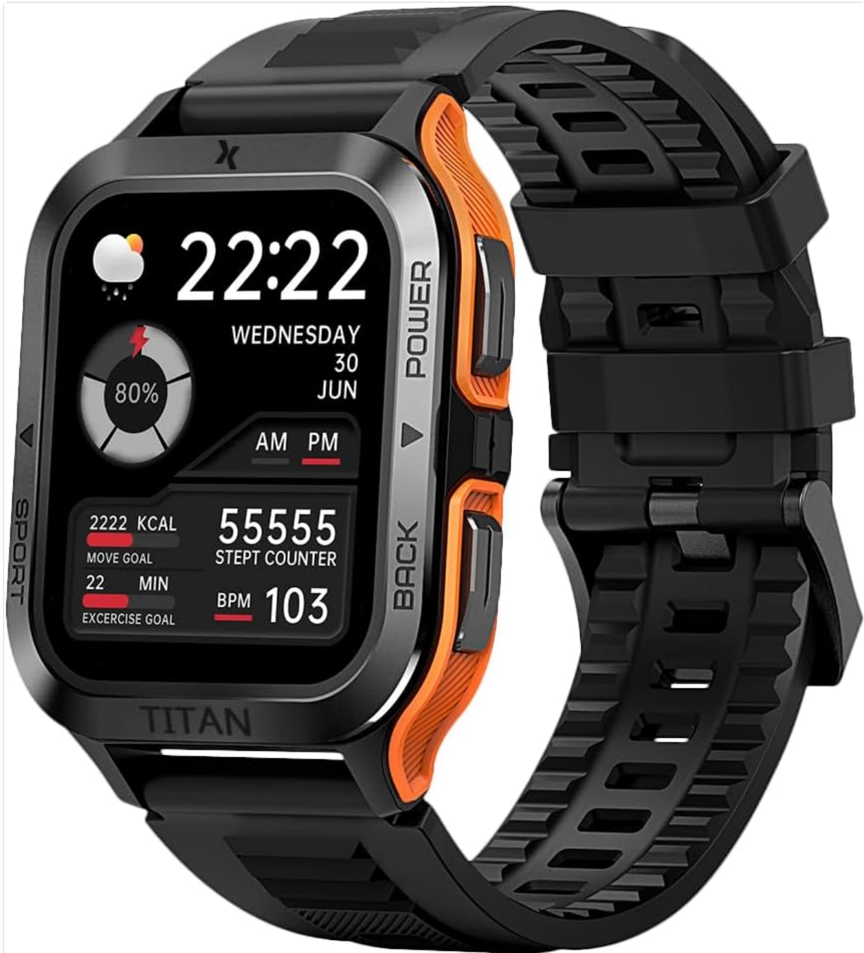
Figure 4.1: Front view of the MAXCOM FW67 Titan Pro Smartwatch, displaying the main watch face with time, date, weather, battery level, and activity metrics like calories burned and step count.

Familiarize yourself with the main components of your smartwatch.