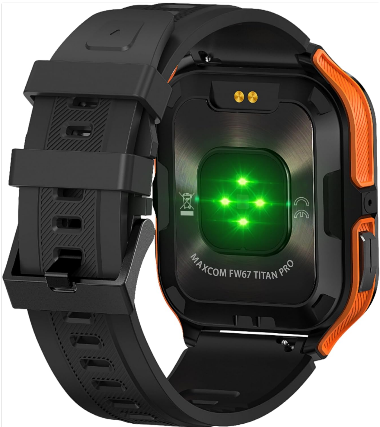
Figure 4.3: Rear view of the smartwatch, showing the optical heart rate sensors (glowing green) and the magnetic charging pins. The model name 'MAXCOM FW67 TITAN PRO' is also visible.