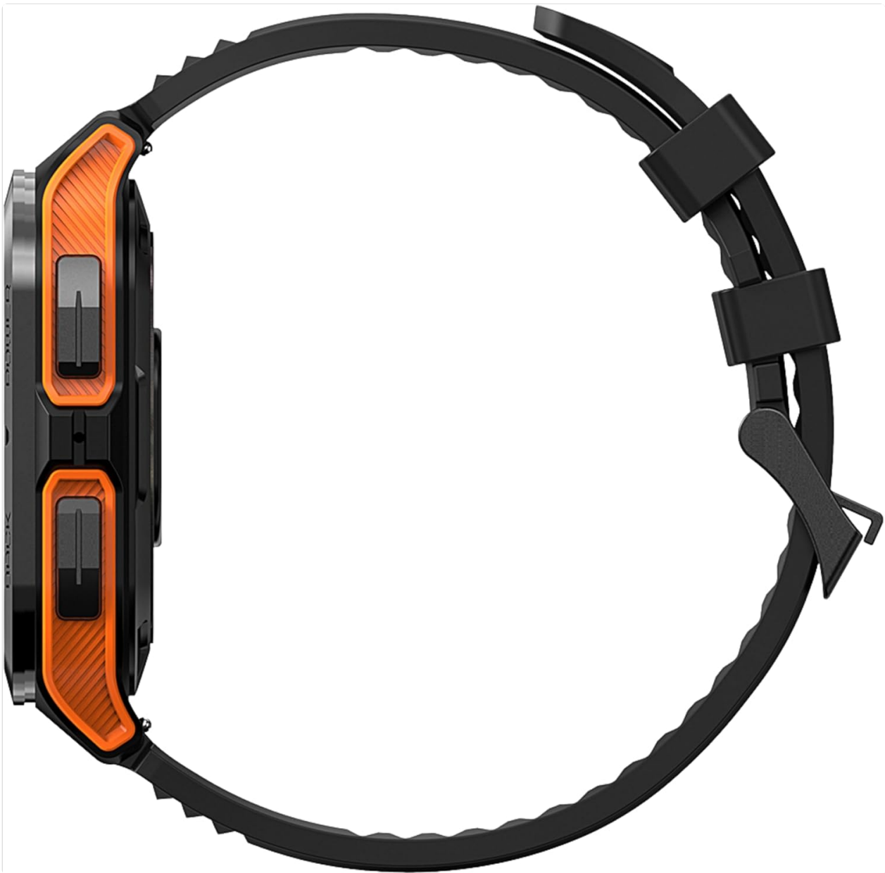
Figure 4.2: Side view of the smartwatch, highlighting the 'POWER' button at the top and the 'BACK' button below it, both located on the right side of the watch casing.