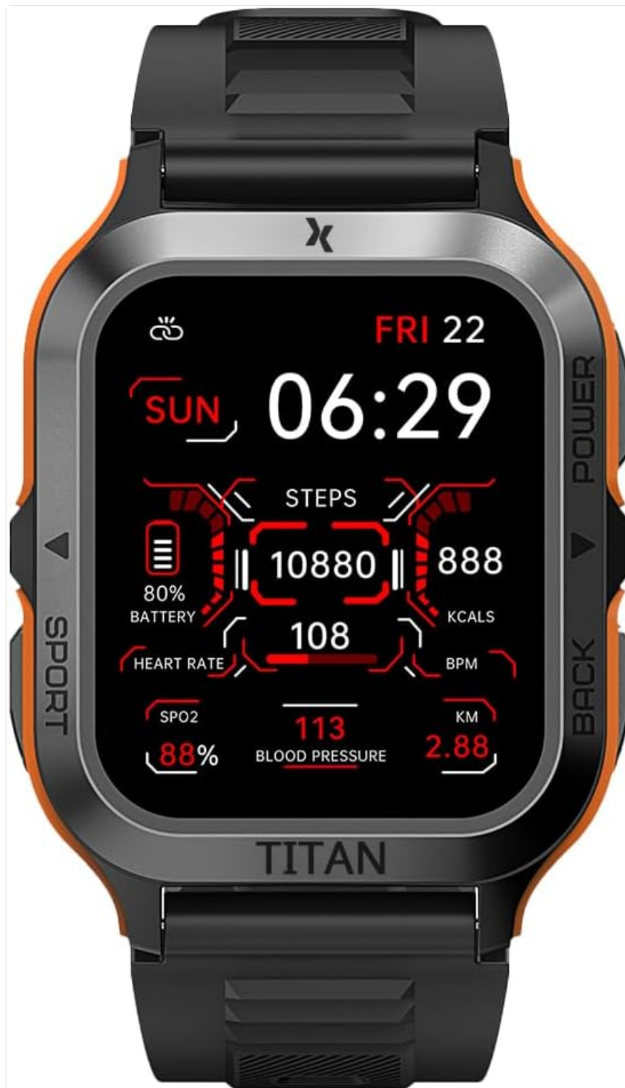
Figure 6.1: The smartwatch display showcasing various health metrics including steps taken, calories burned, heart rate, blood oxygen saturation (SpO2), and blood pressure, along with battery status.