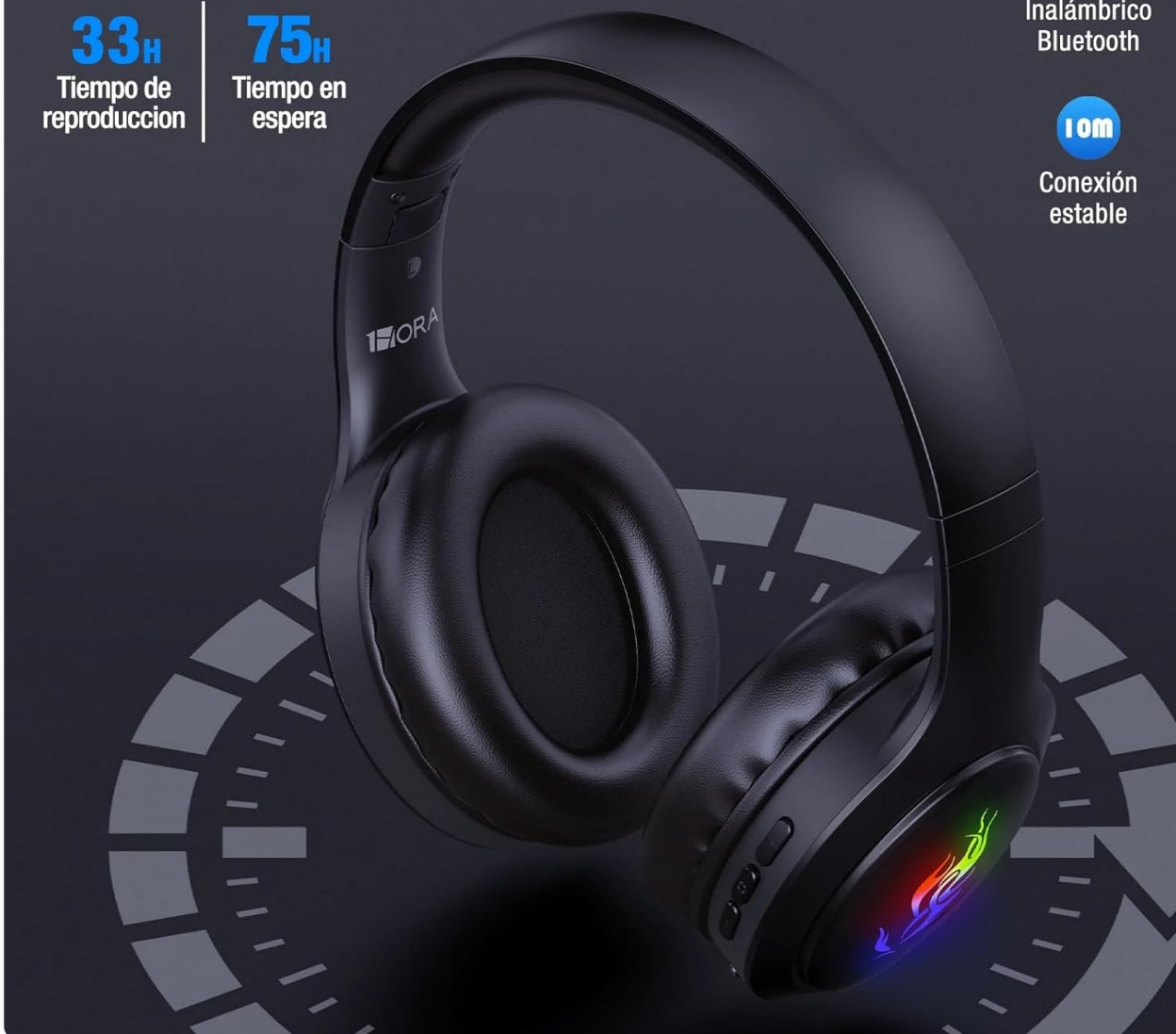
Image 4.1: Illustration of the long playback and standby times of the headphones.