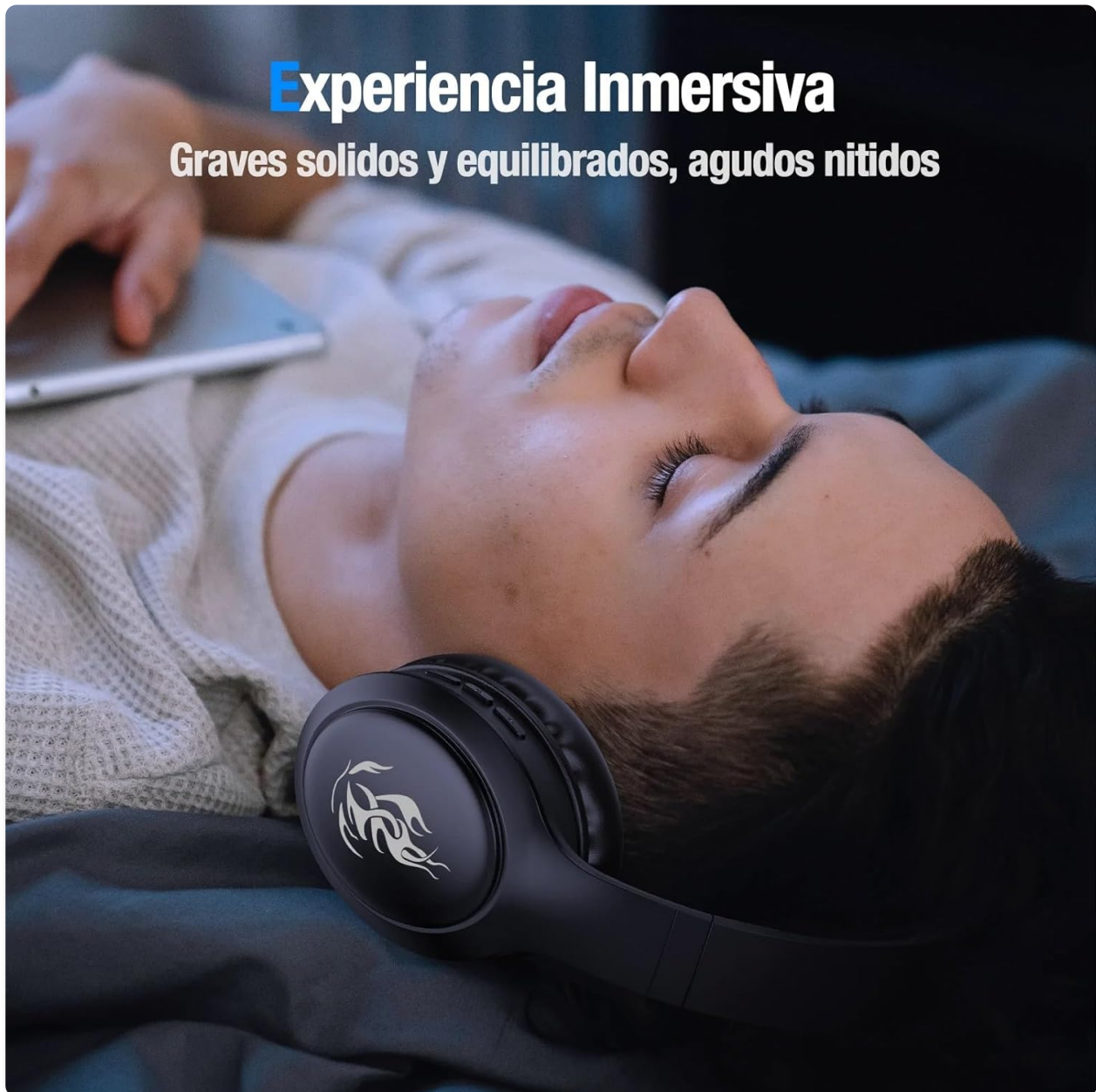
Image 5.1: Depiction of an immersive audio experience with solid and balanced bass, and crisp highs.