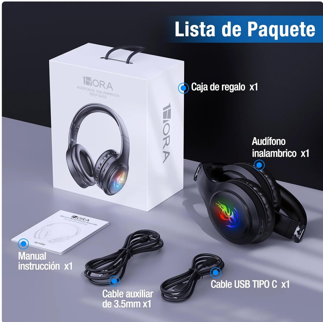
Image 2.1: Contents of the Genérico AUT202N headphone package, including the headphones, cables, and manual.