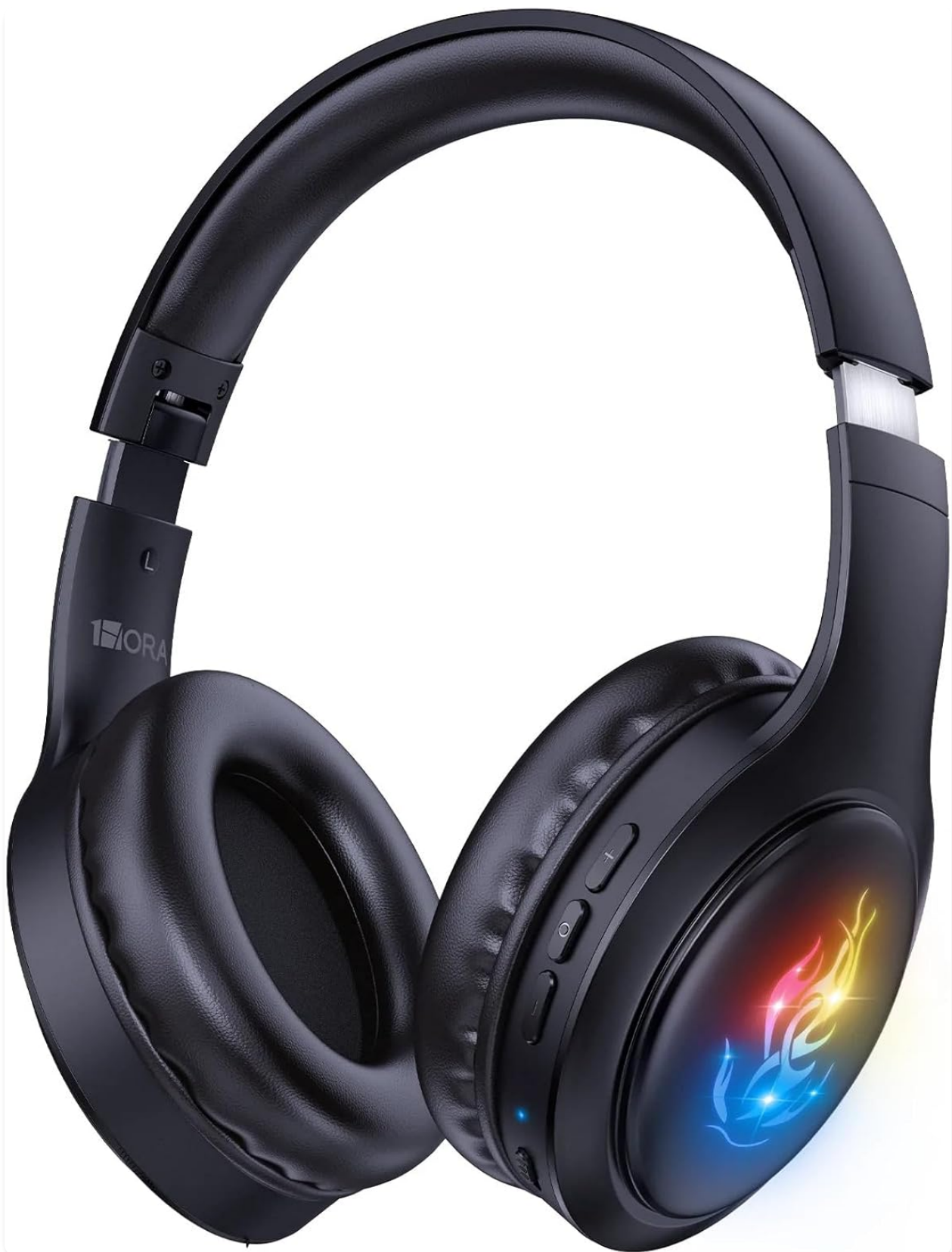
Image 1.1: Genérico AUT202N Wireless Headphones, black color, with illuminated earcups.