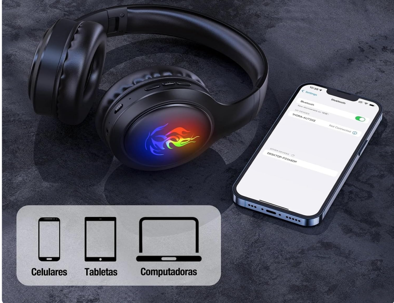
Image 4.2: Diagram showing smart pairing with mobile phones, tablets, and computers.