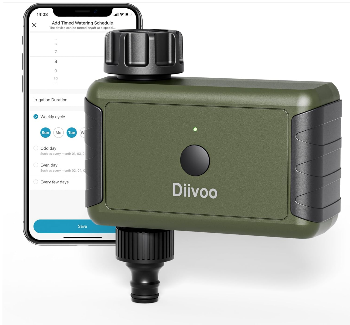
Image: The Diivoo Smart Watering Timer shown alongside a smartphone displaying its control application, illustrating the device's app-controlled functionality.