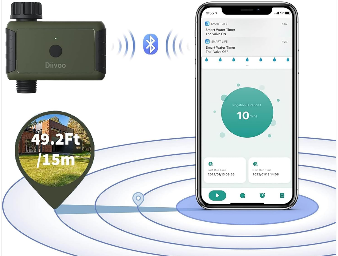
Image: An illustration showing the effective Bluetooth remote control range of the Diivoo watering timer, indicating a distance of up to 49.2 feet (15 meters).

Ideale Entfernung zur Bluetooth Control innerhalb von 49,2Ft ohne Interferenzen