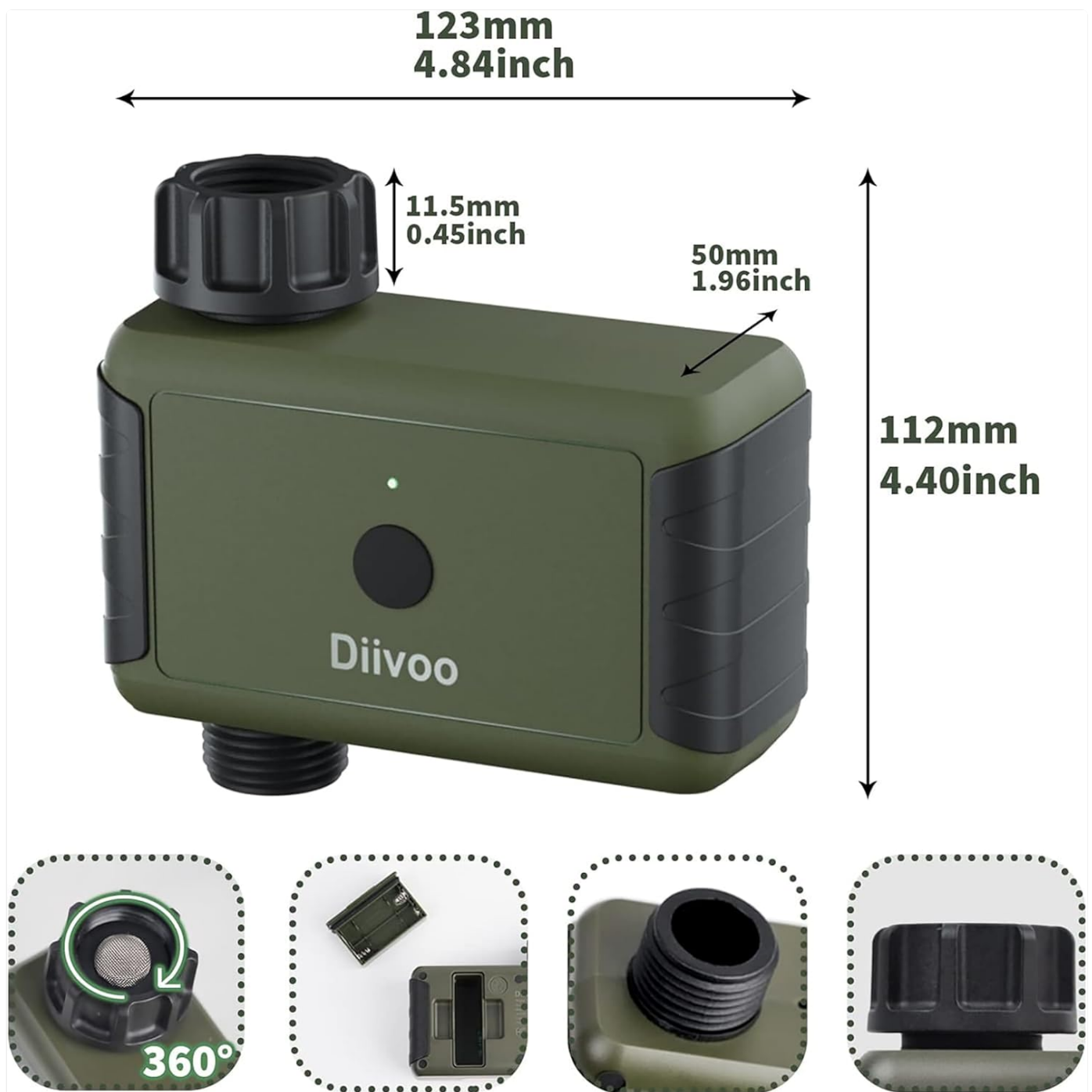
Image: A detailed view of the Diivoo watering timer's components, highlighting the battery compartment, inlet filter, and hose connections.