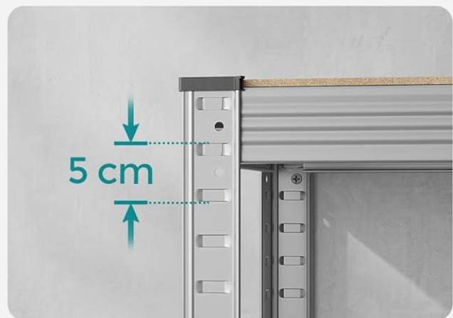
Image 4.1: Shelves can be adjusted to different heights to suit various storage needs.

Customisable with 5 cm increments to fit short and tall items