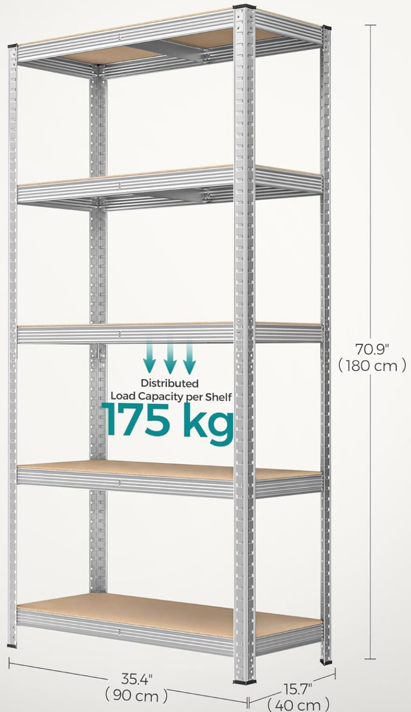
Image 4.2: The shelving unit can be divided into two smaller units for versatile use.