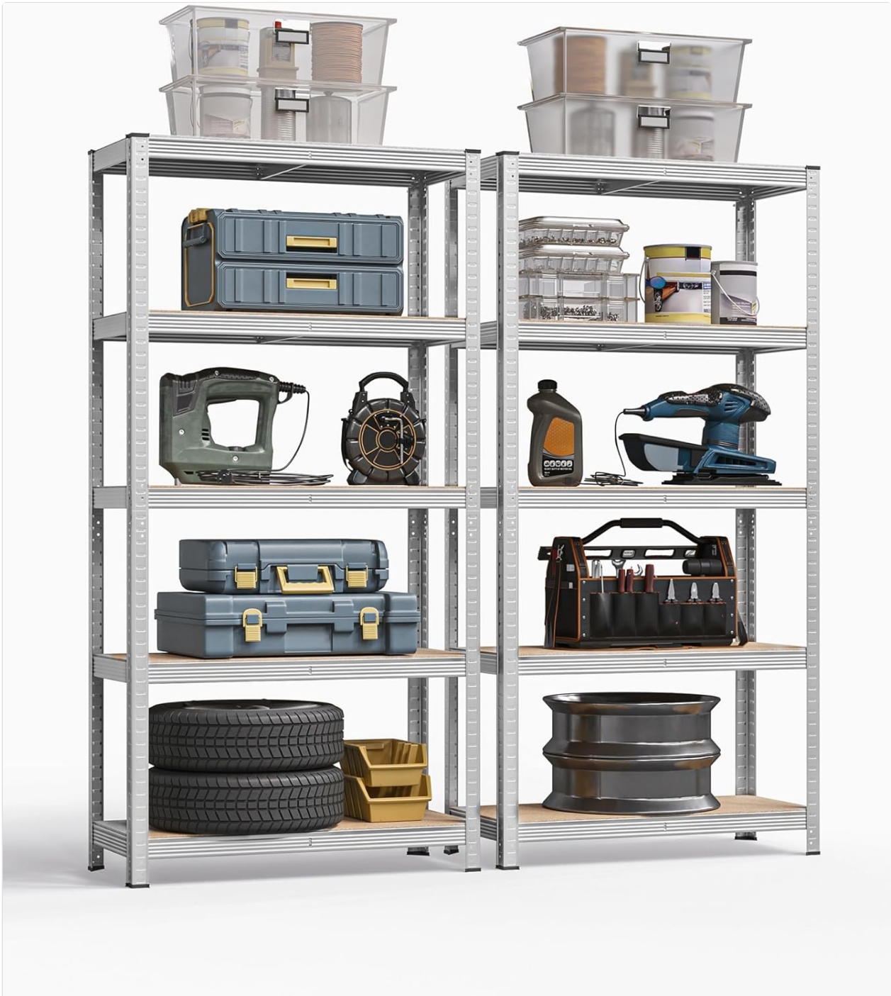
Image 2.1: Overview of two assembled shelving units, demonstrating their capacity and structure.