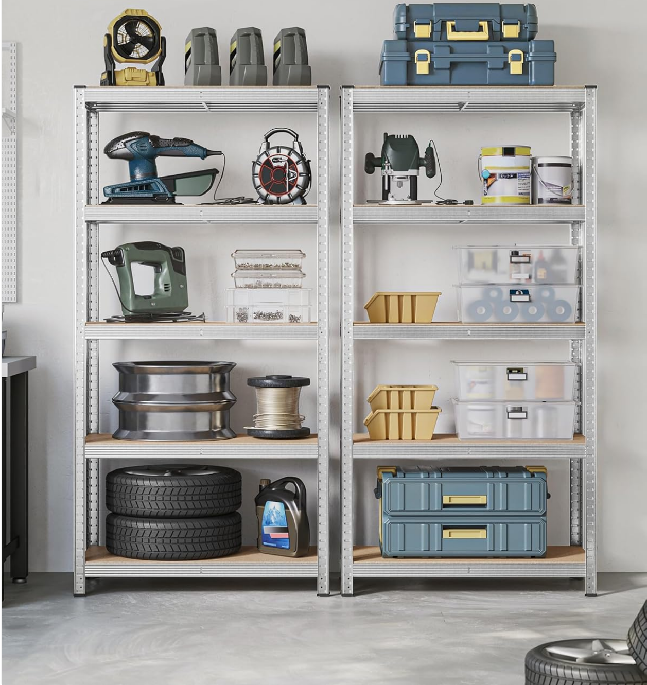
Image 7.1: Key dimensions and load capacities of the shelving unit.