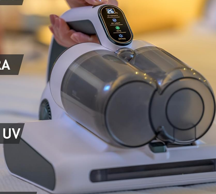
Image 2.1: Visual representation of the HMC5's four automatic functions: Suction, Beating, UV Lamp, and Drying.