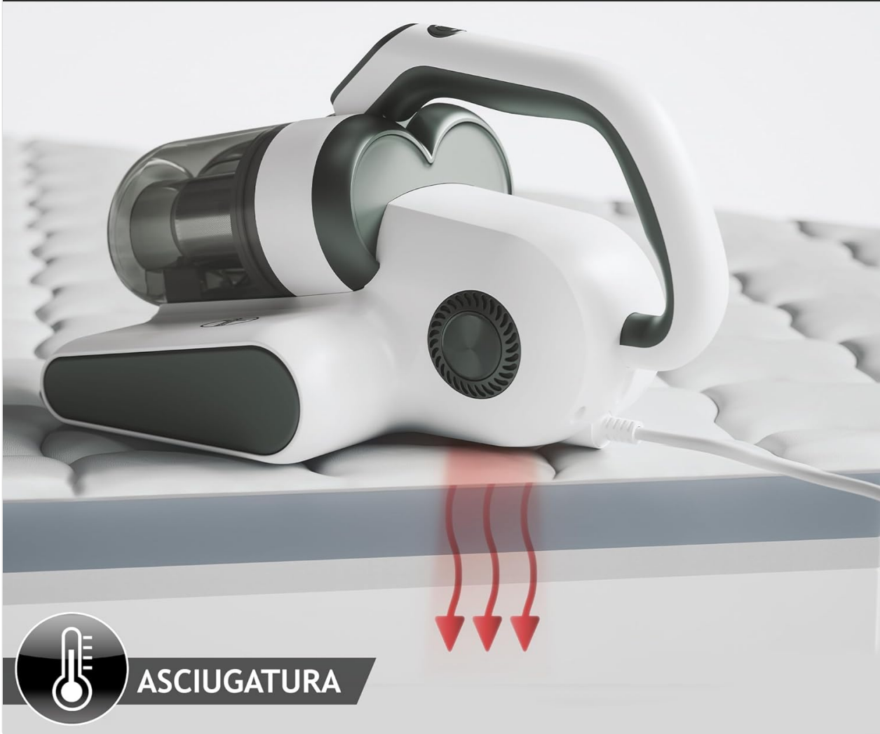
Image 2.4: The drying function of the HMC5, showing warm air preventing moisture and mold diffusion within the mattress.