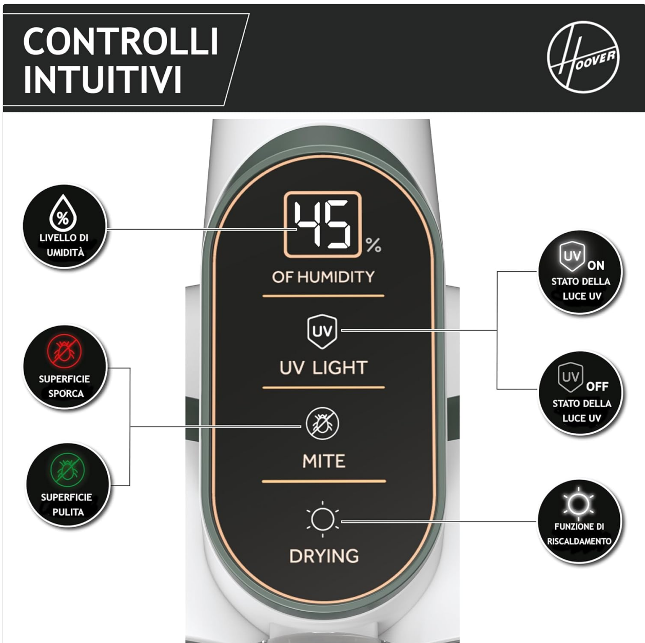
Image 4.2: A close-up of the HMC5's intuitive control panel, showing indicators for humidity level, UV light status, dust detection (mite), and drying function.