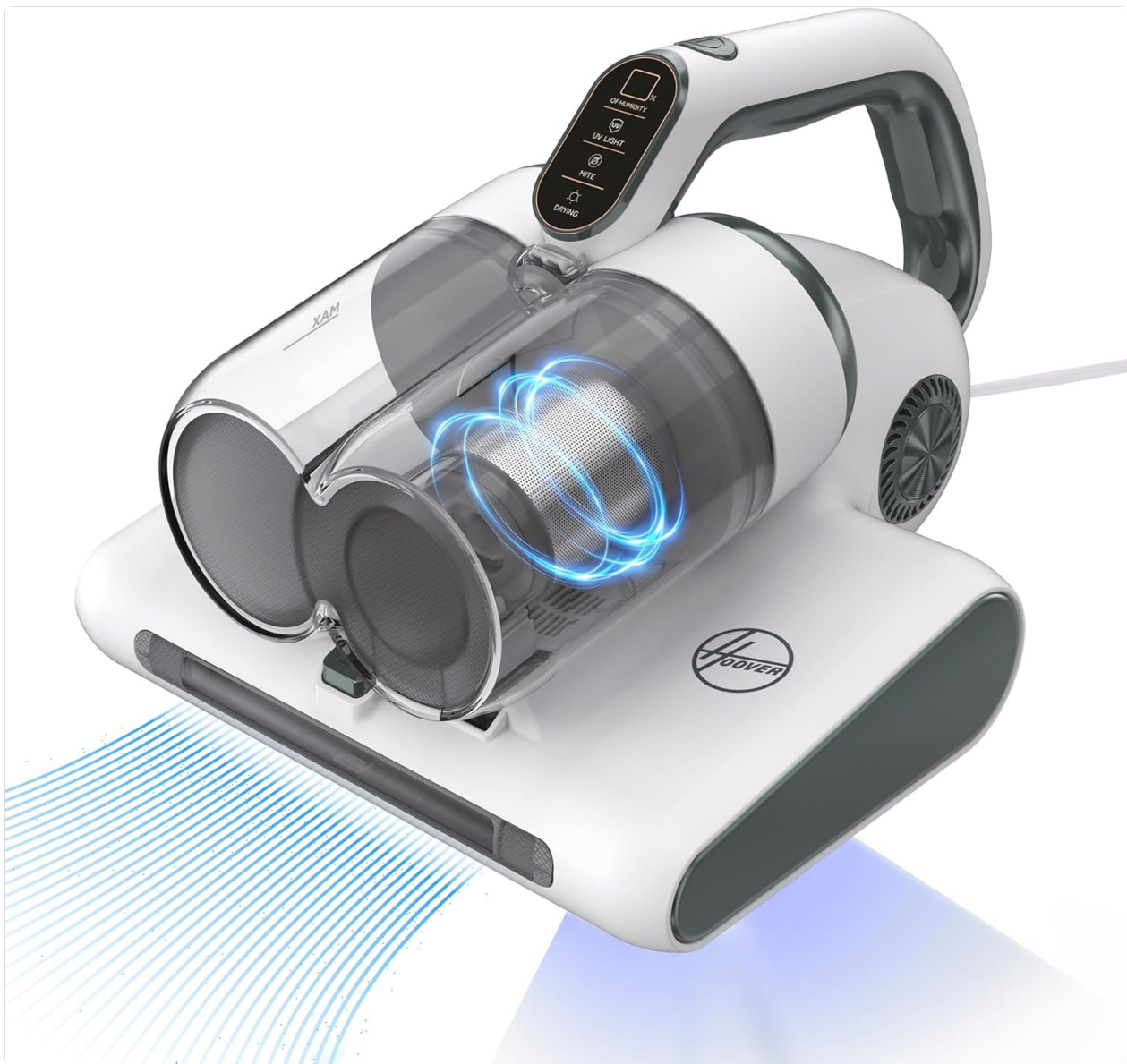
Image 1.1: The Hoover HMC5 mattress cleaner, showcasing its compact design and powerful cleaning capabilities.