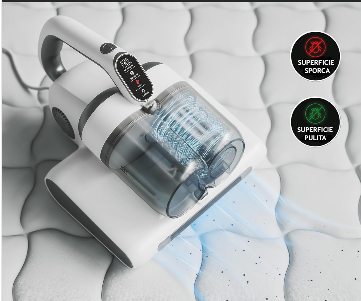
Image 2.3: The HMC5 in operation, highlighting the dust sensor indicators (red for dirty, green for clean) and the powerful suction.