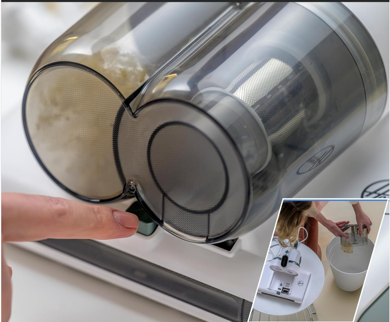
Image 5.1: Demonstrating the easy emptying process of the HMC5's dust container, designed for no-contact disposal.