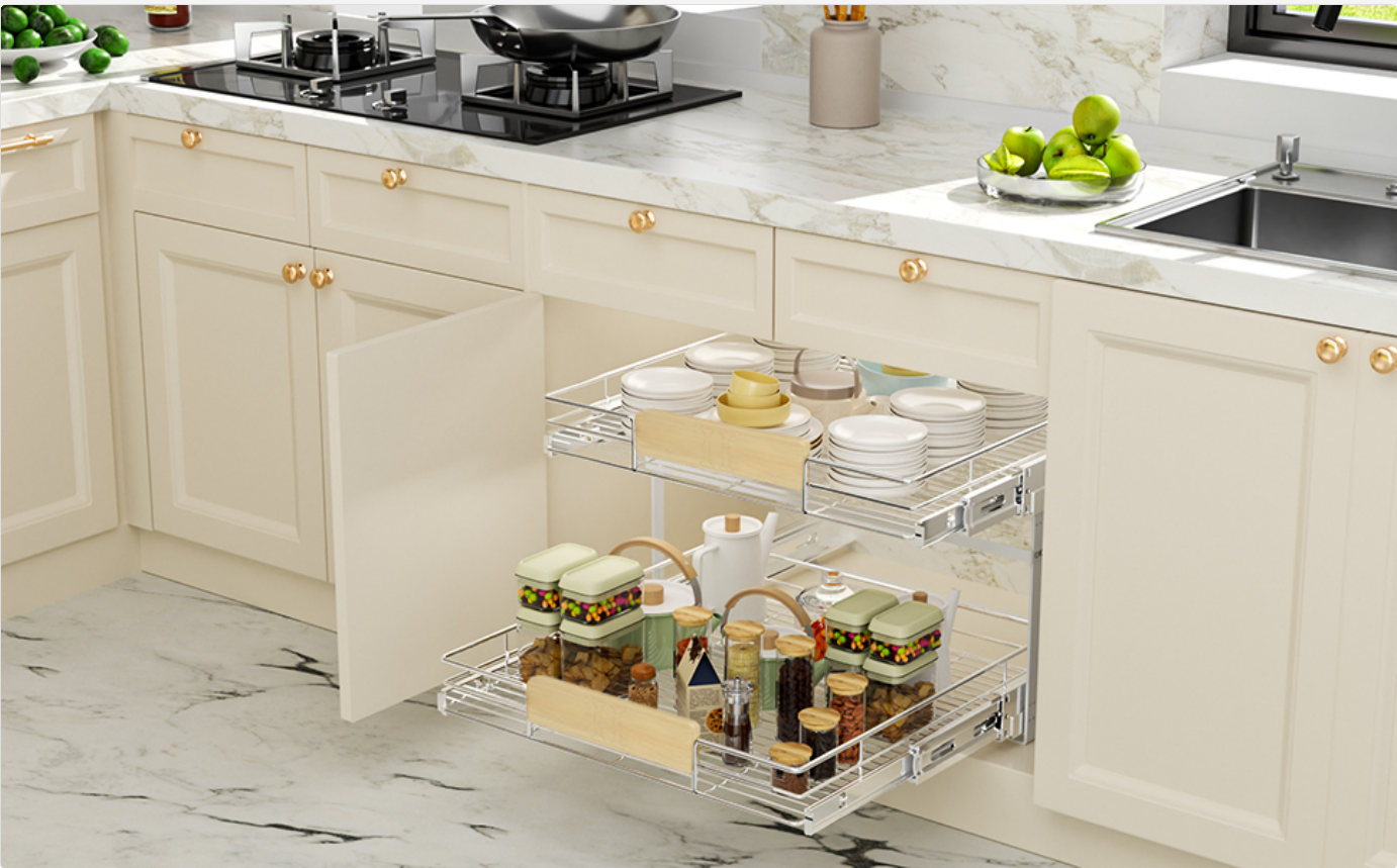
Figure 2: The organizer in use, showcasing its full extension and capacity for various kitchen items.