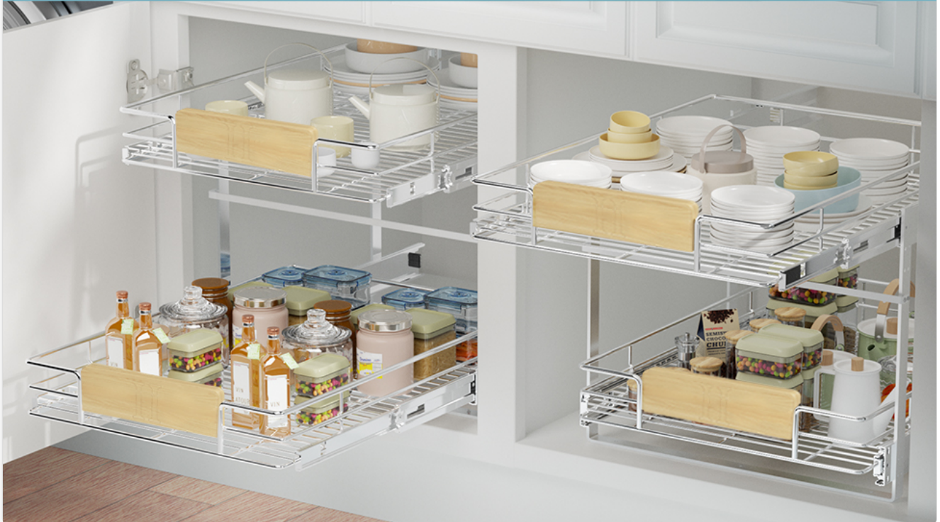
Figure 5: Adjustable height options for customizing shelf spacing.