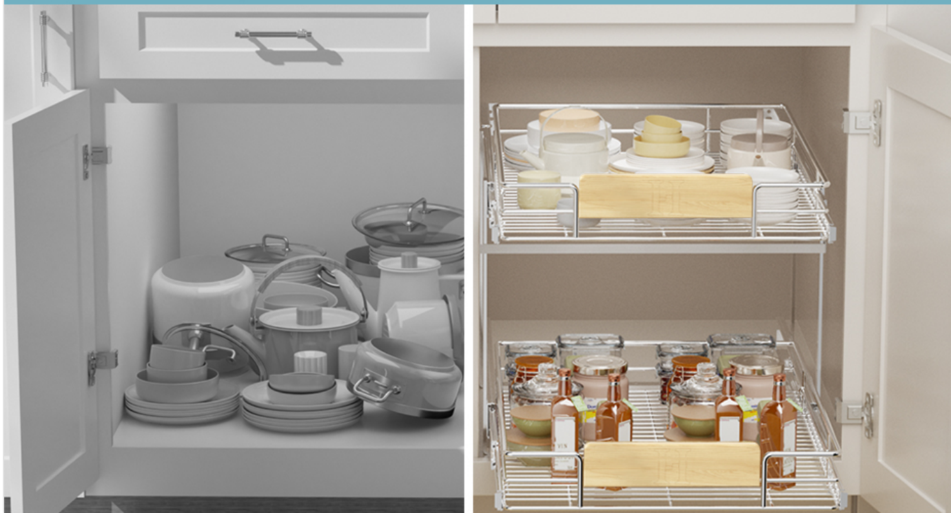
Figure 6: The organizer helps transform cluttered cabinets into tidy, accessible storage spaces.