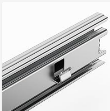
Figure 4: Detail of the smooth ball bearing slide system.