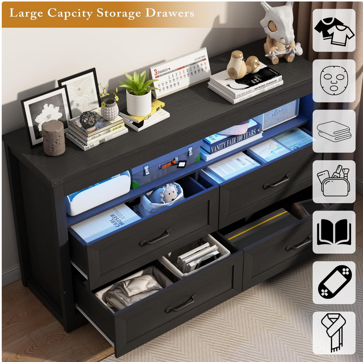
Image 5.1: Open drawers demonstrating the storage capacity for clothing and other items.