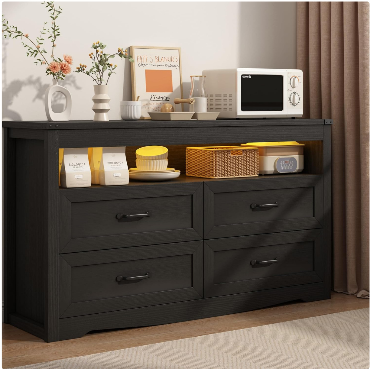
Image 1.1: The Wodeer Black 4-Drawer Dresser with LED Light, showcasing its design and open shelf.