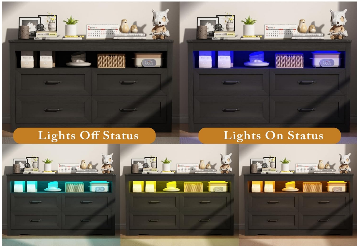
Image 5.2: Visual representation of the LED light features, including color changes and control options.