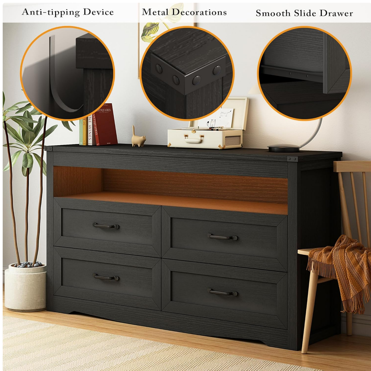
Image 2.1: Detail of the anti-tipping device installation point, metal corner decorations, and the smooth drawer slide mechanism.