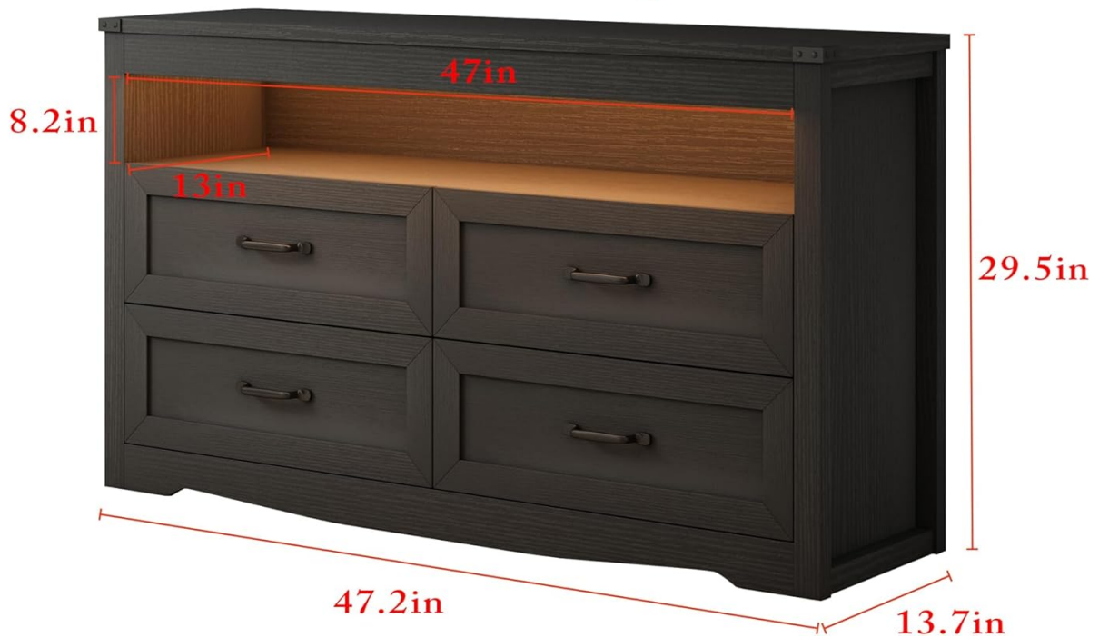
Image 8.1: Detailed dimensions of the dresser and a single drawer.