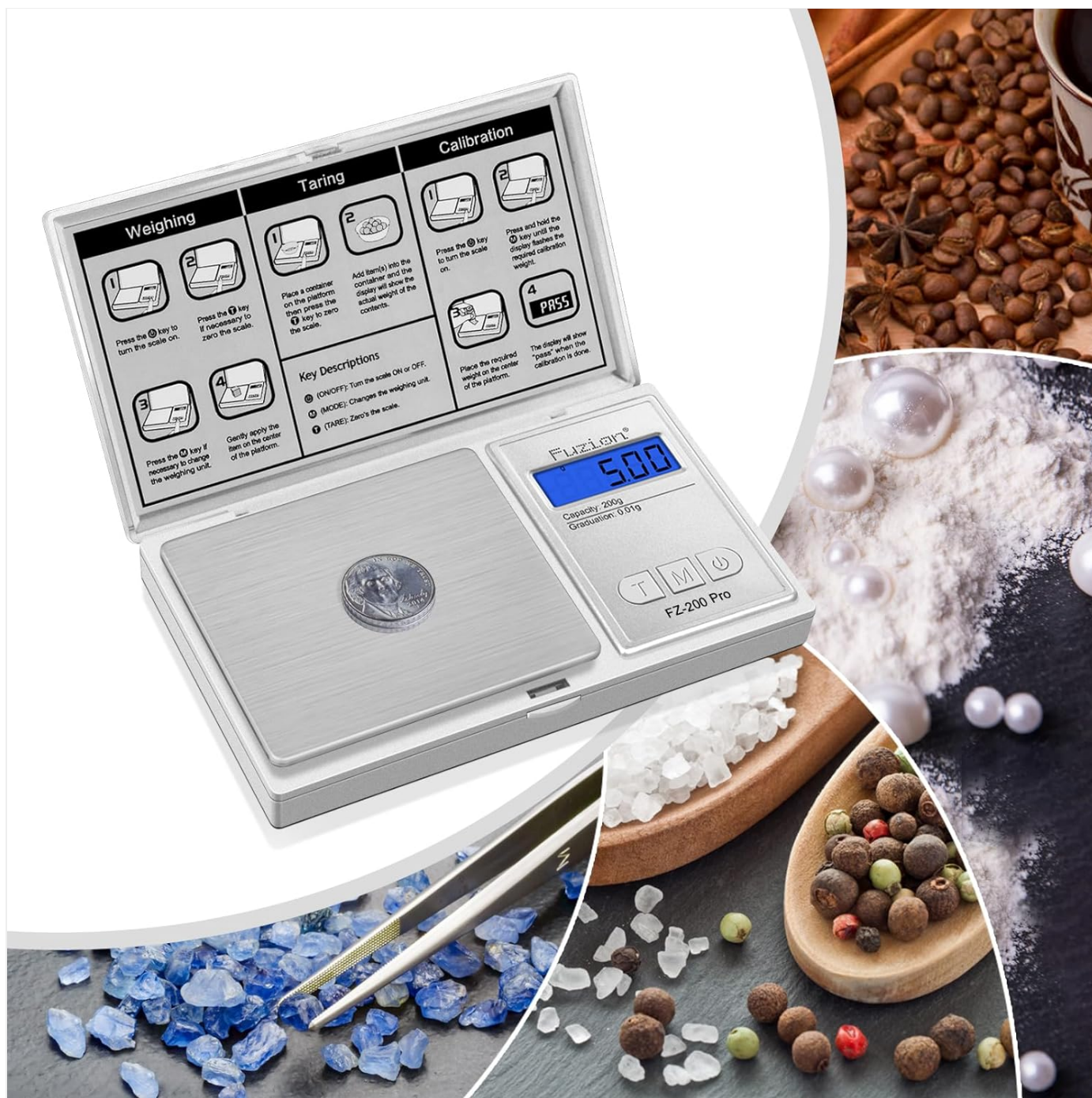
Image: The Fuzion Digital Pocket Scale displaying the weight of various small items.

Place the item(s) gently on the center of the stainless steel weighing platform. The weight will be displayed on the LCD screen.