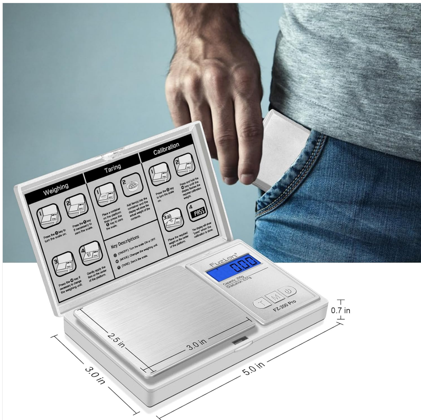
Image: The Fuzion Digital Pocket Scale demonstrating its compact and portable design.