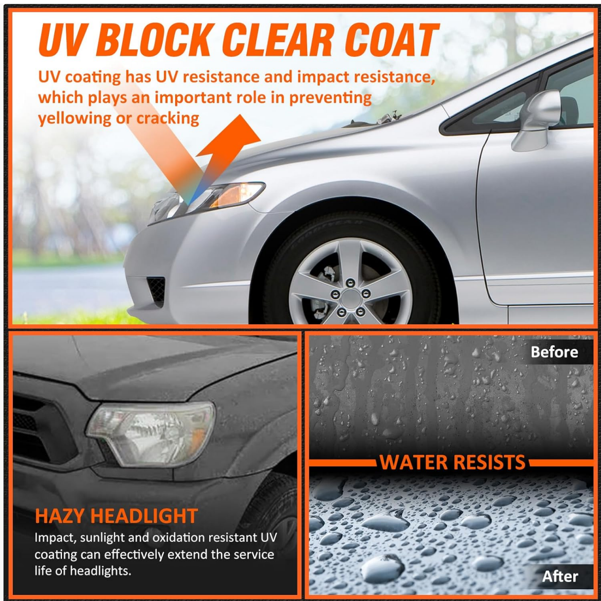
Image 5: The UV block clear coat helps prevent hazing and cracking over time.