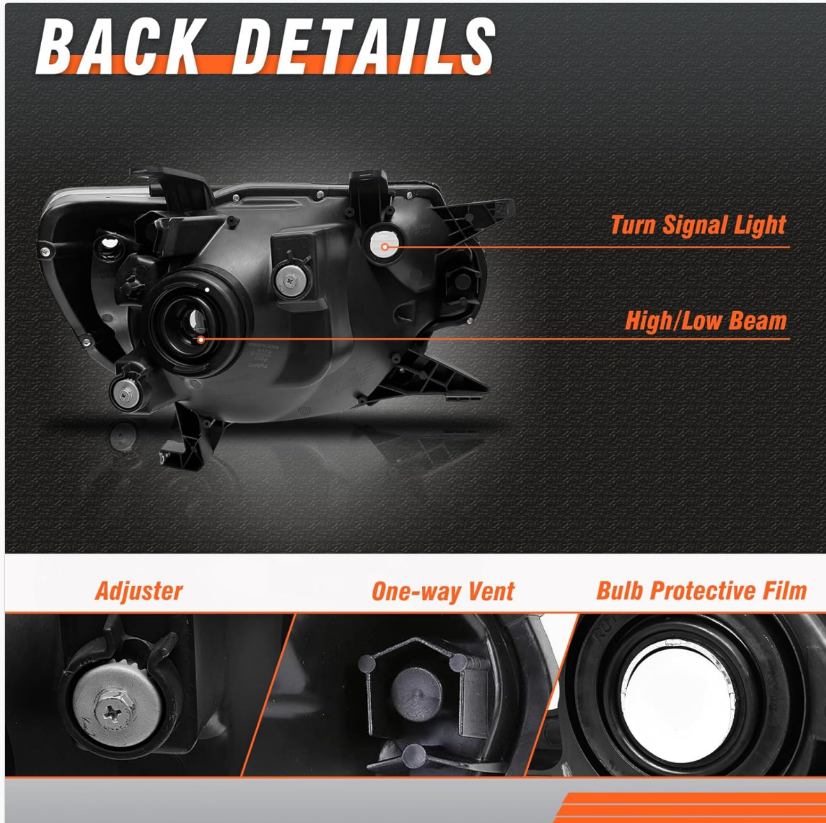
Image 6: Rear view of the headlight assembly, highlighting the adjuster for beam alignment.