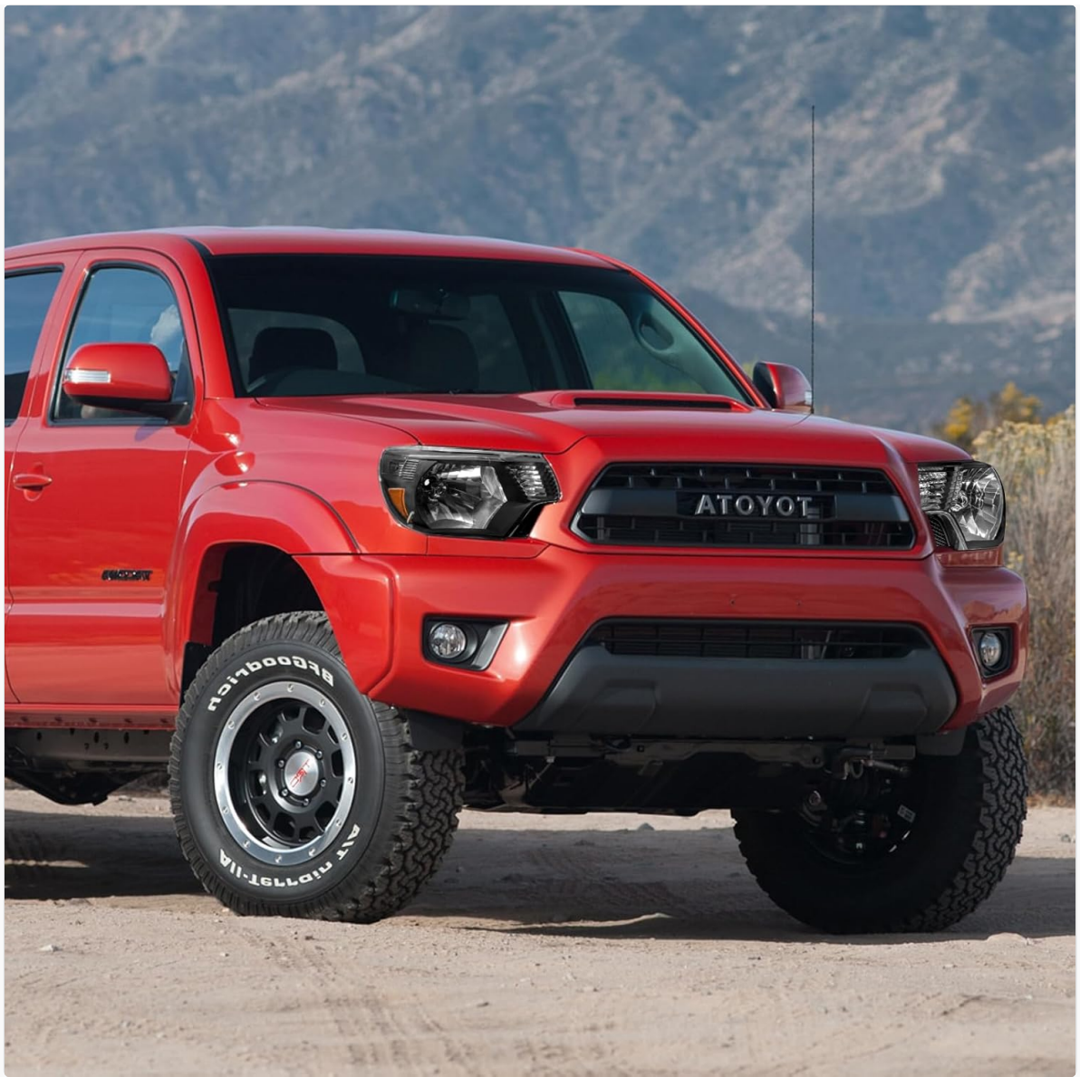
Image 7: AXLAHA Headlight Assemblies installed on a Toyota Tacoma.