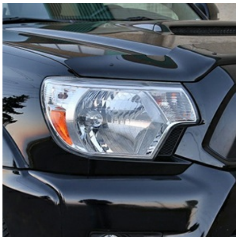
Image: Visual explanation of the UV coating's role in preventing yellowing and cracking of the headlight lens.