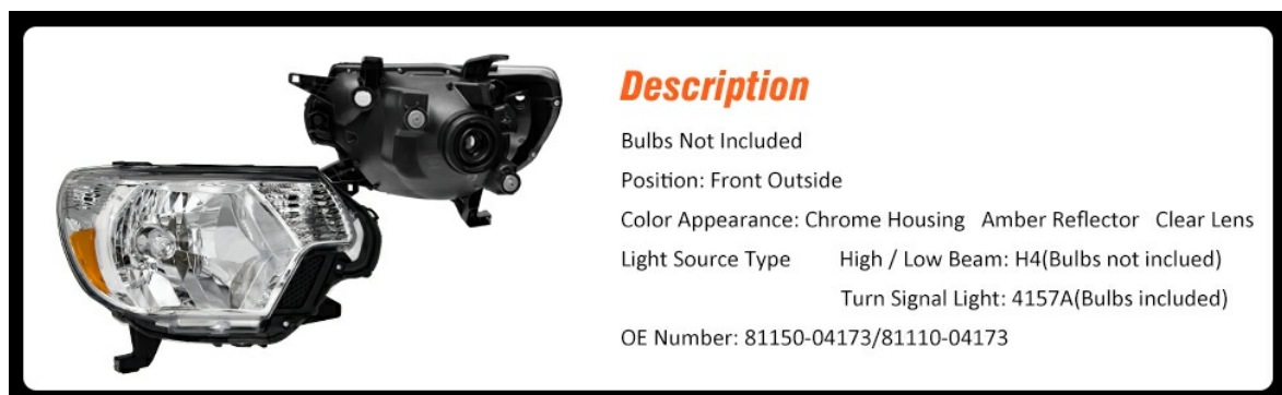
Image: Detailed view of the rear of the headlight assembly, showing the adjuster, one-way vent, and bulb protective film.

Image: Detailed view of the front of the headlight assembly, highlighting the clear lens, parking light, turn signal light, high/low beam, and safety reflector.