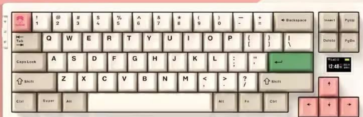
Image: The VGN X68 keyboard, showcasing its compact layout and keycap design.

Three-mode customized mechanical keyboard