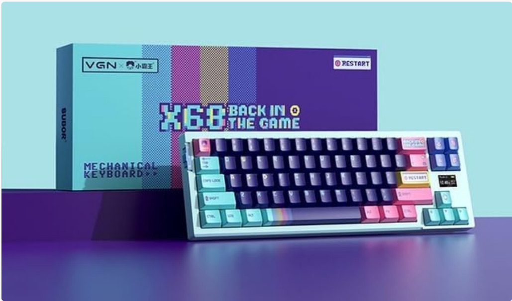
Image: The VGN X68 Mechanical Gaming Keyboard with its retail packaging, showcasing its design and RGB lighting.

Thank you for choosing the VGN X68 Mechanical Gaming Keyboard. This user manual provides detailed instructions on setting up, operating, and maintaining your new keyboard. The VGN X68 is a versatile mechanical keyboard designed for gaming and productivity, featuring three connectivity modes (wired, 2.4G wireless, and Bluetooth 5.0), vibrant RGB backlighting, and hot-swappable switches for personalized customization.