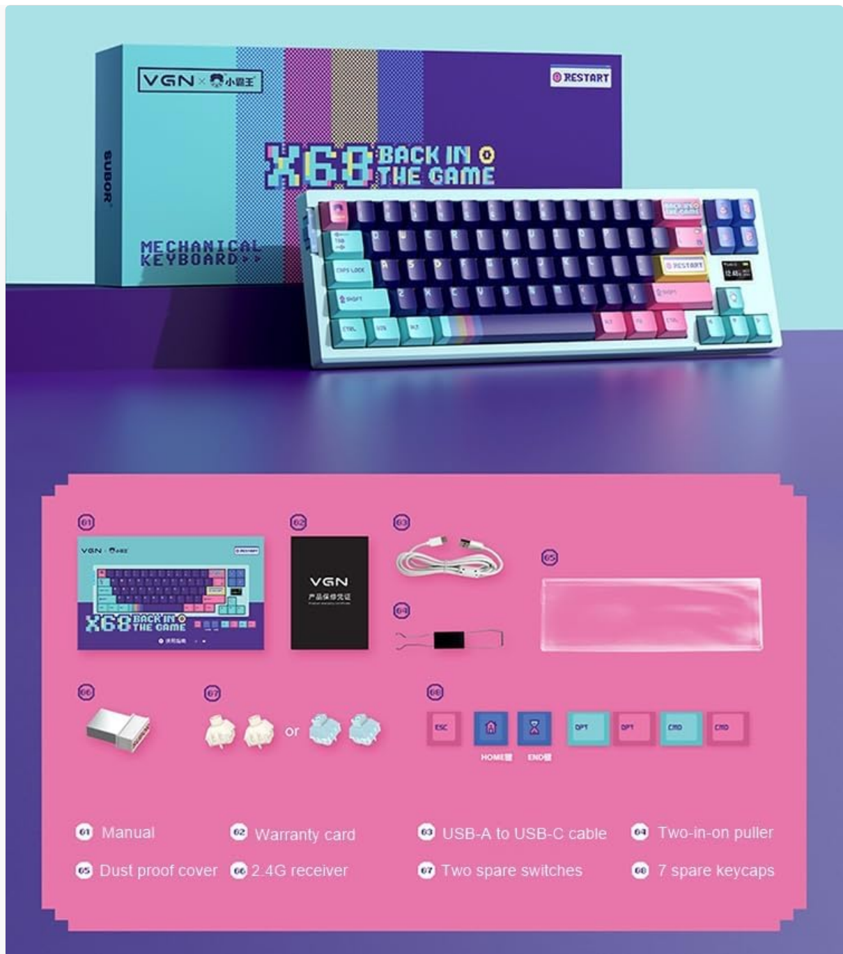
Image: A visual representation of all items included in the VGN X68 keyboard package.