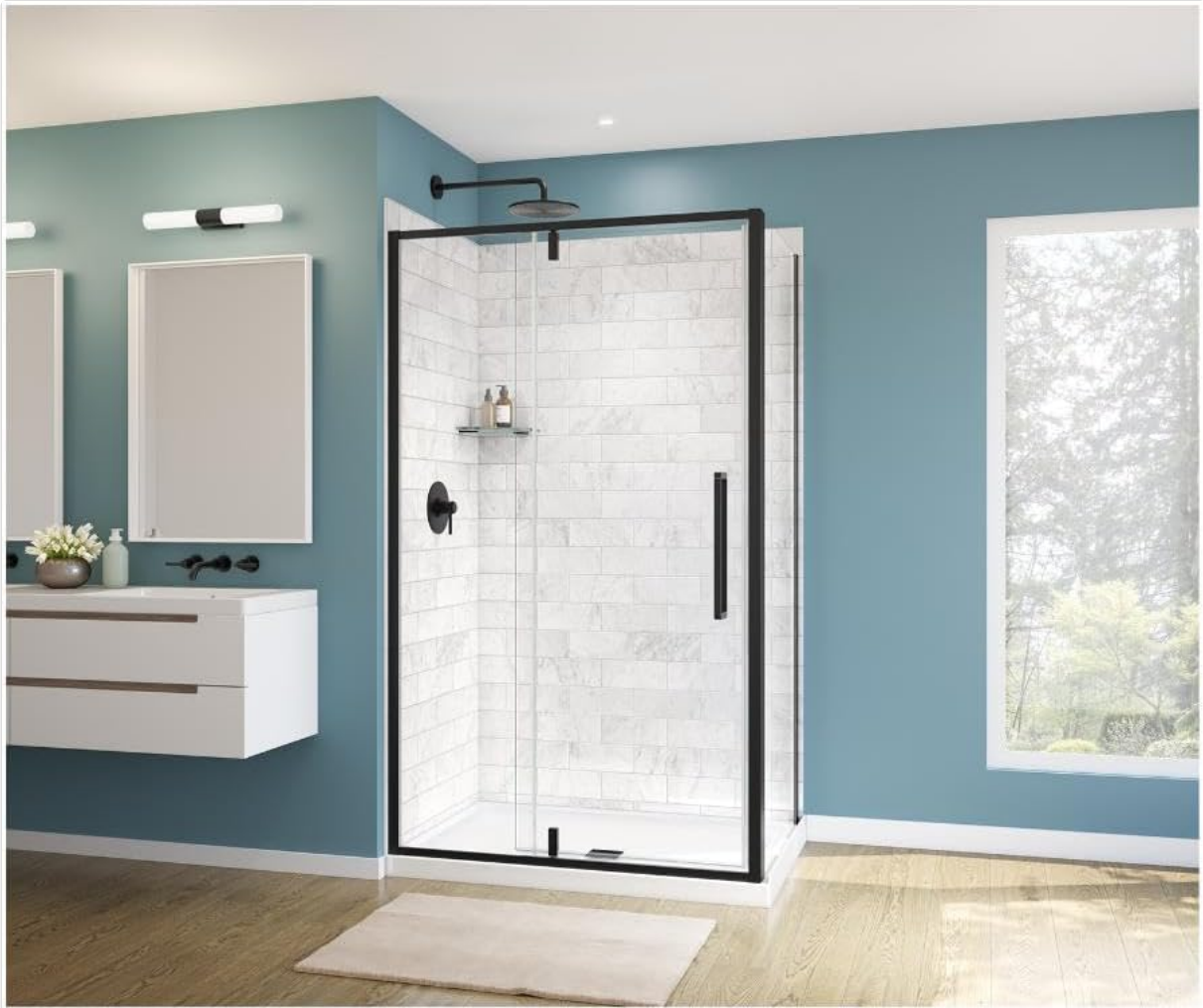
Image 1: Example of a MAAX Uptown Frameless Shower Enclosure with a return panel installed in a bathroom setting. This image illustrates how the return panel integrates with a shower door to form a corner unit.