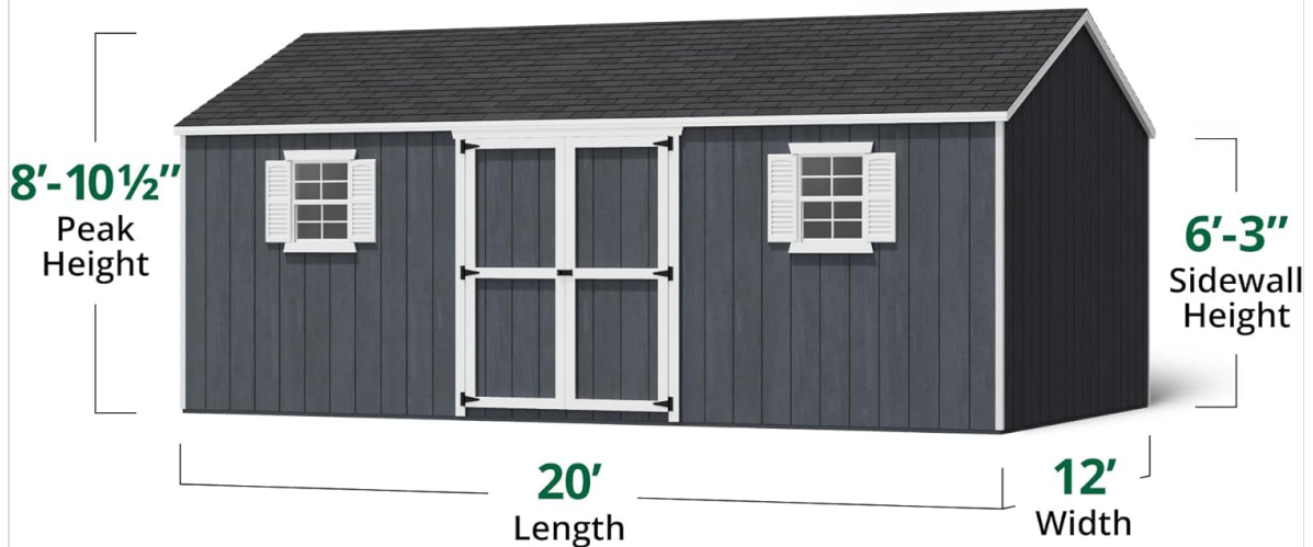
Figure 4: Key dimensions of the 12x20 Value Workshop Shed.