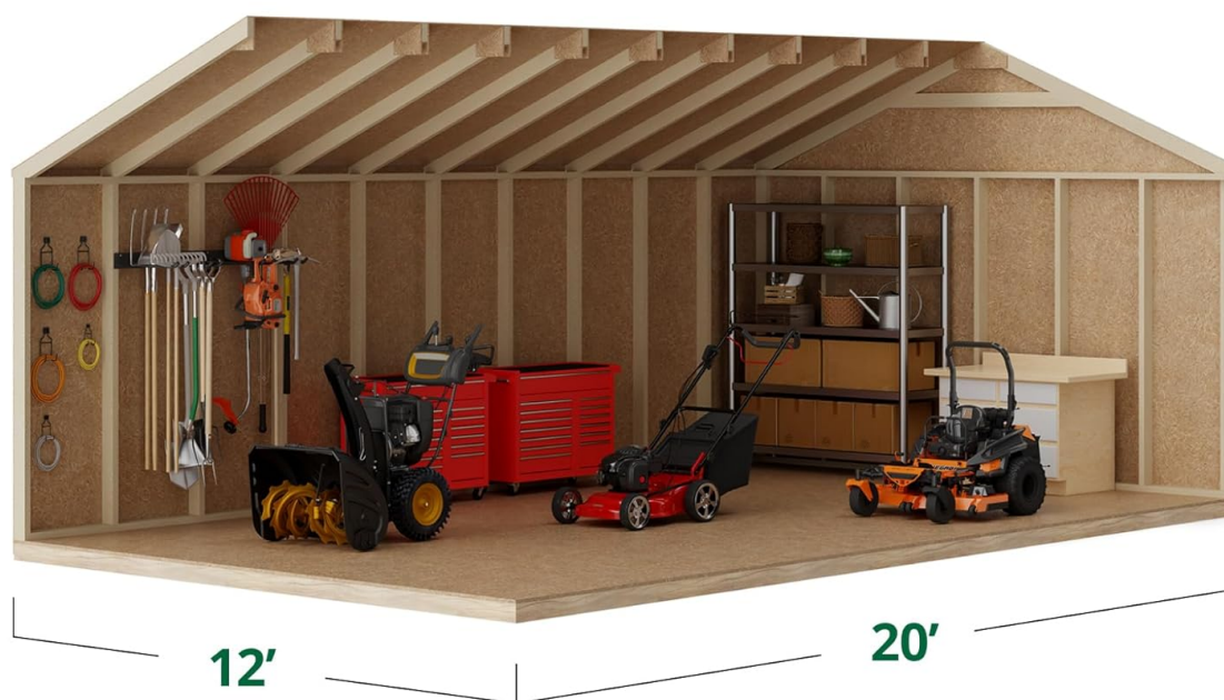
Figure 7: The spacious interior of the shed, demonstrating its versatile storage capabilities.