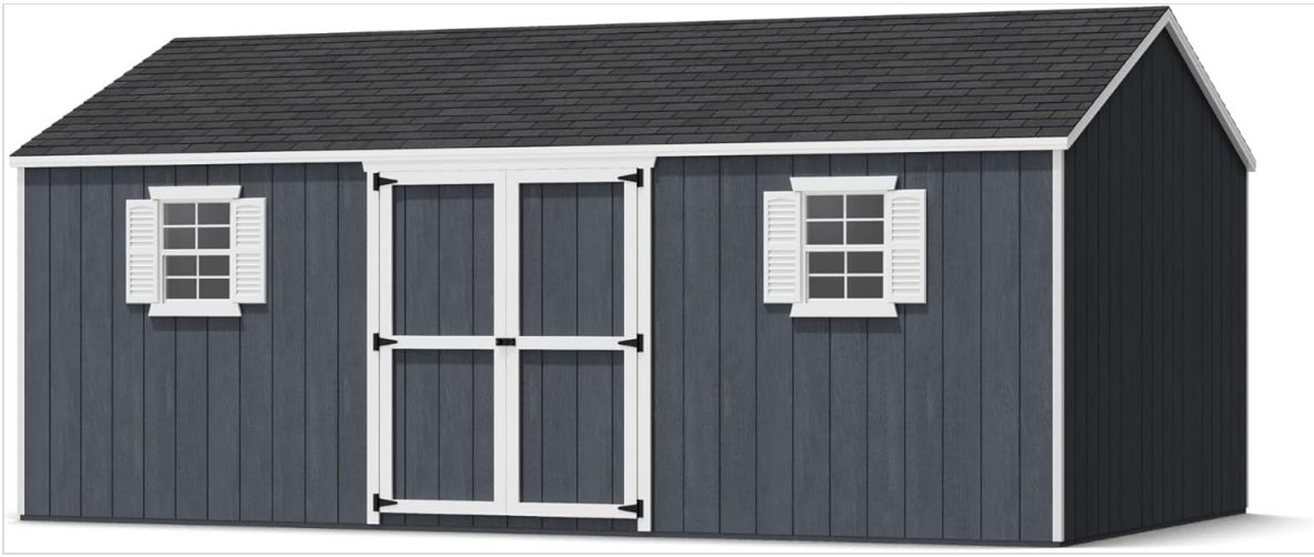
Figure 1: Exterior view of the Little Cottage Co. 12x20 Value Workshop Shed.