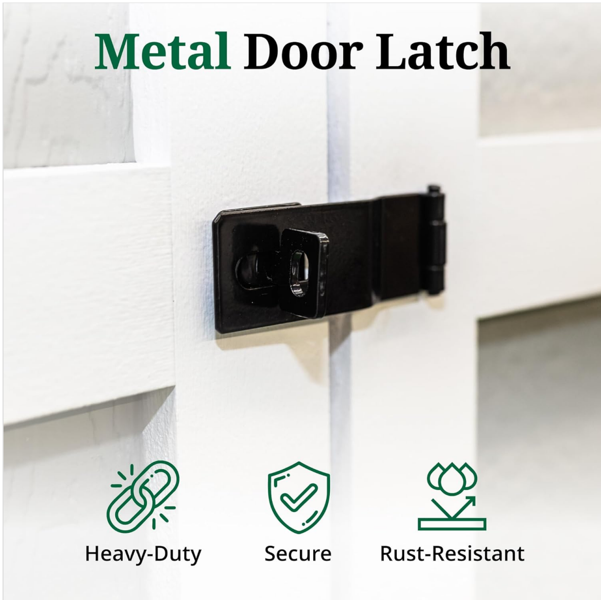
Figure 6: The heavy-duty, secure, and rust-resistant metal door latch.