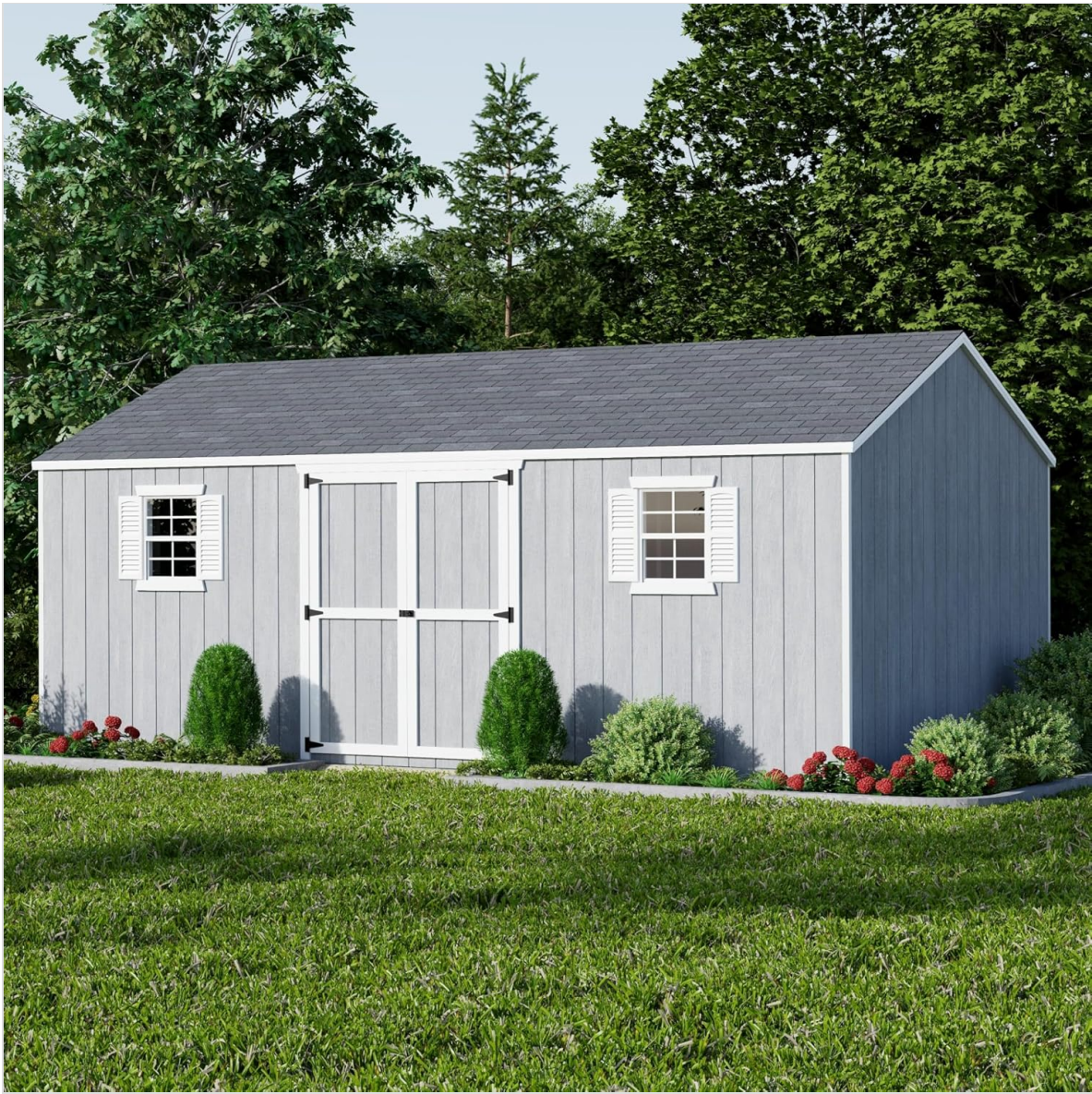
Figure 3: The shed positioned in a garden, illustrating its outdoor placement.