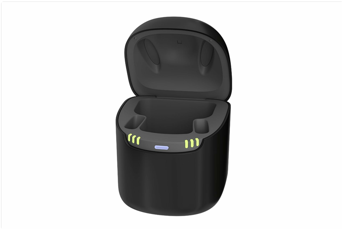
Figure 1: Front view of the Connexx Charging+ Station B-P. The device is black with a sleek, rounded design. Indicator lights are visible on the front panel, showing charging status.