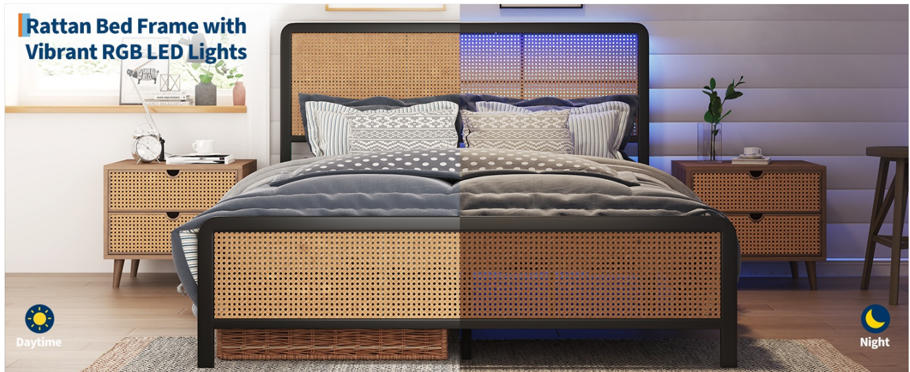
Image: Visual representation of LED lights during daytime and nighttime.