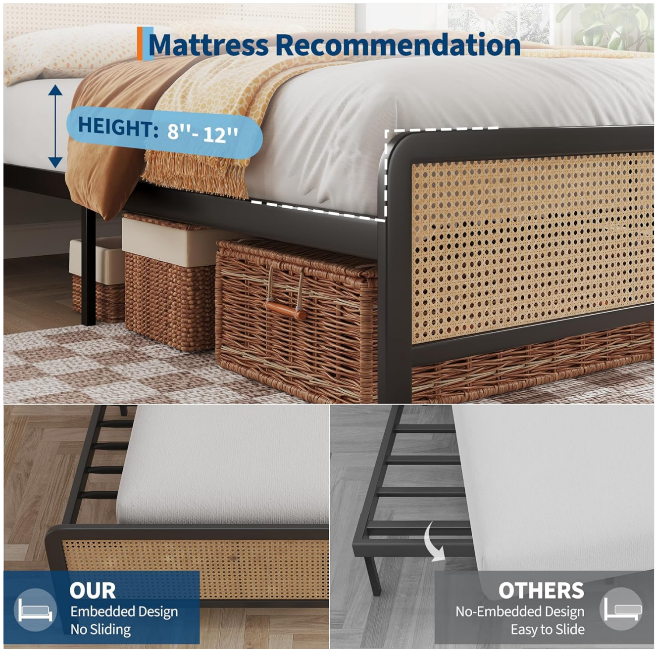
Image: Mattress recommendation and embedded design to prevent mattress sliding.