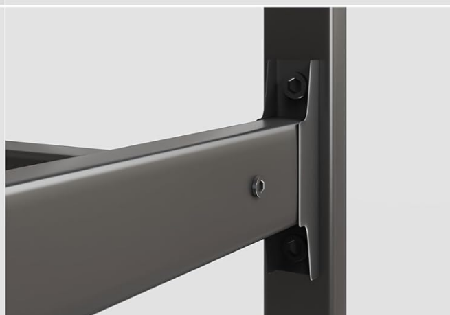
Image: Features designed to prevent noise and mattress slipping.