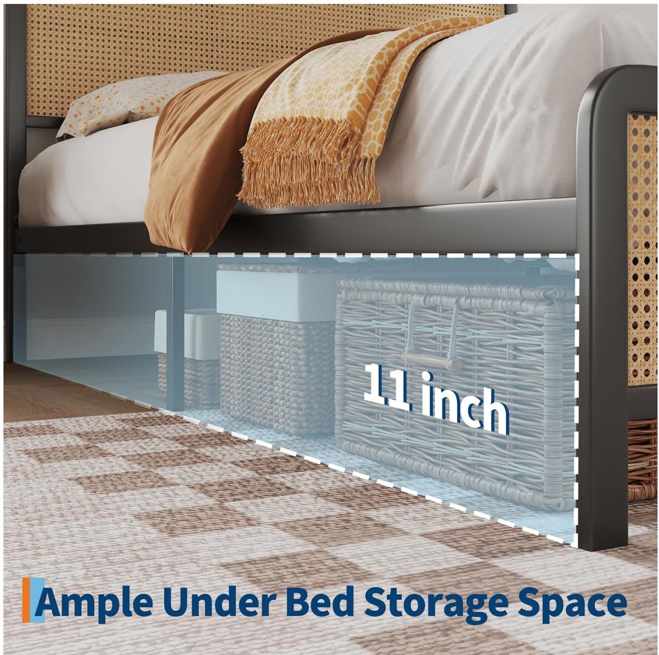
Image: Illustration of the 11-inch under-bed storage space.