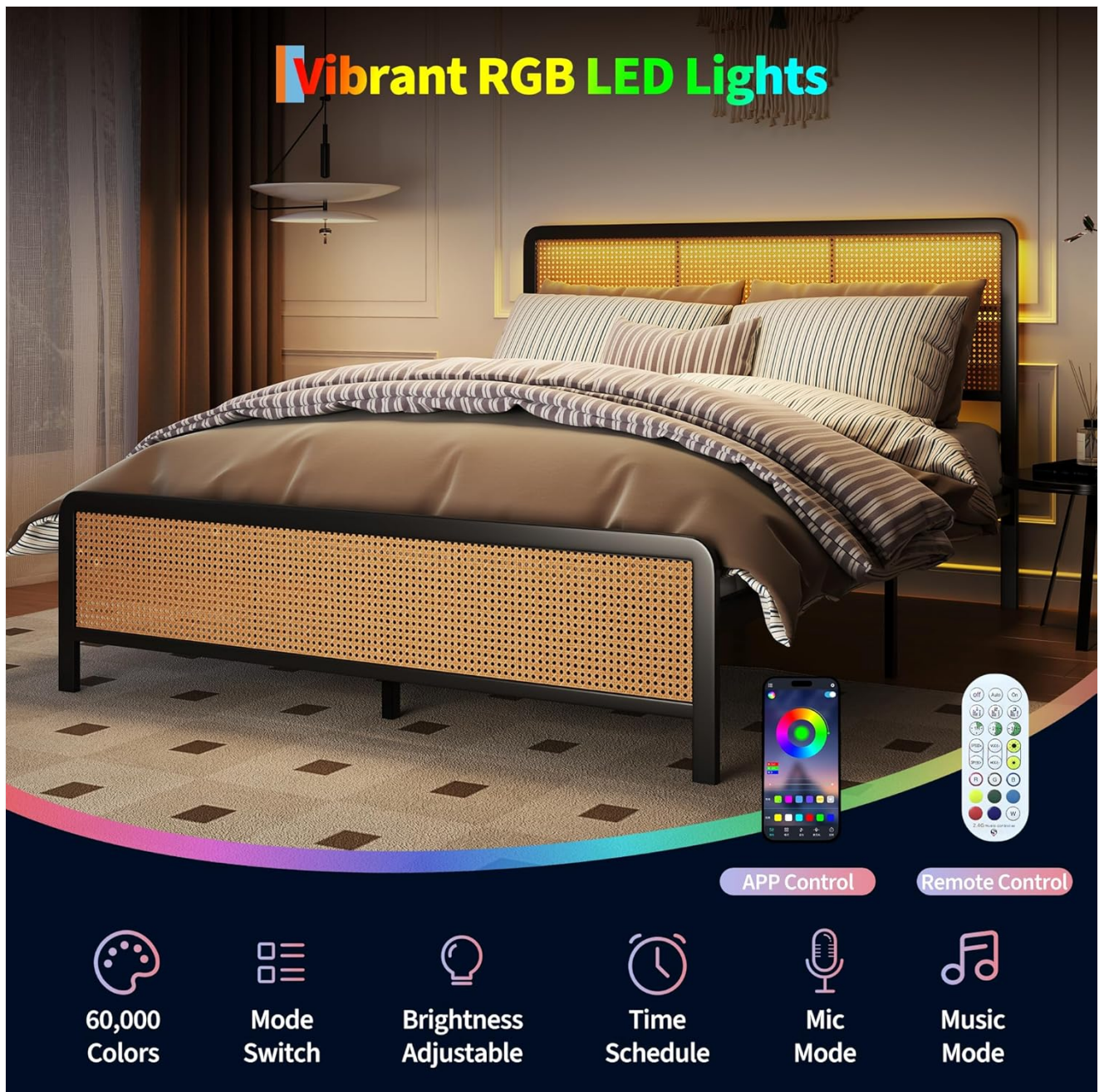
Image: Overview of RGB LED light features and control methods.