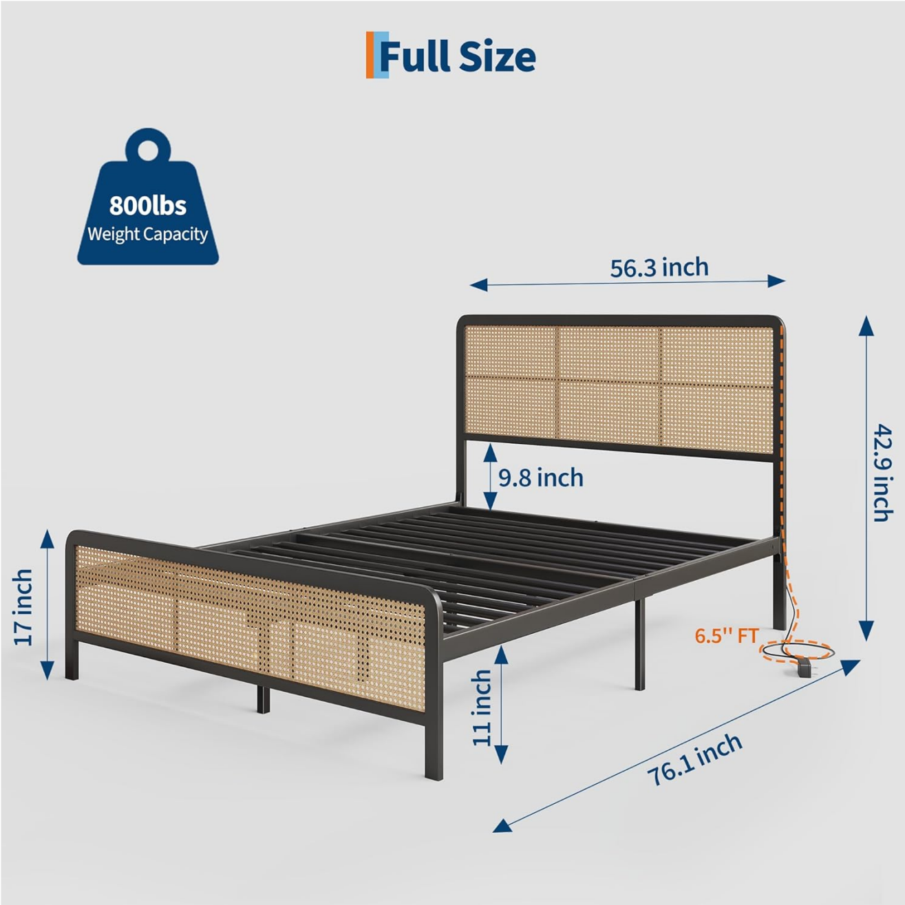
Image: Full size bed frame dimensions and weight capacity.