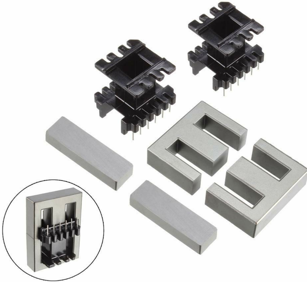
Figure 2: Assembled EI40 Ferrite Core Transformer Coils. This image shows two complete units, each comprising ferrite halves and a bobbin.