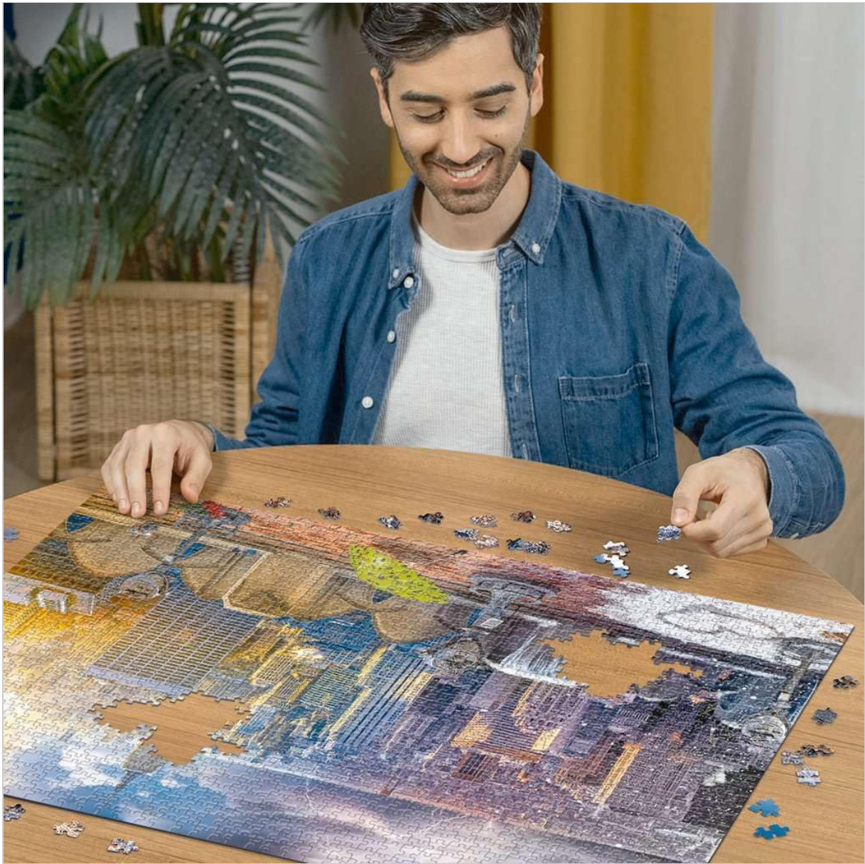
Image 2: A person engaged in assembling the puzzle, demonstrating the typical setup.