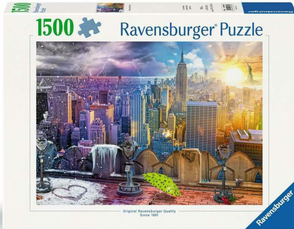
Image 1: The completed Ravensburger Seasons of New York 1500 Piece Jigsaw Puzzle.