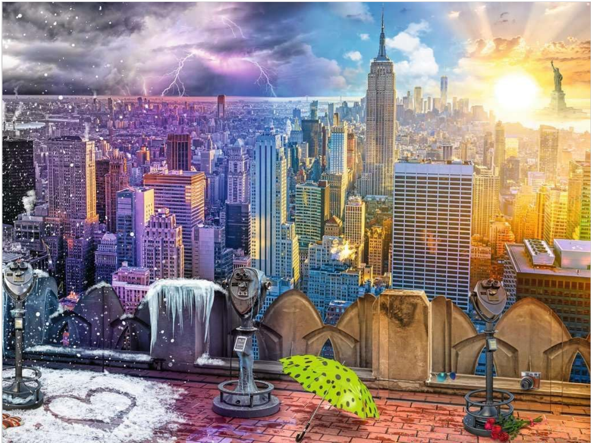
Image 3: A close-up of the puzzle's artwork, illustrating the detailed imagery for piece matching.