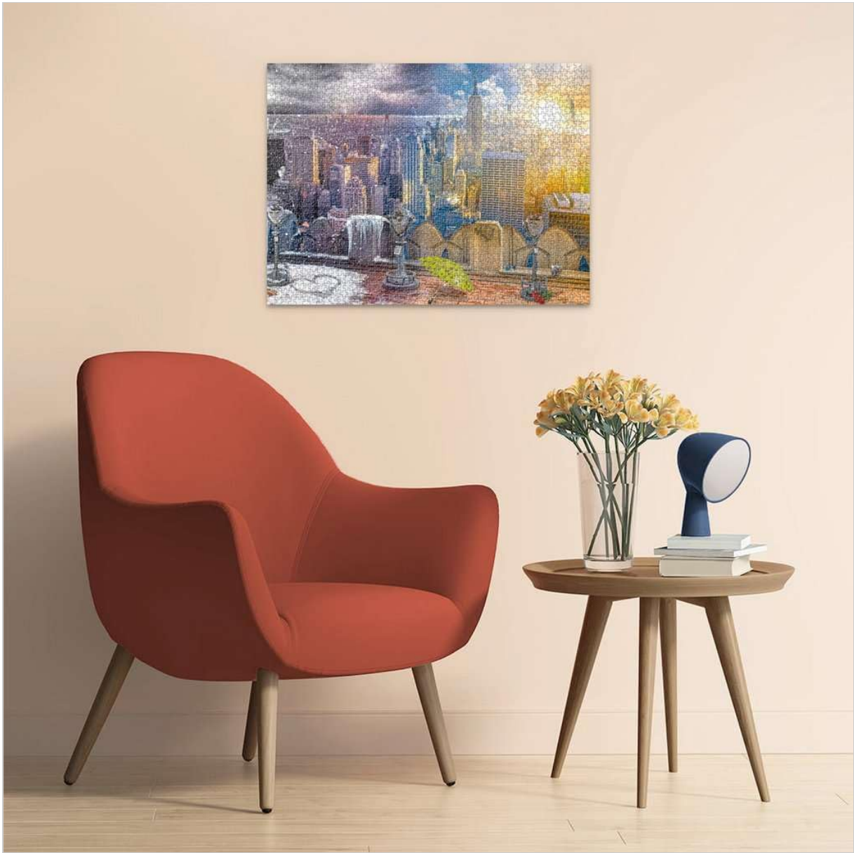
Image 4: The completed puzzle mounted for display, illustrating a common preservation method.